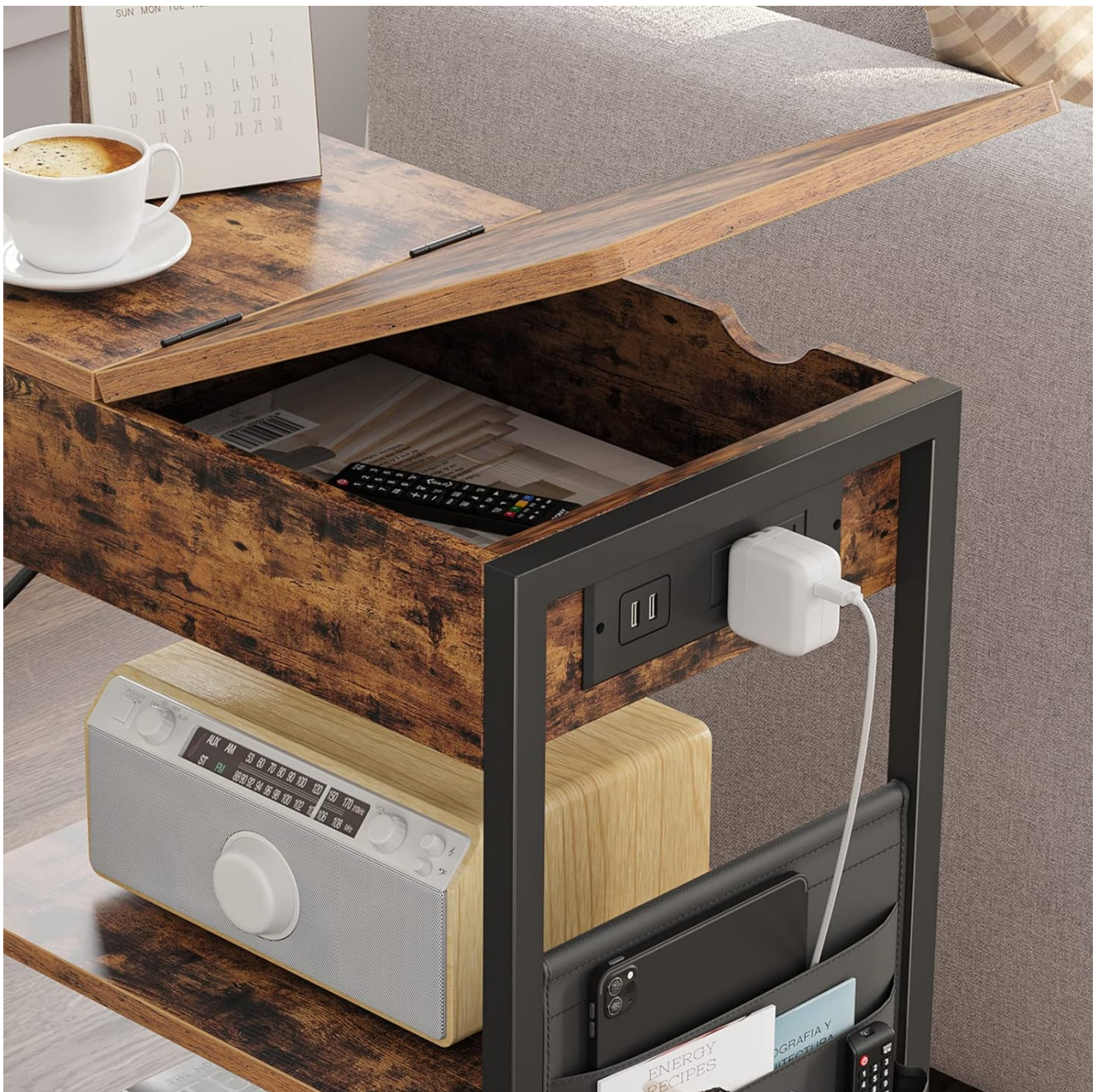
Image 5: A close-up of the fabric storage bags attached to the side of the table, demonstrating their capacity for various small items.