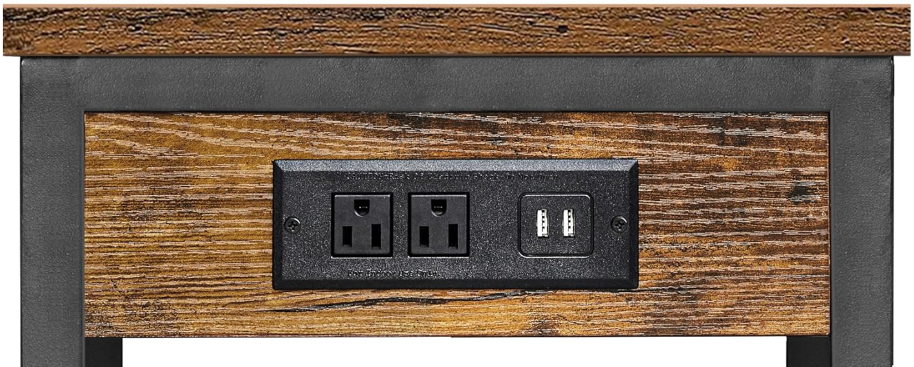
Image 3: A detailed view of the charging station, showing two AC outlets and two USB ports, with a phone charging via one of the USB ports.