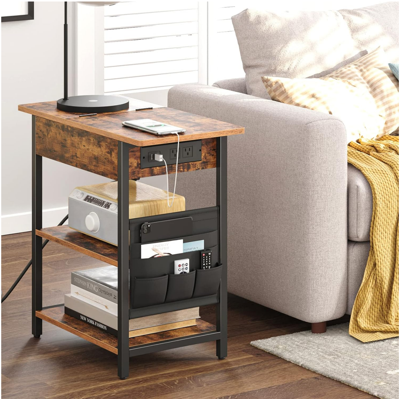
Image 2: The assembled end table positioned next to a sofa, demonstrating its functional design and integration into a living space.