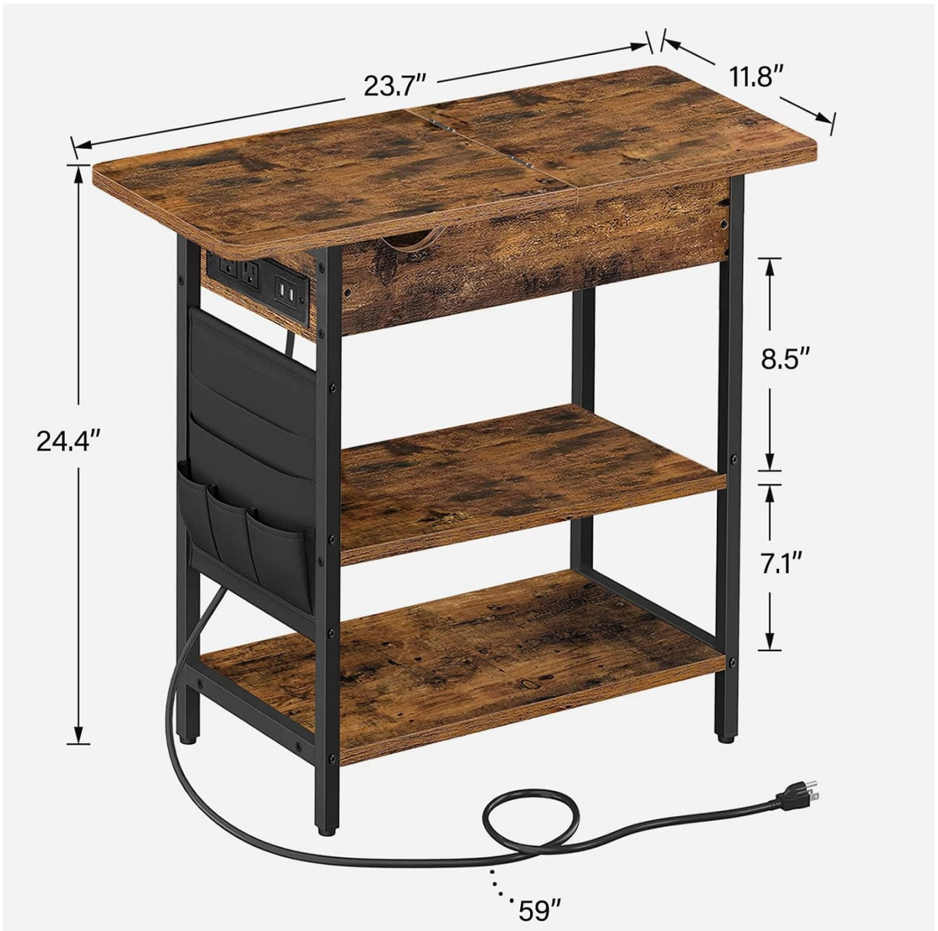
Image 7: A diagram illustrating the key dimensions of the TUTOTAK TB01BB051 End Table, including height, width, and depth.