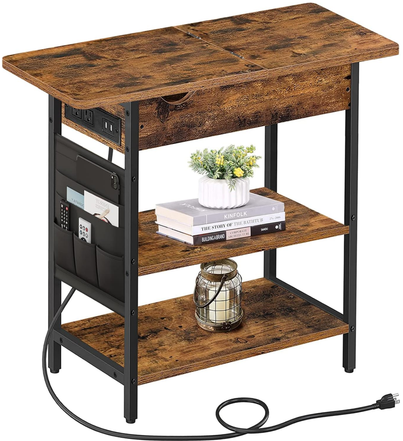
Image 1: Fully assembled TUTOTAK TB01BB051 End Table, showcasing its rustic brown finish, black metal frame, integrated charging station, and fabric storage bags.