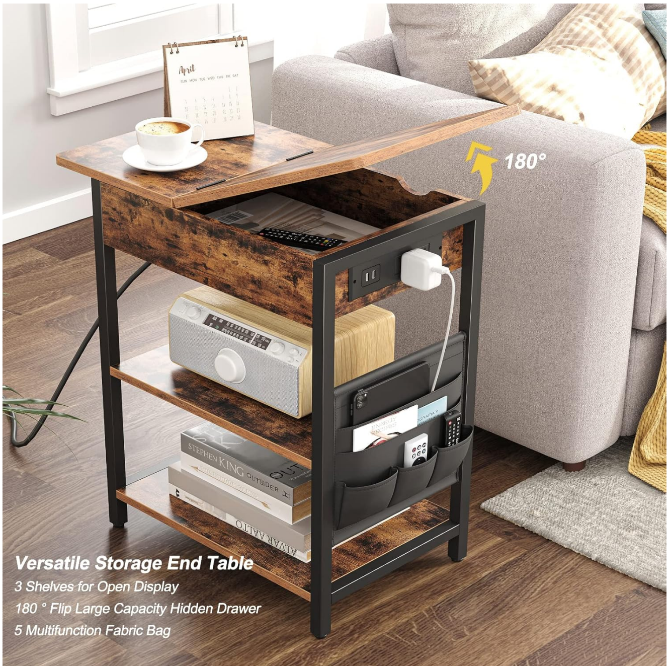
Image 4: The end table with its flip-top lid open, showcasing the hidden storage compartment suitable for small items like remote controls and magazines.