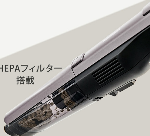
Image: Detaching and emptying the large capacity dust cup.