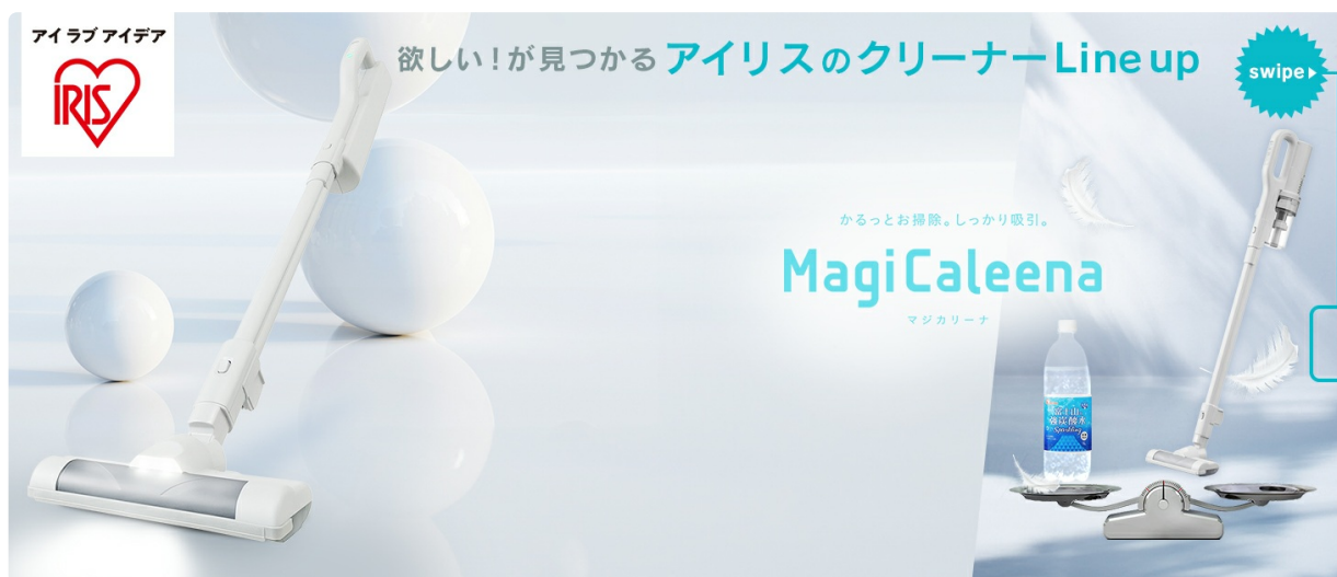
Image: The IRIS OHYAMA 2-Way Cordless Stick Cleaner, highlighting its dual functionality and available colors.

This versatile cleaner is designed for comprehensive home cleaning, functioning as both a stick vacuum for floors and a handheld vacuum for detailed cleaning. Its stylish, lightweight, and slim design ensures ease of use and blends seamlessly into any living space. The cordless operation provides maximum flexibility, allowing you to clean anywhere without being restricted by power outlets.