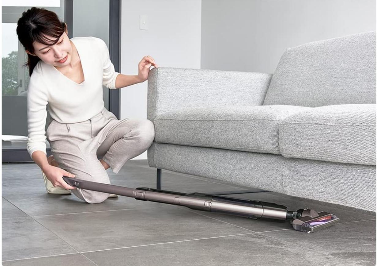
Image: Excellent maneuverability for cleaning under furniture.

ソファやベッド下など、狭い部分にも侵入。 掃除がしにくい場所も徹底的にキレイにします。