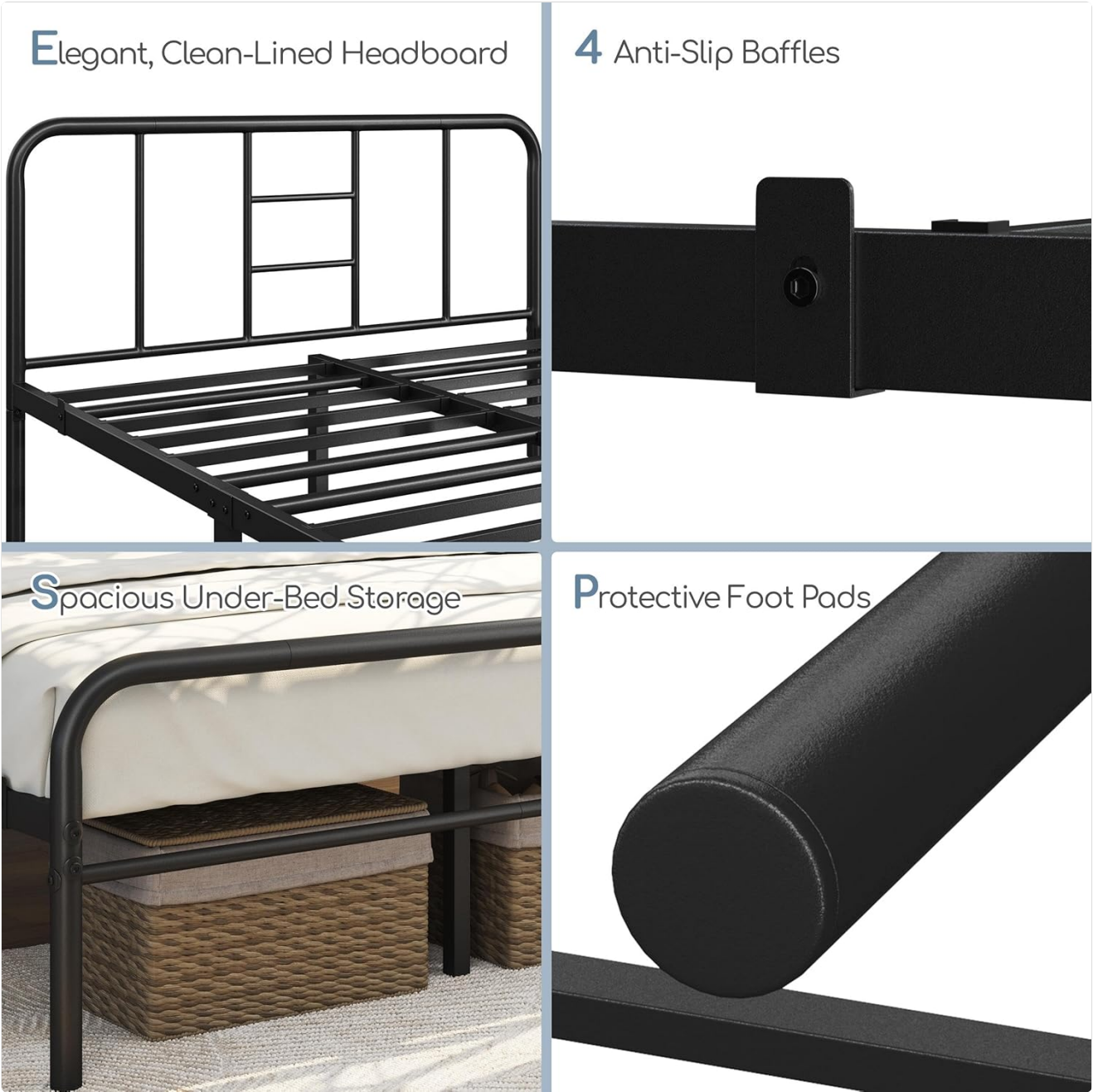
Image 6.1: Key features contributing to the bed frame's durability and user experience.