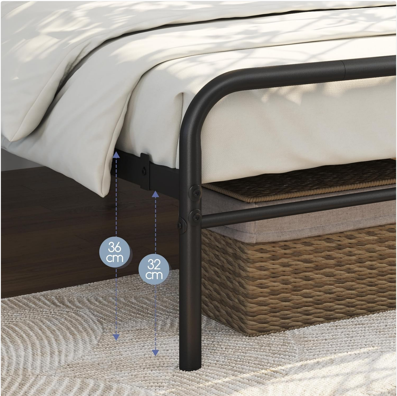
Image 5.1: Illustration of the generous under-bed storage clearance.