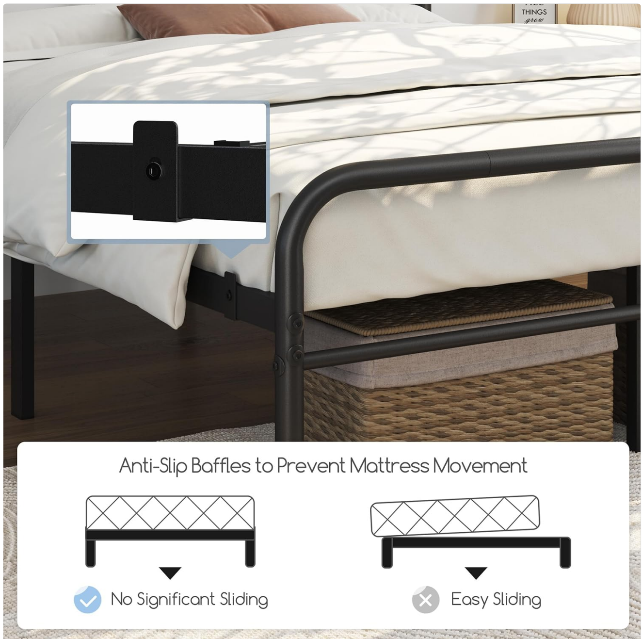
Image 4.9: Anti-slip baffles designed to keep the mattress in place.