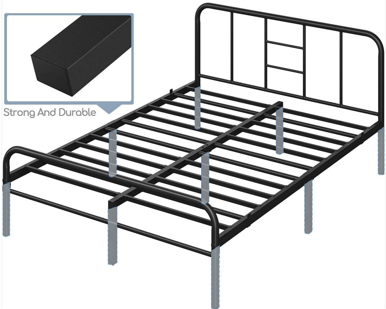
Image 4.5: Overview of the reinforced support system with multiple legs.

9 strong metal legs offer robust support, keeping the bed stable after proper assembly.