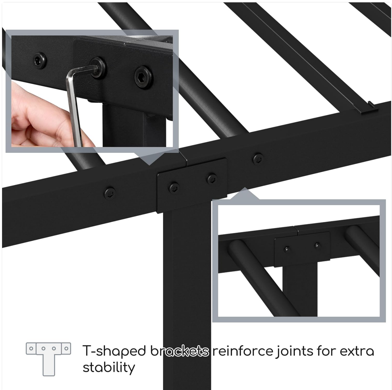
Image 4.6: Detail of T-shaped brackets for enhanced joint stability.