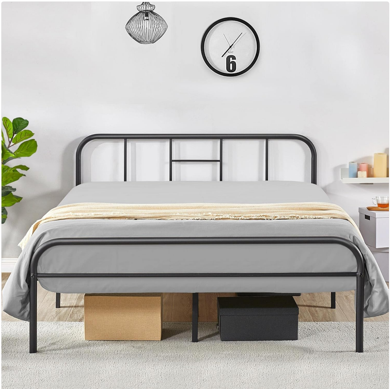
Image 1.1: The Yaheetech Double Metal Bed Frame (140x200 cm) in a typical bedroom setup.