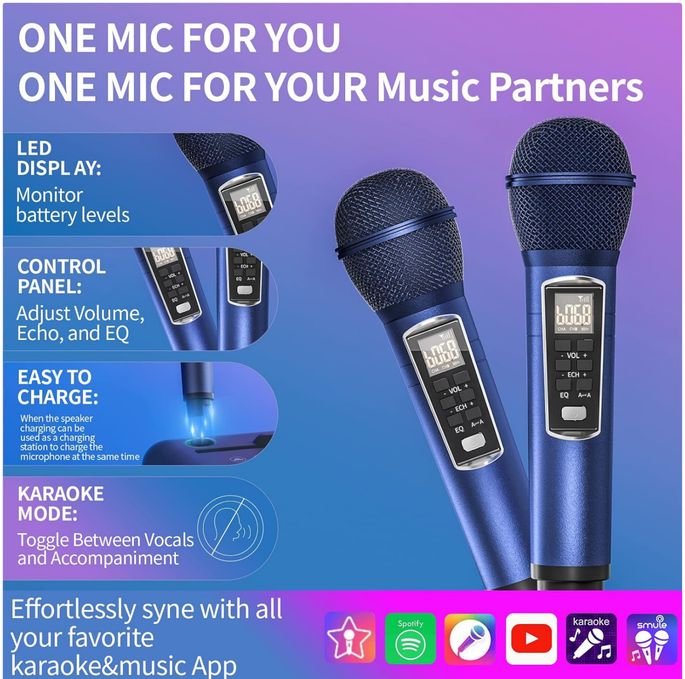
Figure 4.3: Wireless microphone features including LED display, control panel, and charging method.