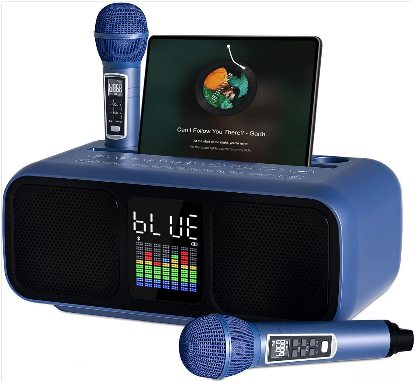
Figure 2.1: RUBEHOOW SD-318 Portable Bluetooth PA Karaoke System with two wireless microphones and a tablet in the integrated holder.