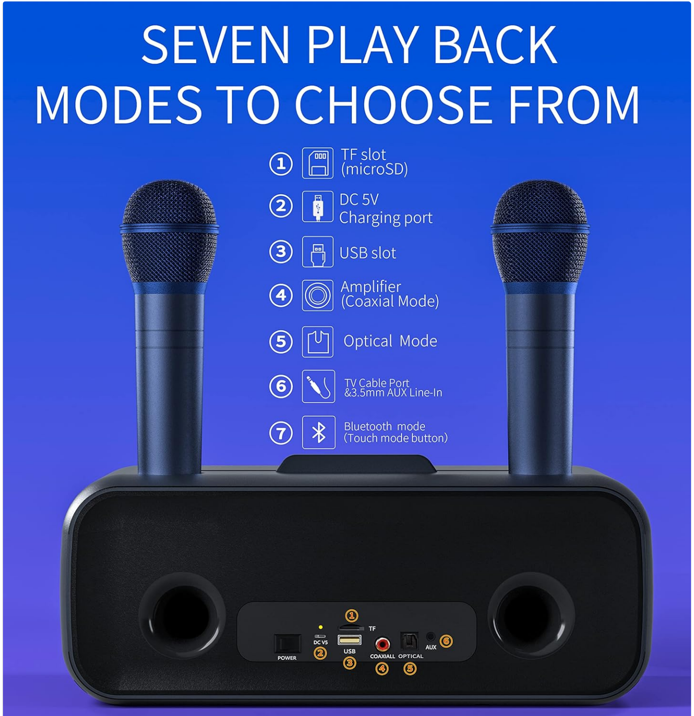
Figure 4.1: Available playback modes and corresponding input ports on the rear panel.