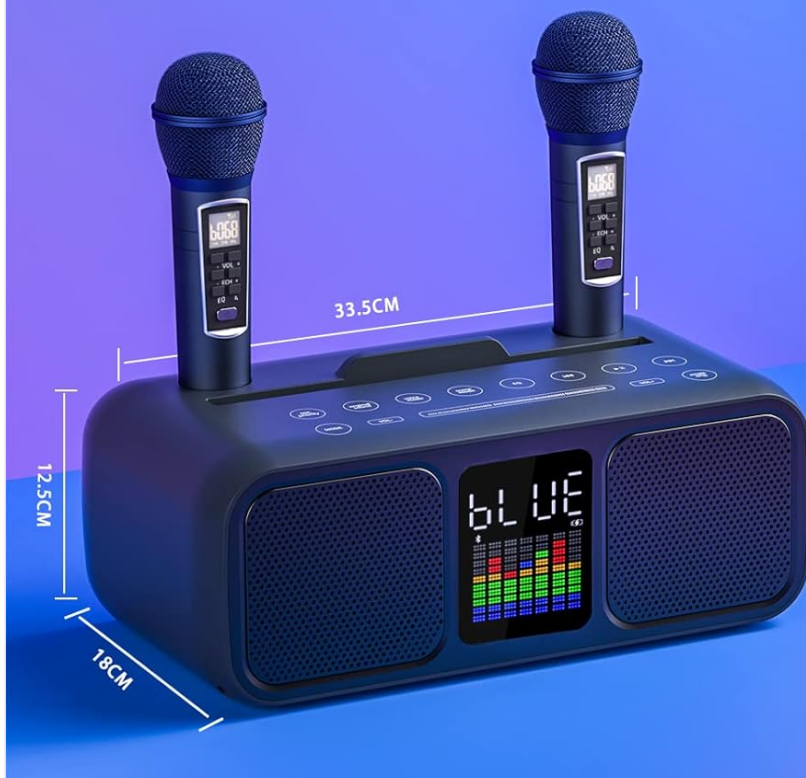
Figure 4.4: Overview of multiple karaoke modes and controls for enhanced user experience.