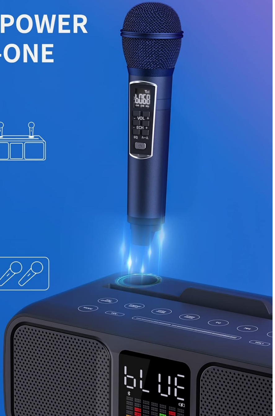
Figure 3.1: Charging the main speaker unit and wireless microphones.

Then just plug it in for a quick recharge