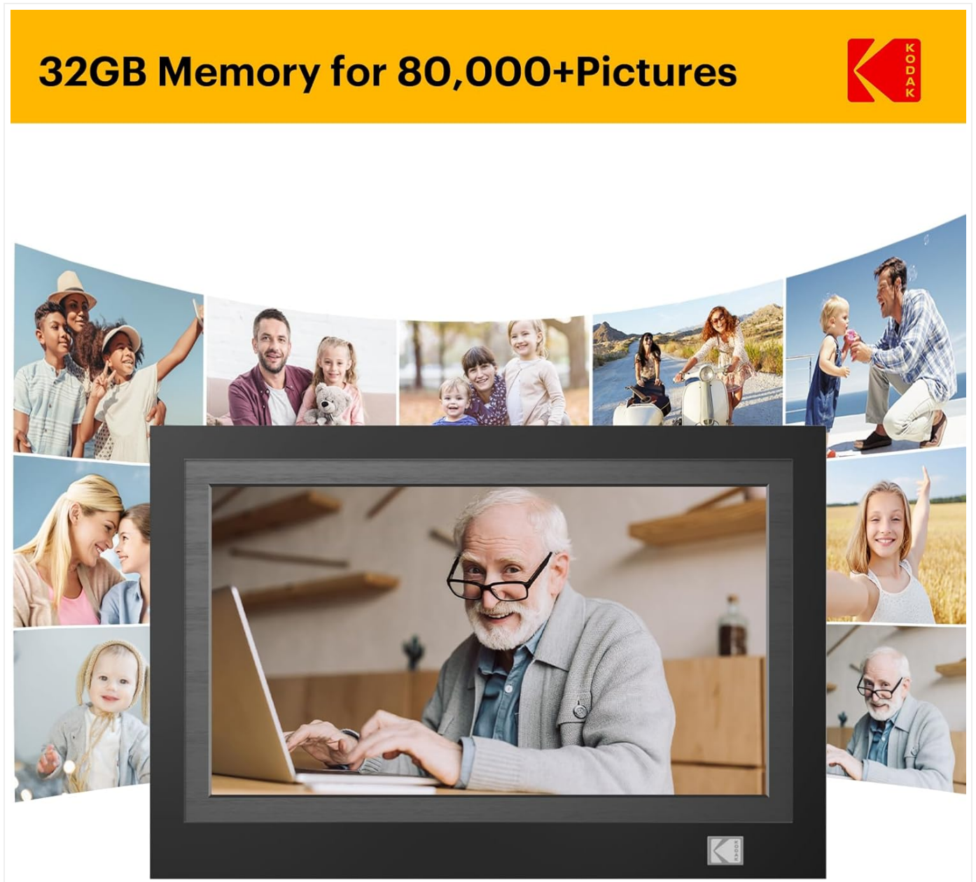
Figure 5.1: The frame offers 32GB of internal storage for approximately 80,000 photos.