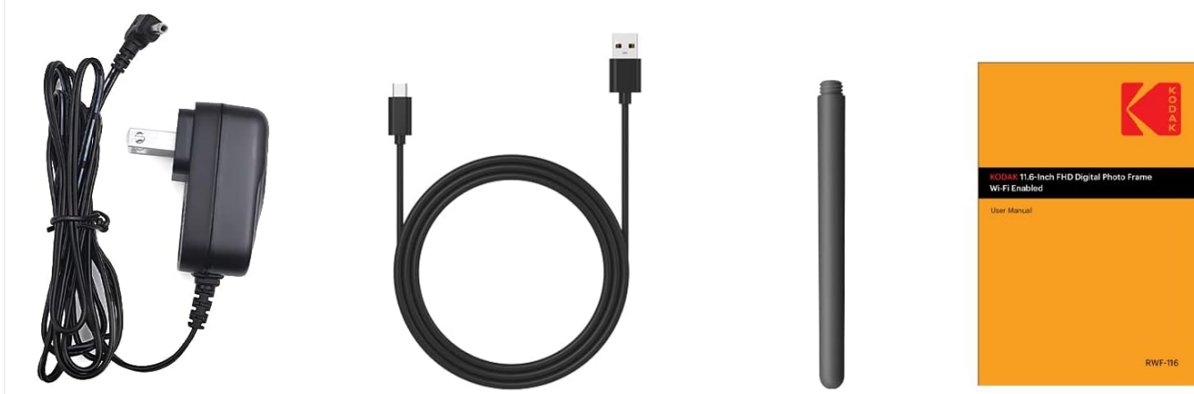
Figure 2.1: Included items in the KODAK RWF-116 package.