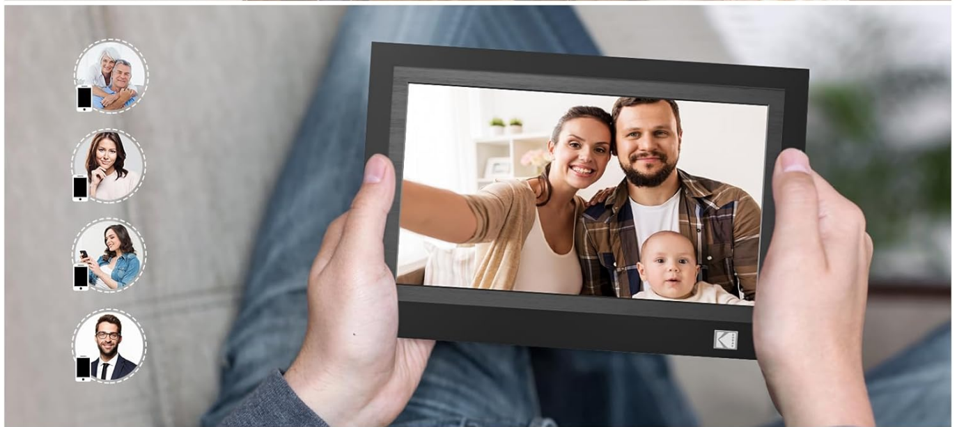
Figure 4.2: Wireless sharing via the KODAK app.