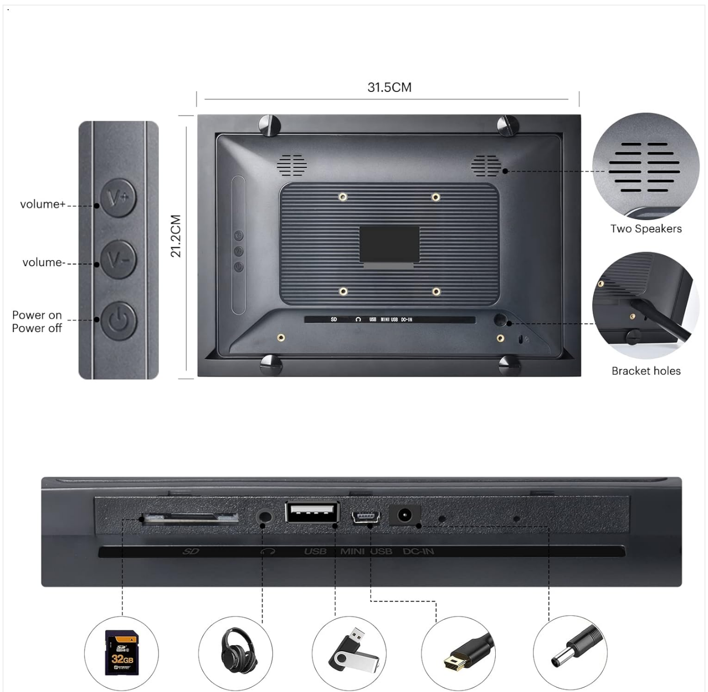
Figure 3.2: Rear view with port and button labels.