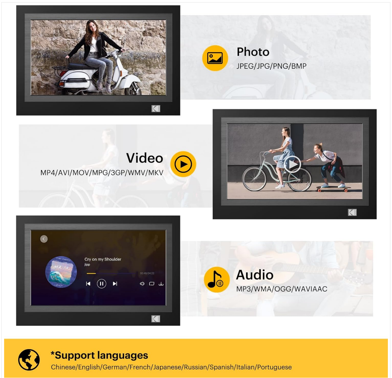
Figure 5.4: Supported media formats.