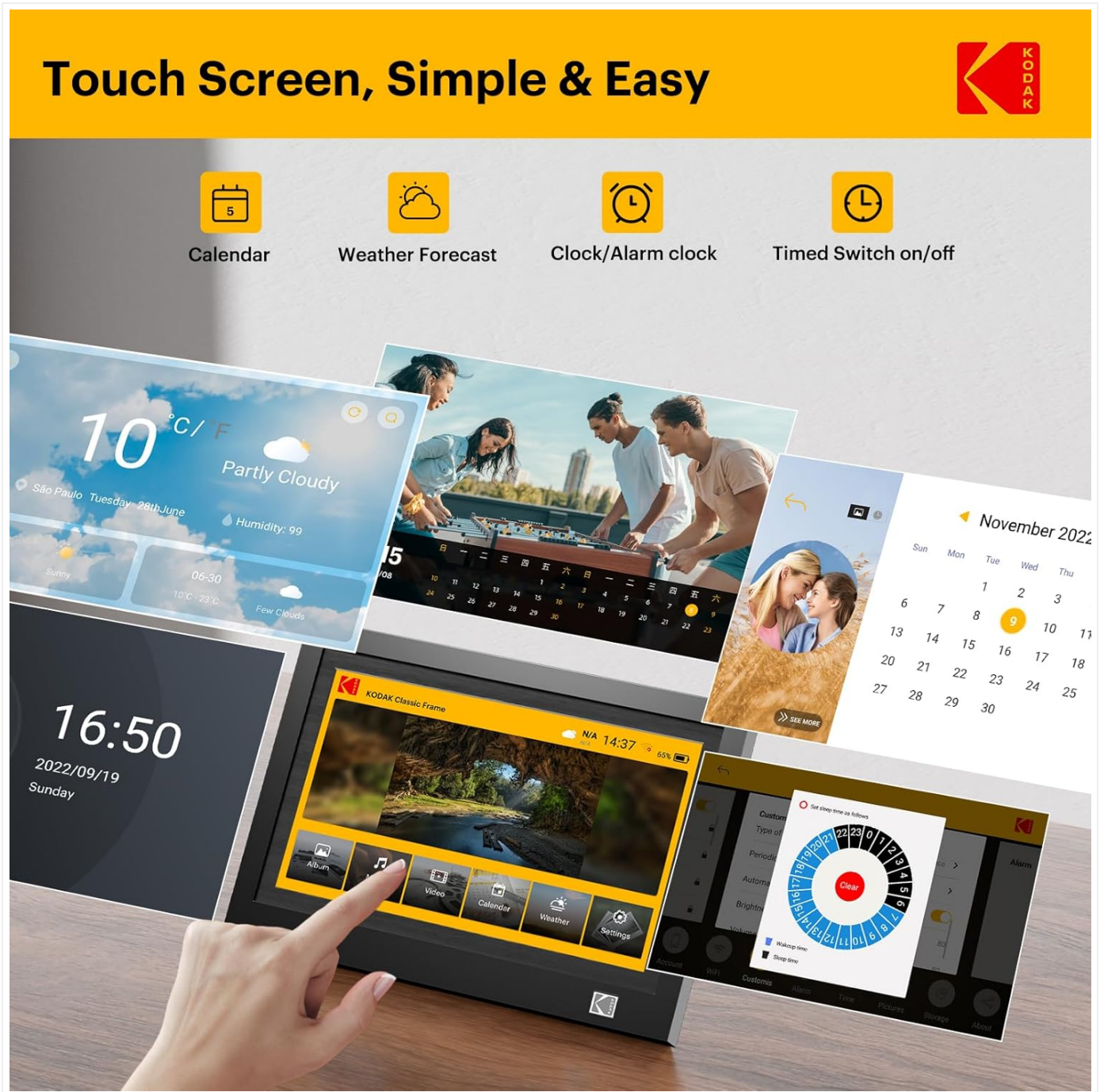
Figure 5.2: Touchscreen interface with various functions.