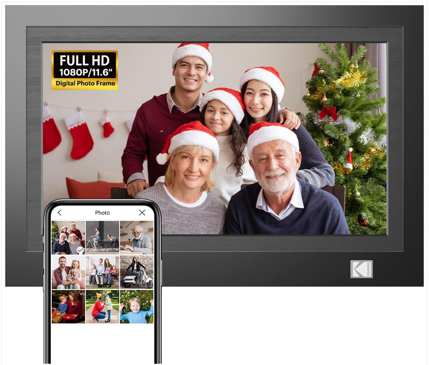
Figure 3.1: Front view of the digital picture frame and app interface.

The front of the frame features an 11.6-inch IPS FHD touchscreen display, offering a clear and vibrant viewing experience for your photos and videos. The touch interface allows for intuitive navigation and control.