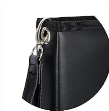
Image 5: A close-up of the detachable wrist-let handle securely attached to the display holder.