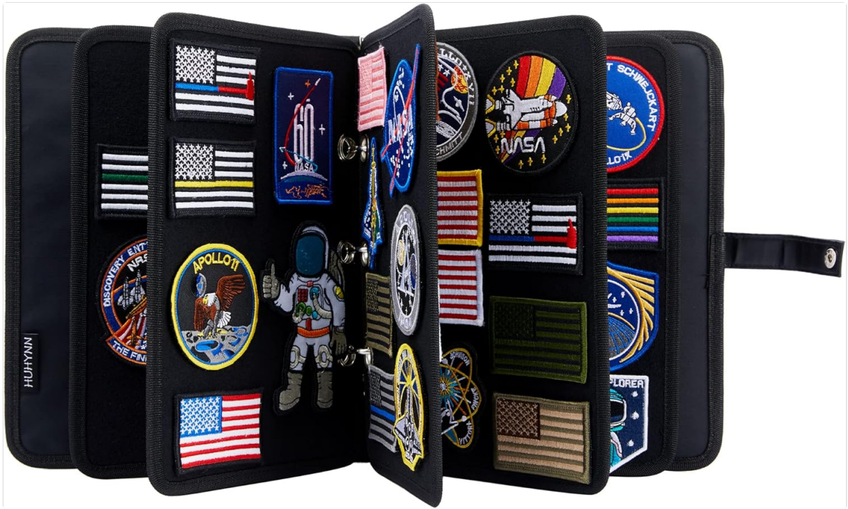
Image 1: The HUHYNN Patch Display Holder opened, displaying multiple hook and loop patches on its internal pages.