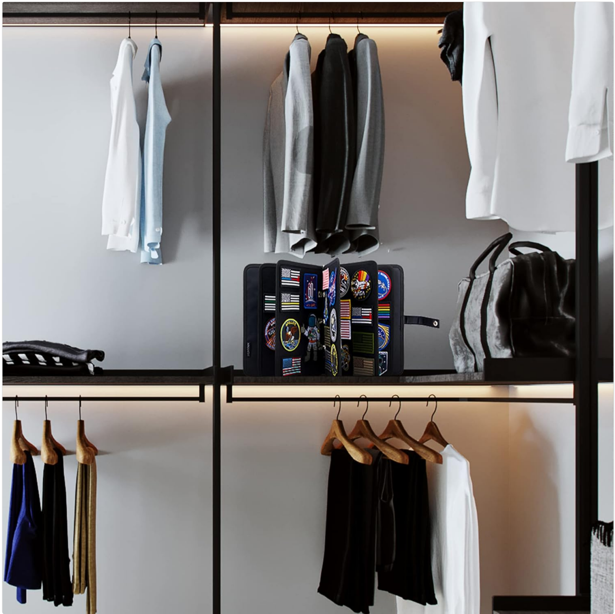
Image 6: The HUYNN Patch Display Holder hanging by its wrist-let handle, demonstrating its portability.