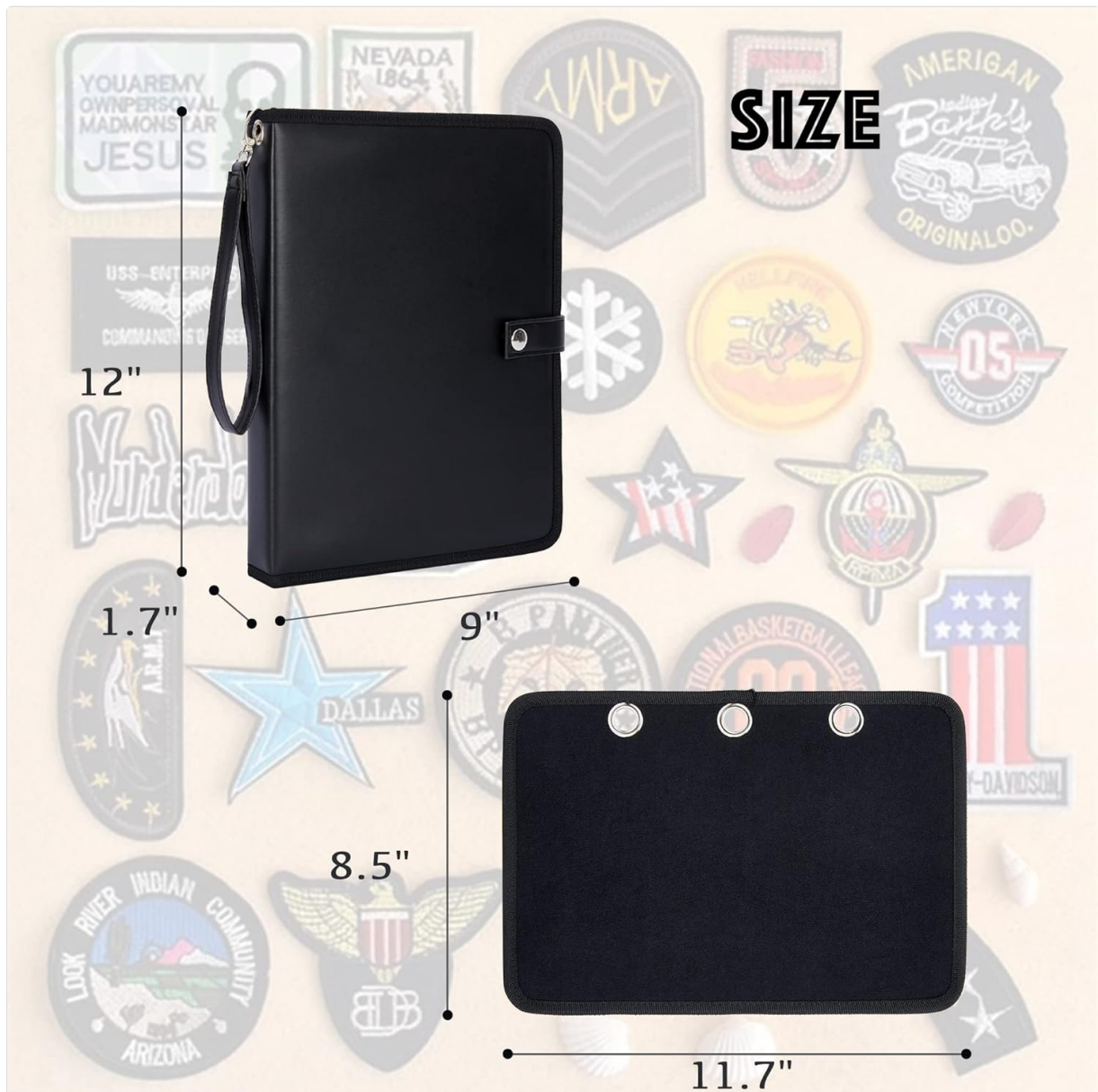
Image 7: A diagram detailing the dimensions of the HUHYN Patch Display Holder and its internal panels.