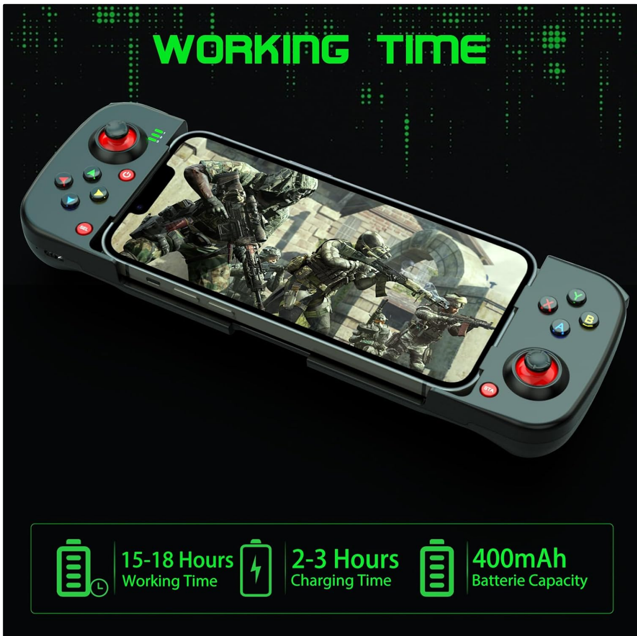
Image: This image illustrates the working time, charging time, and battery capacity of the Jojo D3 controller. It shows a working time of 15-18 hours, a charging time of 2-3 hours, and a 400mAh battery capacity.