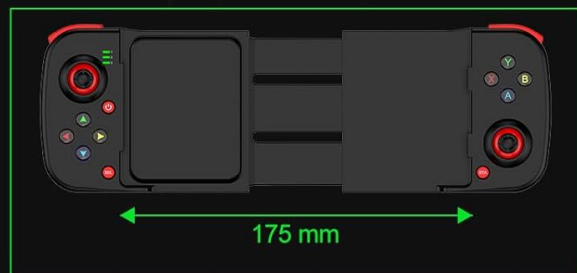
Image: This image demonstrates the telescopic holder of the Joso D3 controller, supporting mobile phones from 5.0 to 6.9 inches. It also shows the controller's dimensions, with a minimum width of 128mm and an extended width of 175mm.