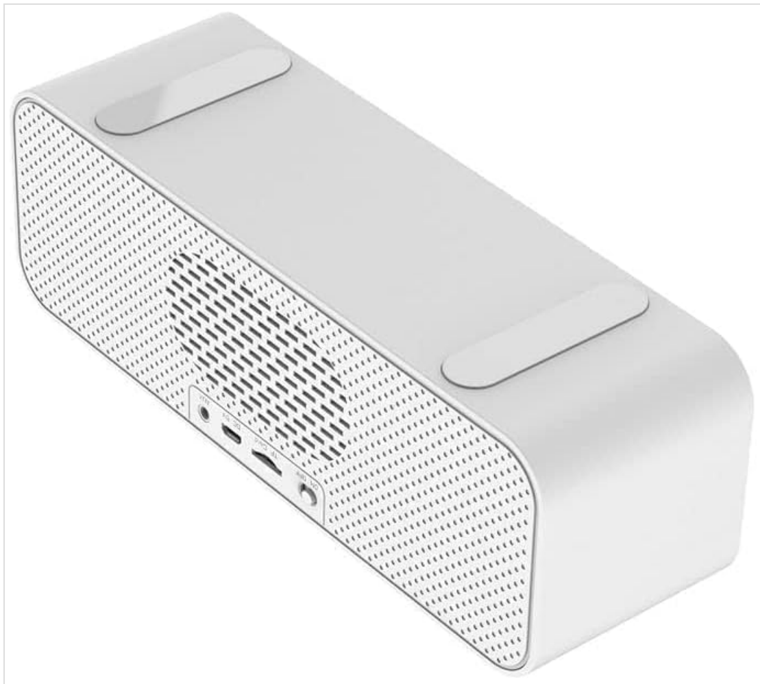
Figure 2: Rear view of the Riversong SP09 Bluetooth Speaker, displaying the charging port, AUX input, and memory card slot.