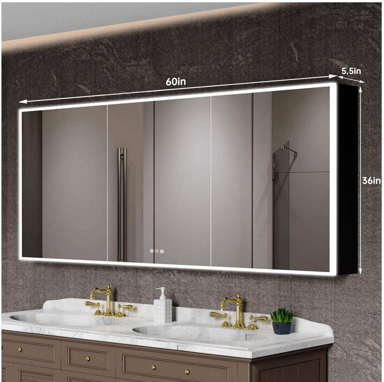
Image 4.2: Product Dimensions. This image provides a visual representation of the cabinet's dimensions: 60 inches wide, 36 inches high, and 5.5 inches deep, crucial for planning installation space.