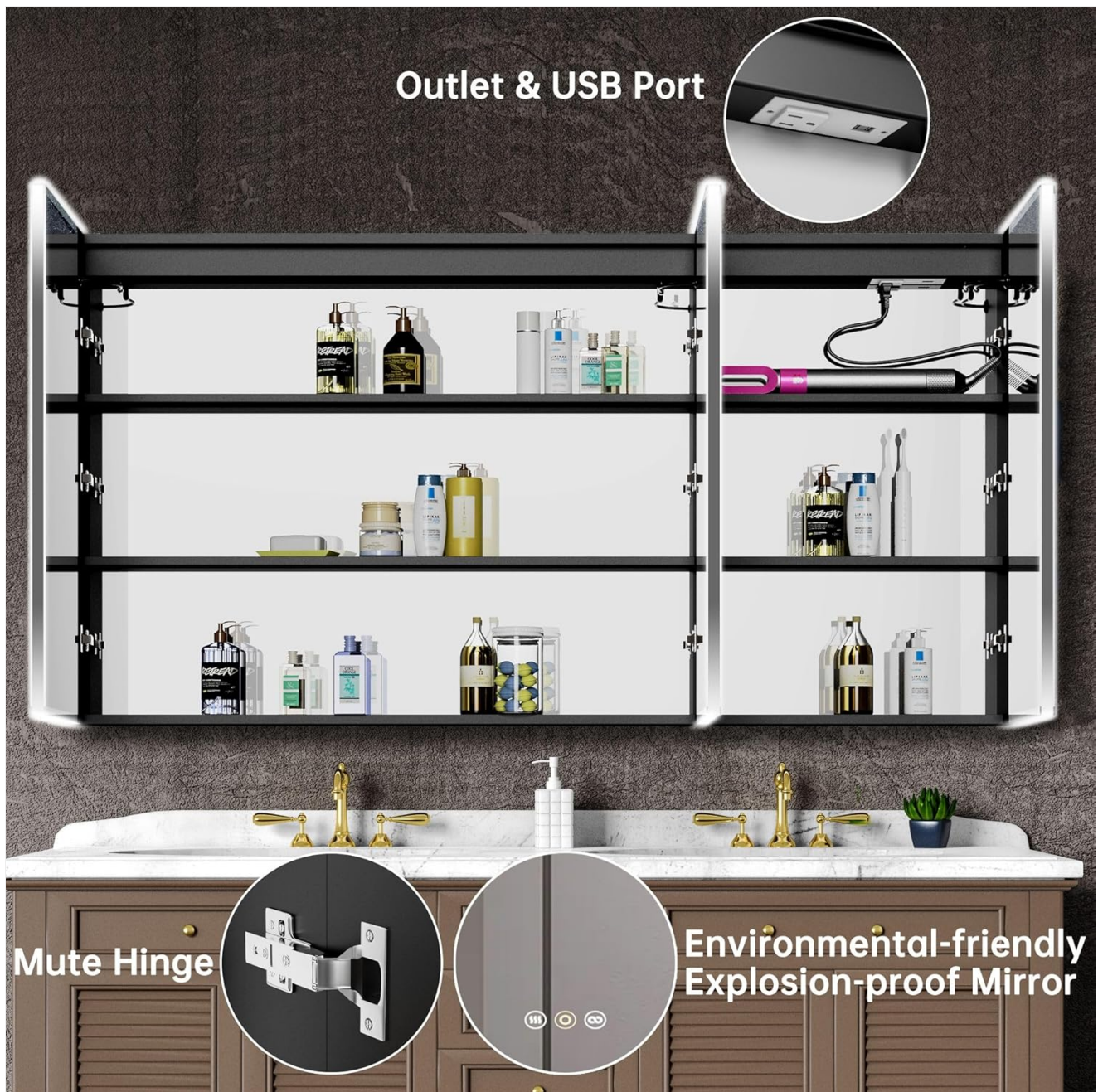
Image 5.5: Internal Outlet & USB Port. This image highlights the convenient internal electrical outlet and USB port, ideal for charging small bathroom appliances, along with the organized storage space.