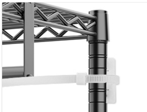
Figure 4.6: Anti-tip straps provide additional stability by securing the rack to a wall.