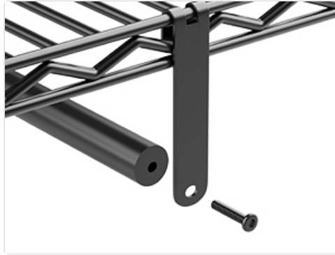
Figure 4.3: Shelves are secured by sliding them over the plastic clips on the poles.