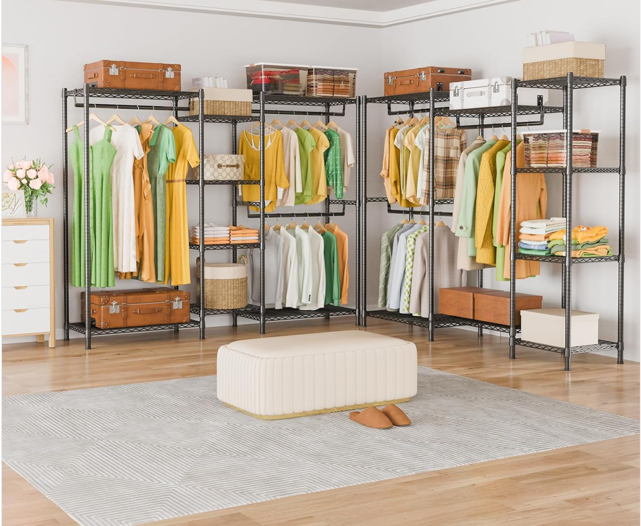
Figure 5.1: Example of the garment rack fully utilized with hanging clothes, folded items, and storage boxes on shelves.