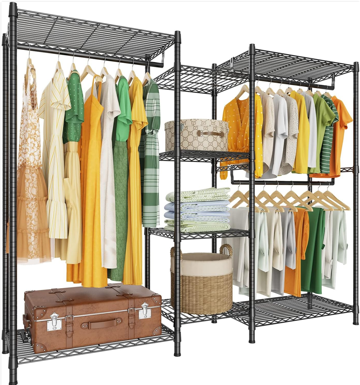
Figure 3.1: Overview of the LEHOM G6M Heavy Duty Clothes Rack, showing its various shelves and hanging rods.