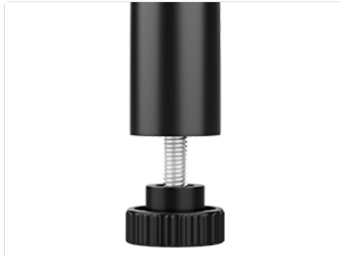
Figure 4.5: Adjustable leveling feet ensure stability on various floor surfaces.