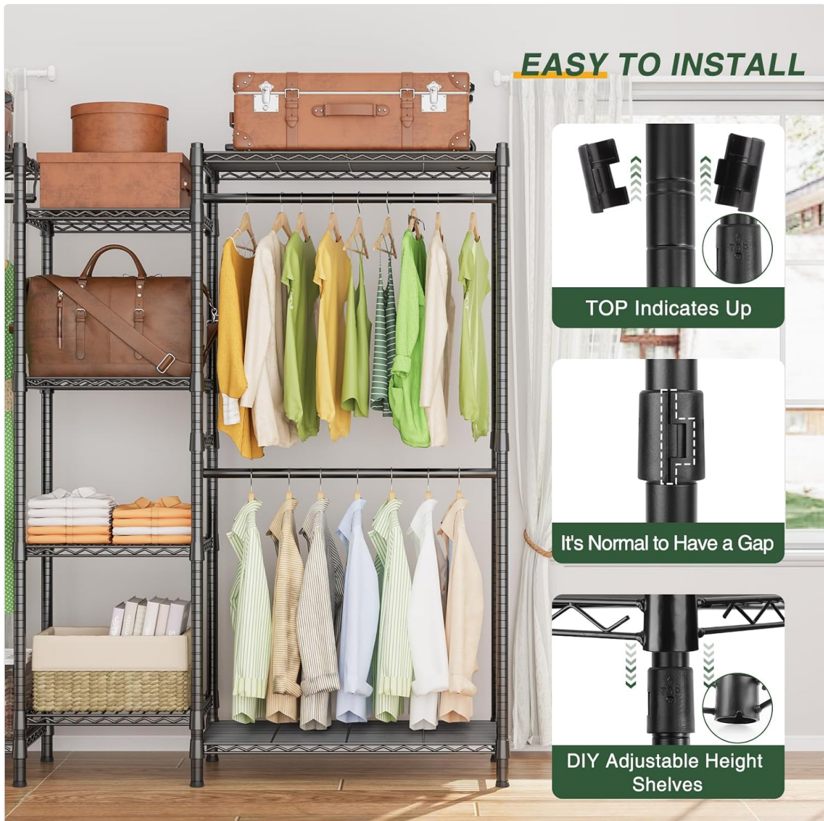
Figure 4.2: Detail showing how pole sections connect and the adjustable height mechanism for shelves. A small gap is normal at connection points.