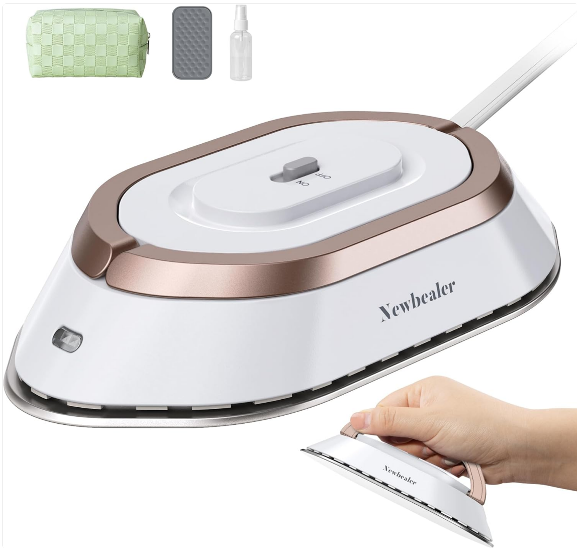
Image: The Newbealer Travel Iron in white, accompanied by its green zippered pouch, grey silicone mat, and clear spray bottle.