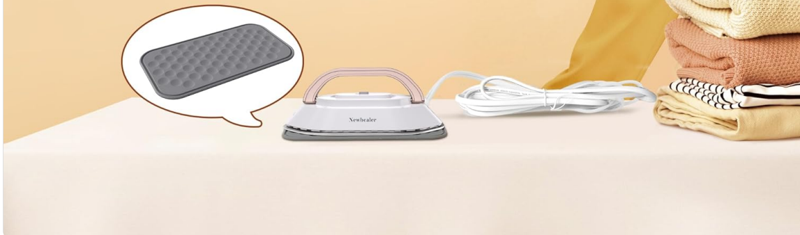
Image: The Newbealer Travel Iron resting on its grey heat-resistant silicone mat, demonstrating safe placement during use.

Use the heat-resistant silicone stand during use to rest the hot iron, no damage to desktop.