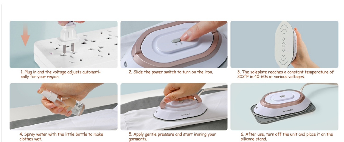
Image: A step-by-step visual guide demonstrating how to set up and begin using the Newbealer Travel Iron, from plugging it in to turning it on.