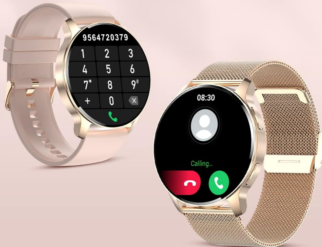
Figure 5: Make/Receive Phone Call Function

The integrated AI voice assistant allows you to perform various tasks using voice commands, such as making calls or asking for weather updates.