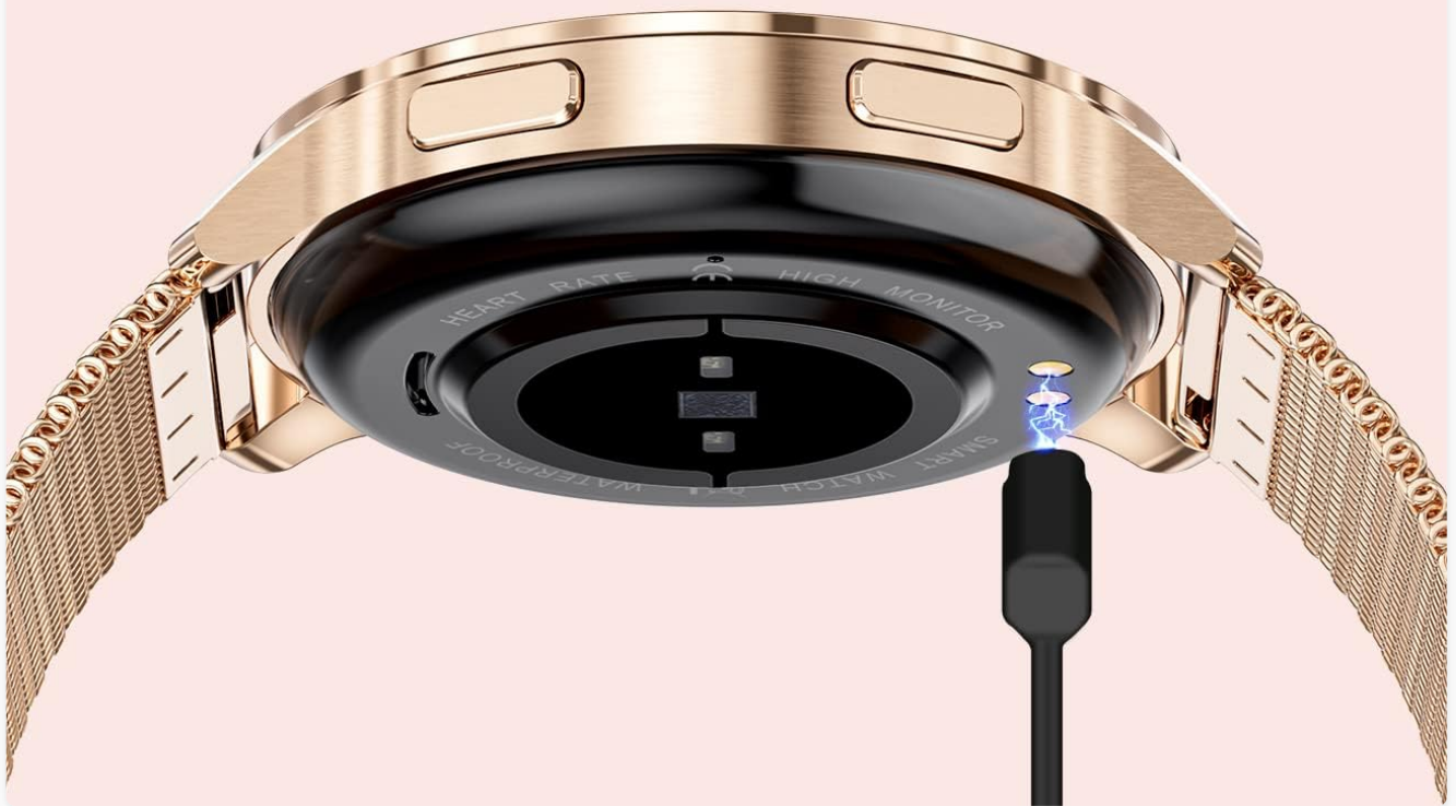
Figure 3: Battery Life and Charging