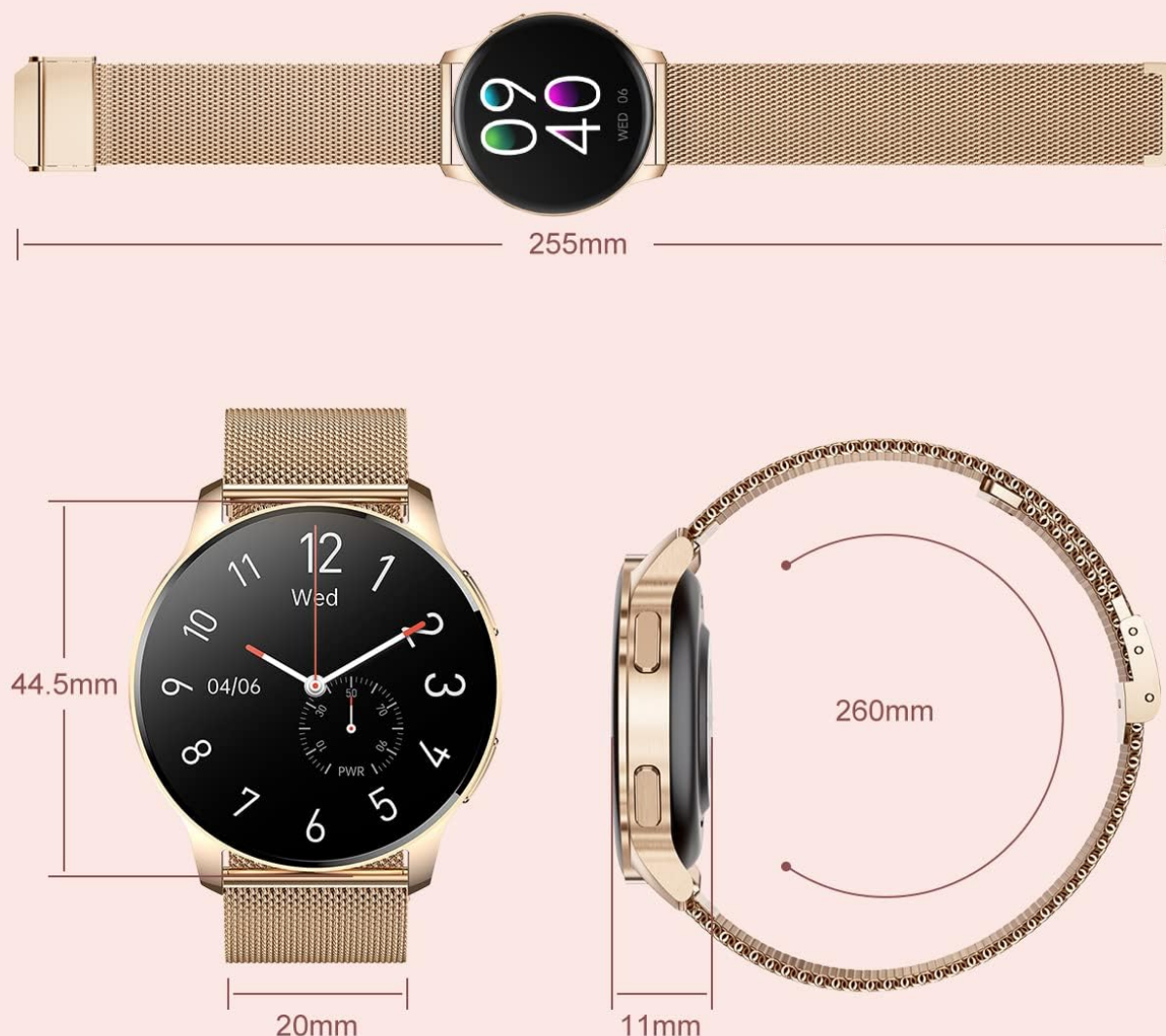
Figure 2: Included Straps and Watch Dimensions