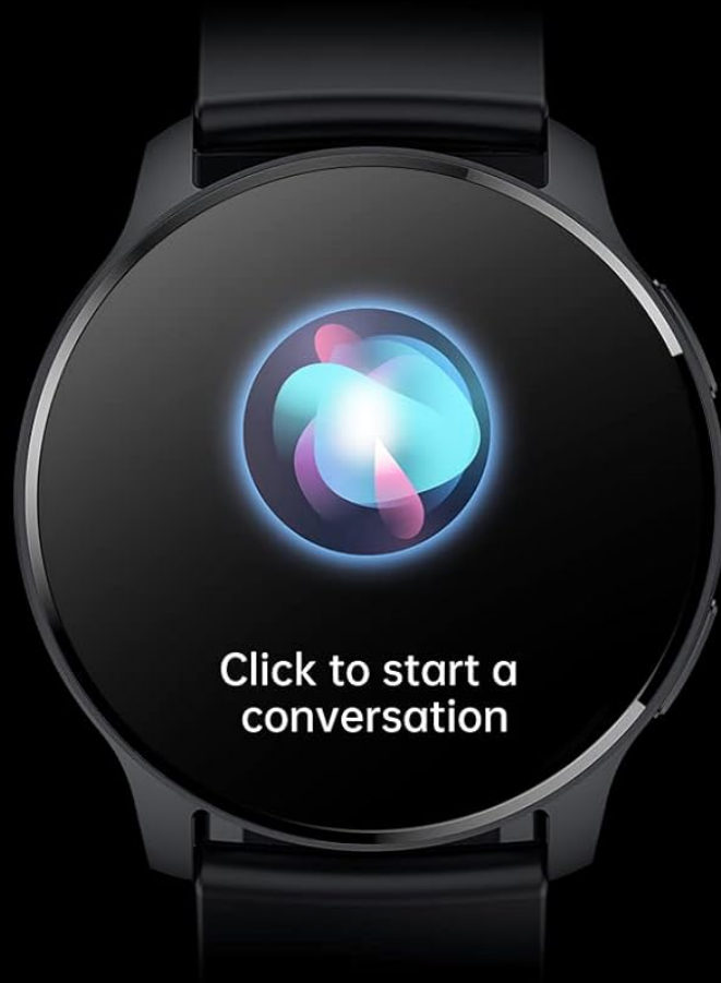
Figure 6: AI Voice Assistant