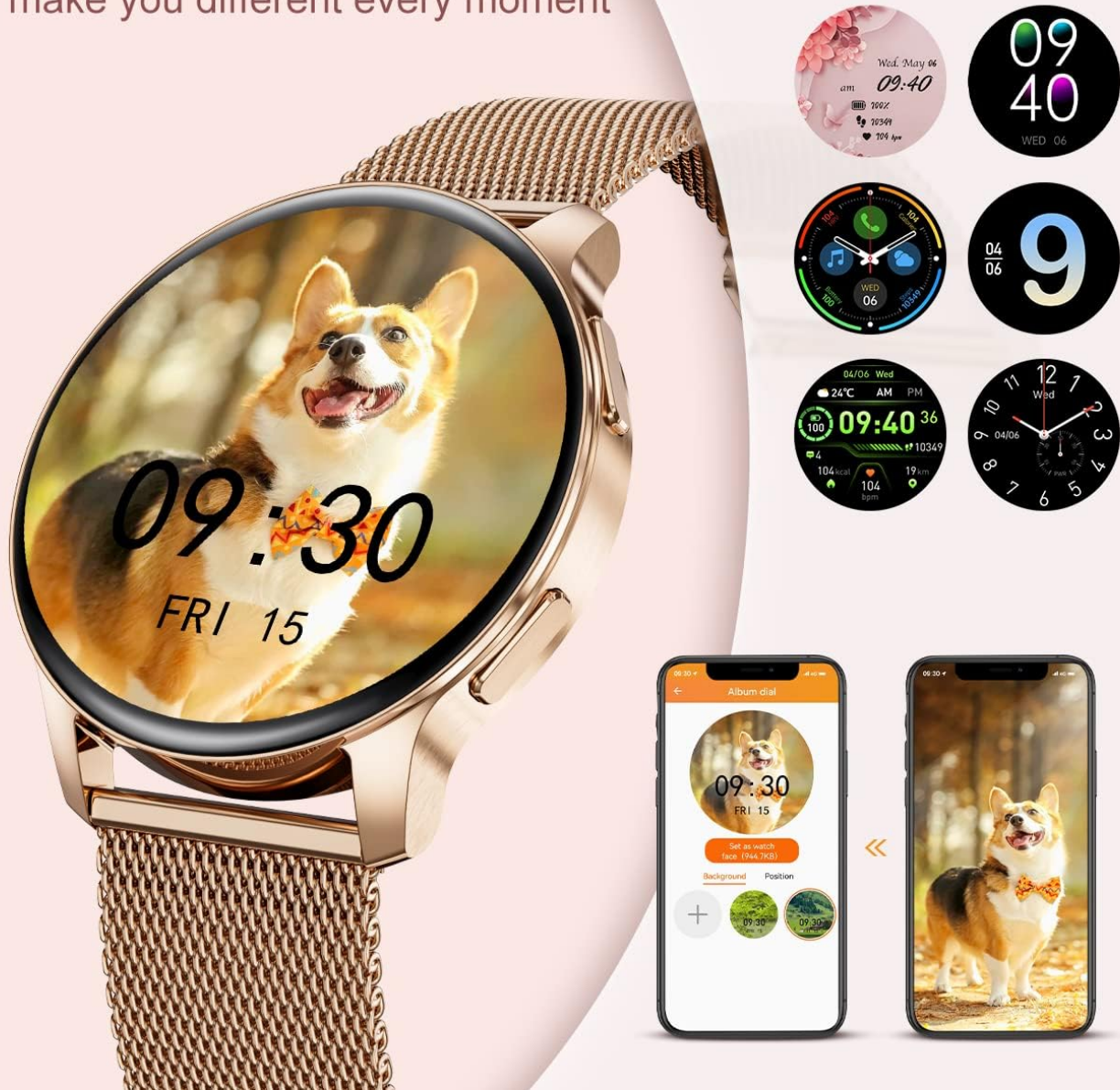
Figure 8: Personalized Dial Customization

Meet your needs for different scenes, make you different every moment