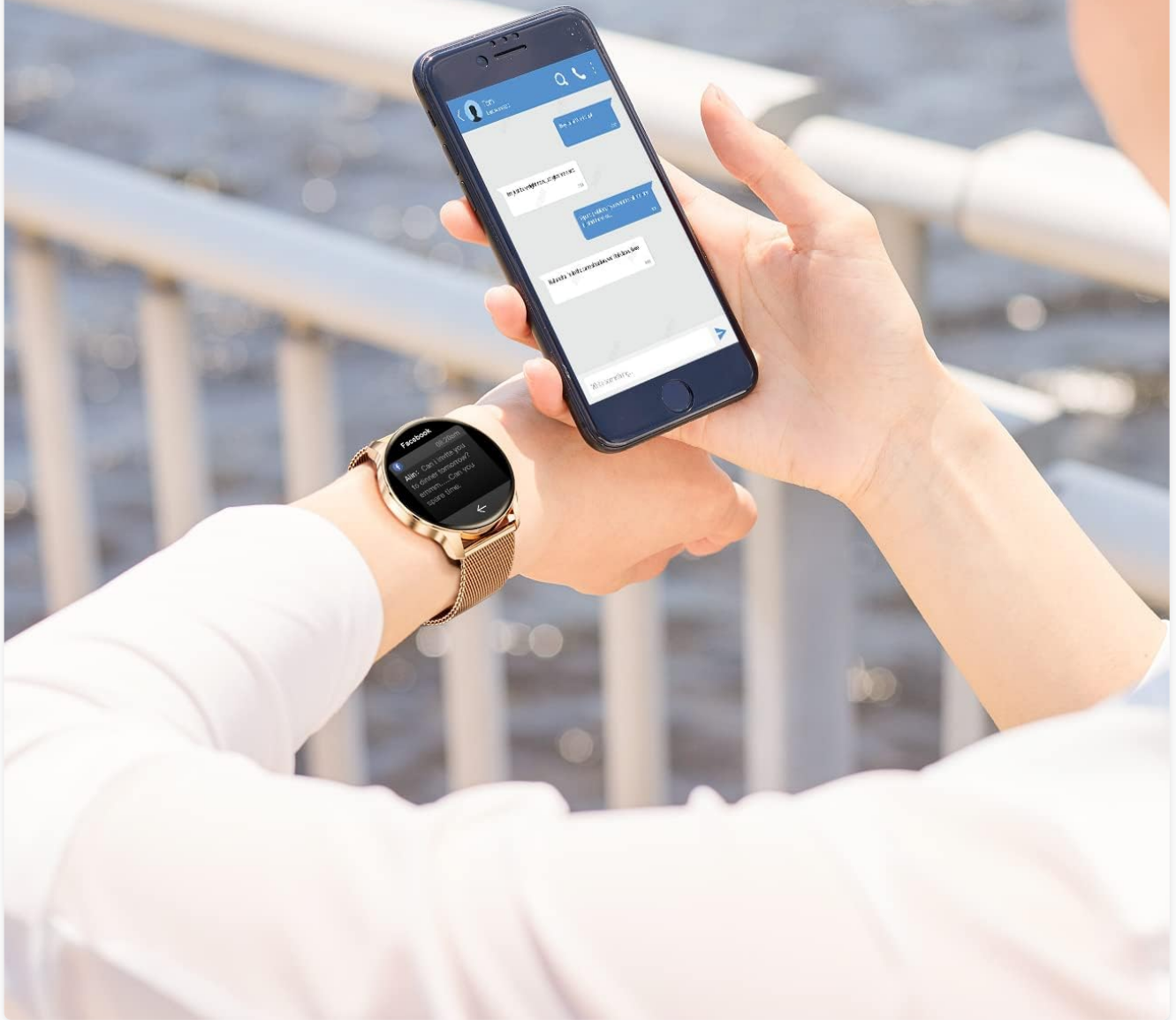
Figure 7: Messages Notification Feature