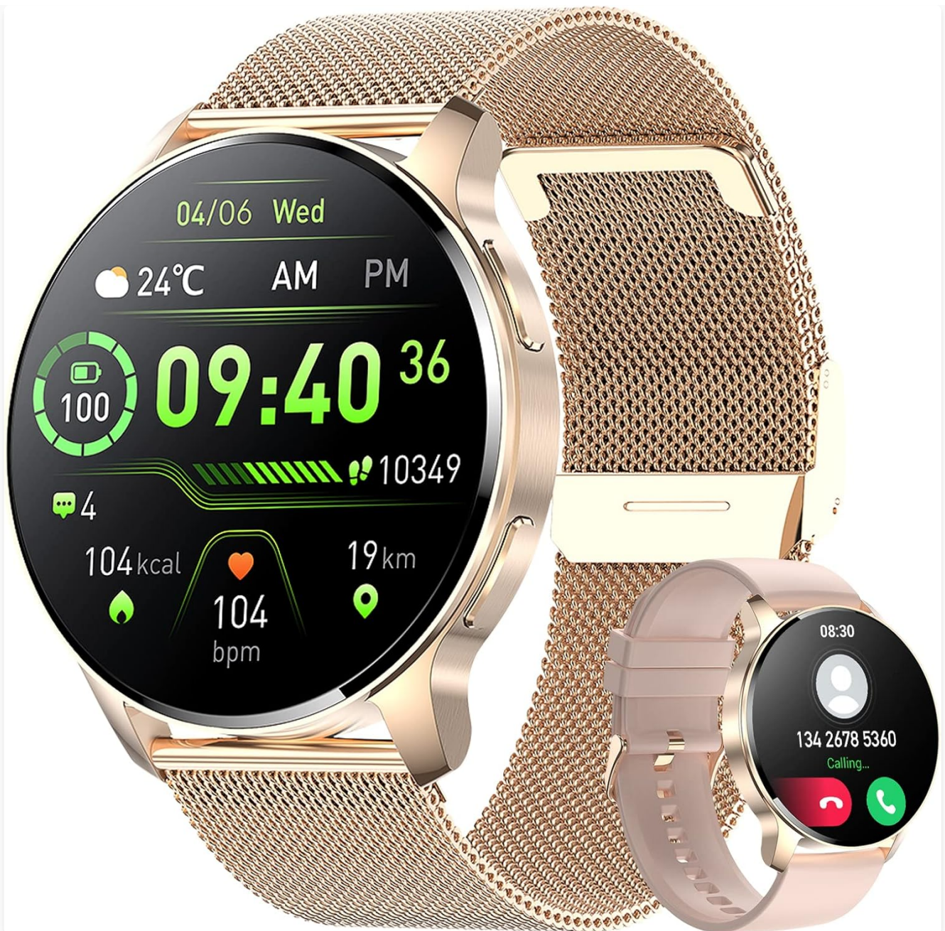
Figure 1: LIGE Smart Watch Overview