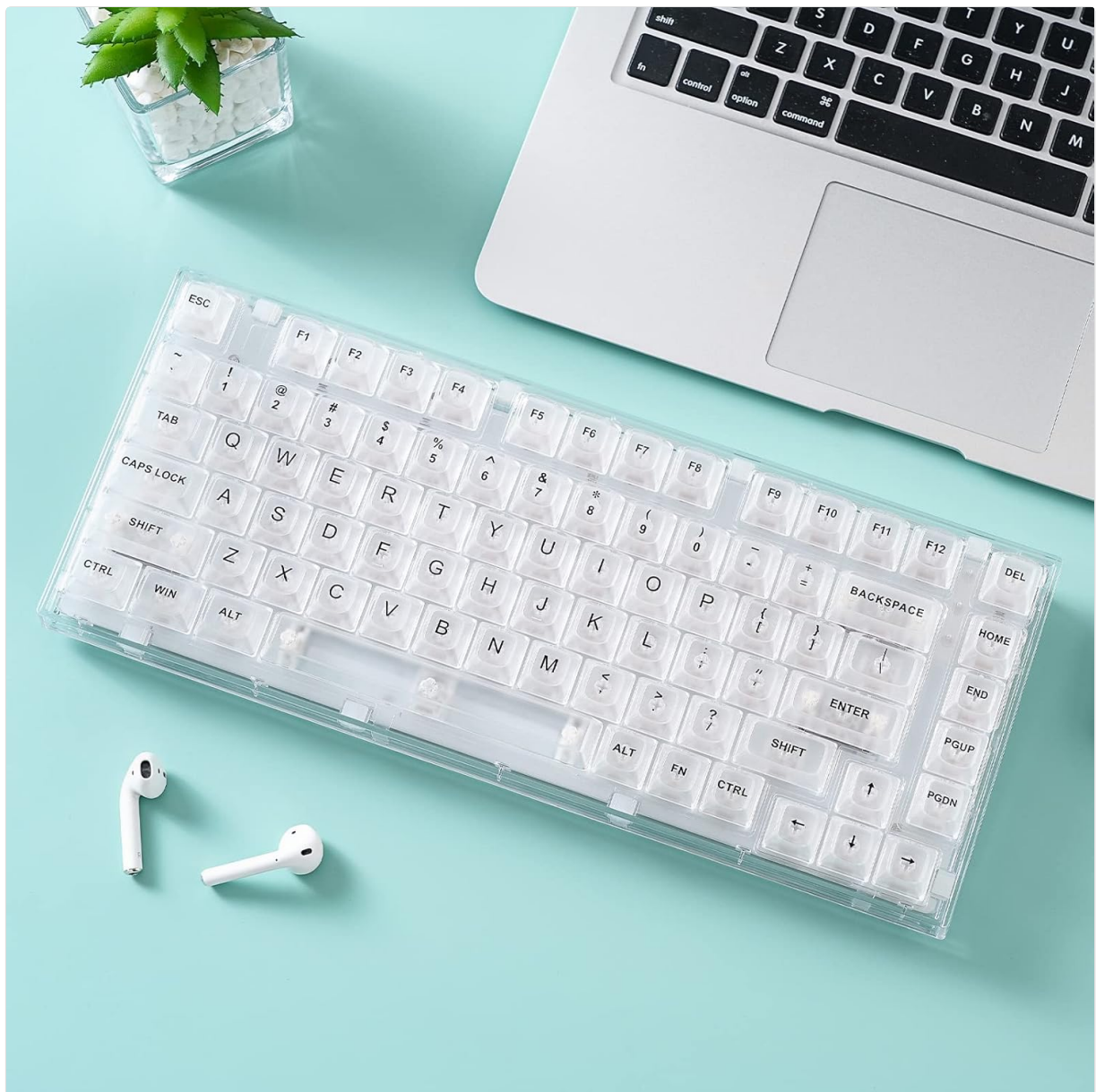
The YUNZII X75 keyboard and its included accessories.

Your browser does not support the video tag.