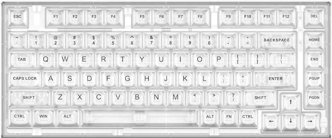
Image 1.1: YUNZII X75 PRO 82 Key Wireless Mechanical Gaming Keyboard.

This manual provides detailed instructions for the setup, operation, and maintenance of your YUNZII X75 PRO 82 Key Wireless Mechanical Gaming Keyboard. Please read this manual thoroughly to ensure proper use and to maximize your keyboard's functionality.