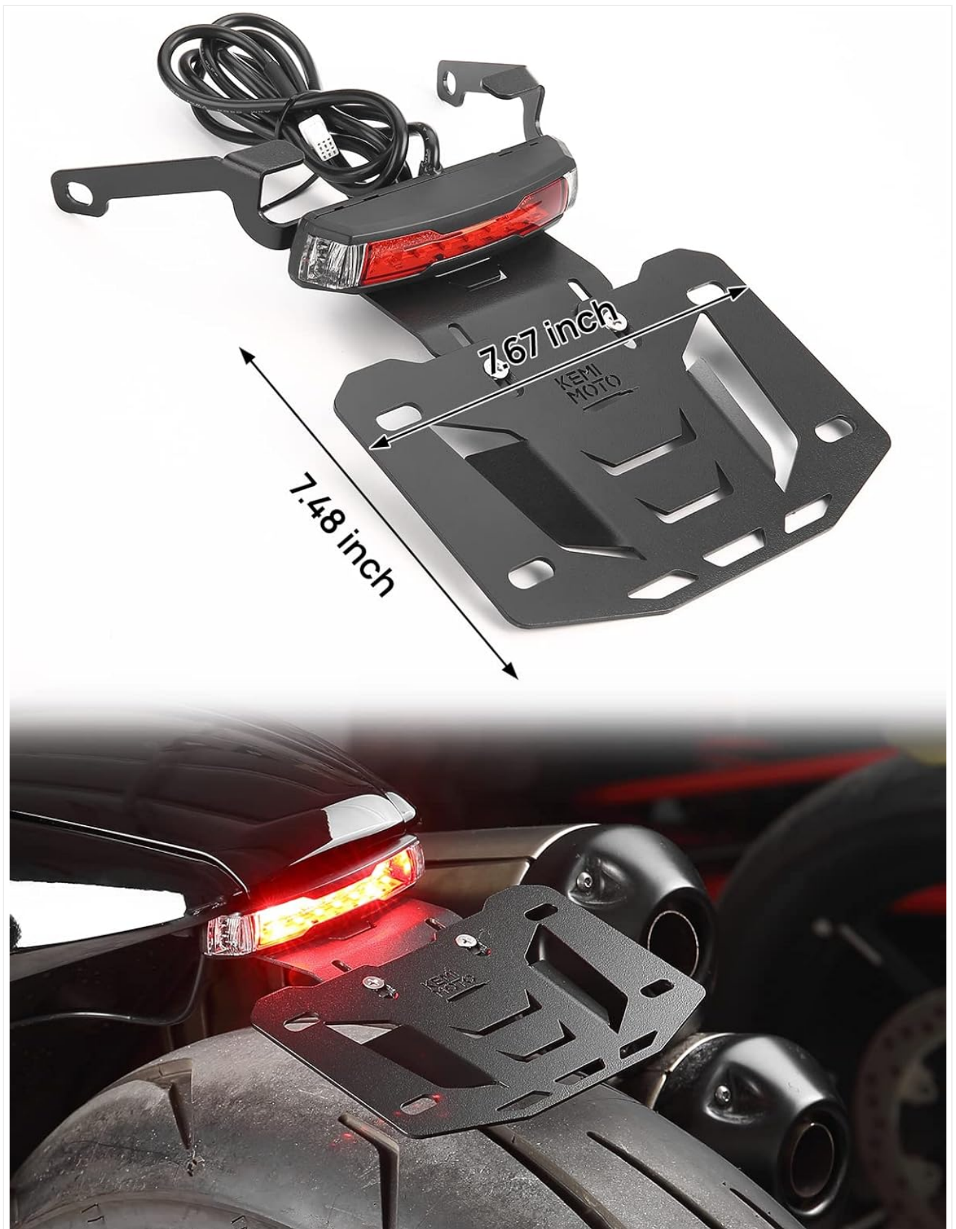
Image: Key dimensions of the KEMIMOTO license plate bracket.