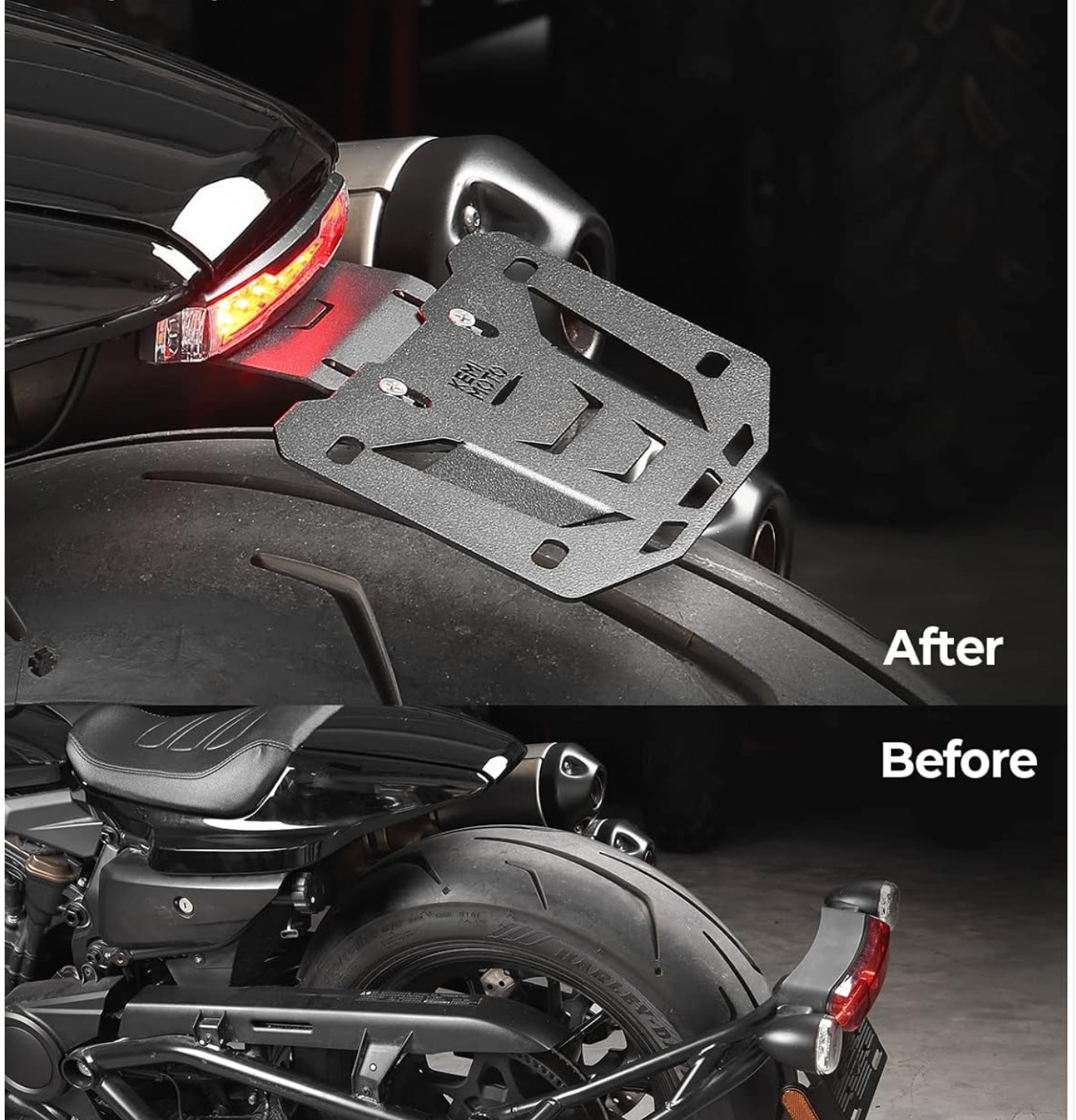
Image: Visual comparison of the motorcycle's rear fender before and after installation, demonstrating a cleaner appearance.

This license plate bracket with LED light meets the design concept of lightness, simplicity and modernity. Help you get rid of bulky motorcycle tail.