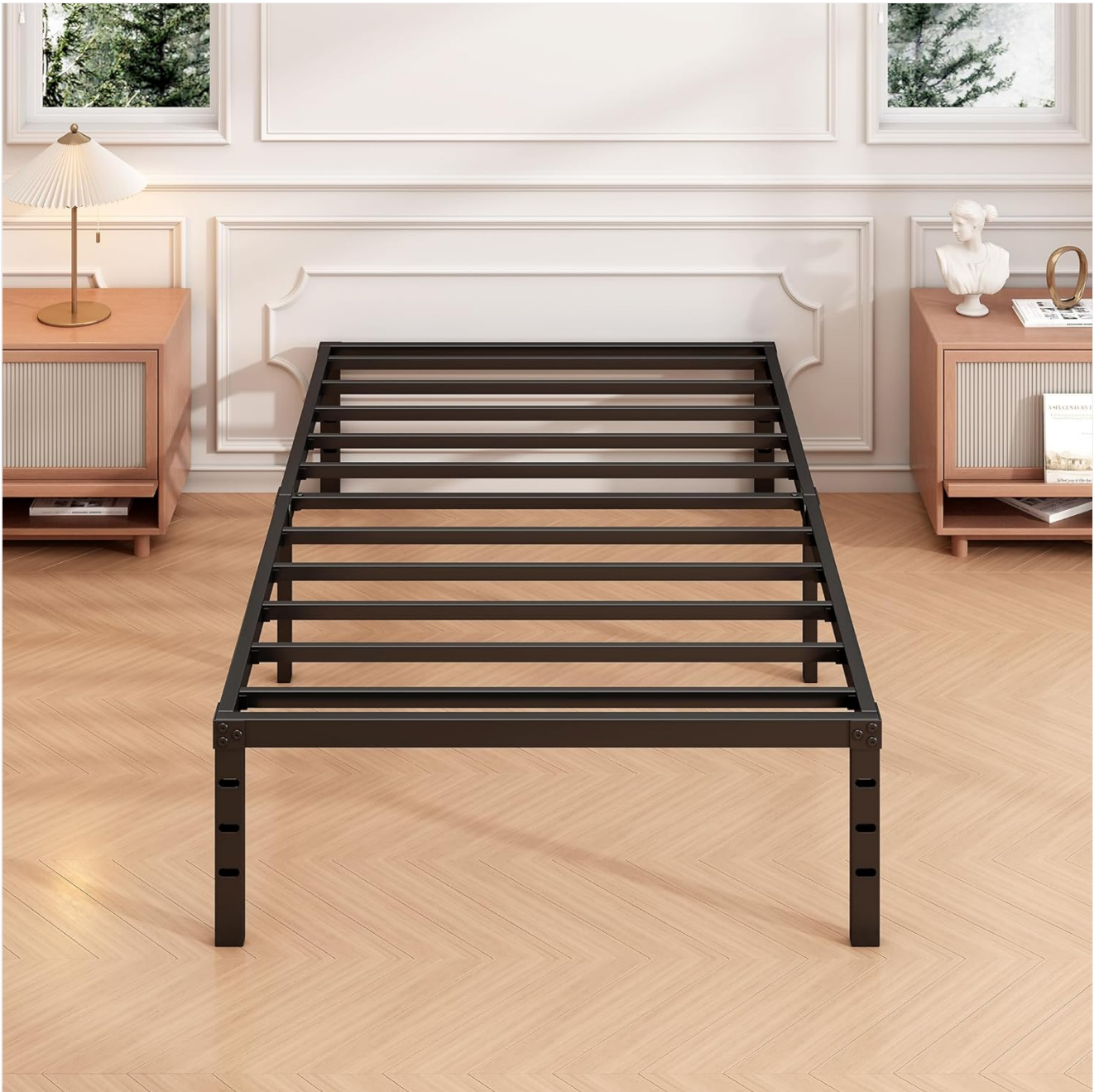
Image: An angled view of the assembled bed frame, highlighting the central support bar and multiple support legs for stability.