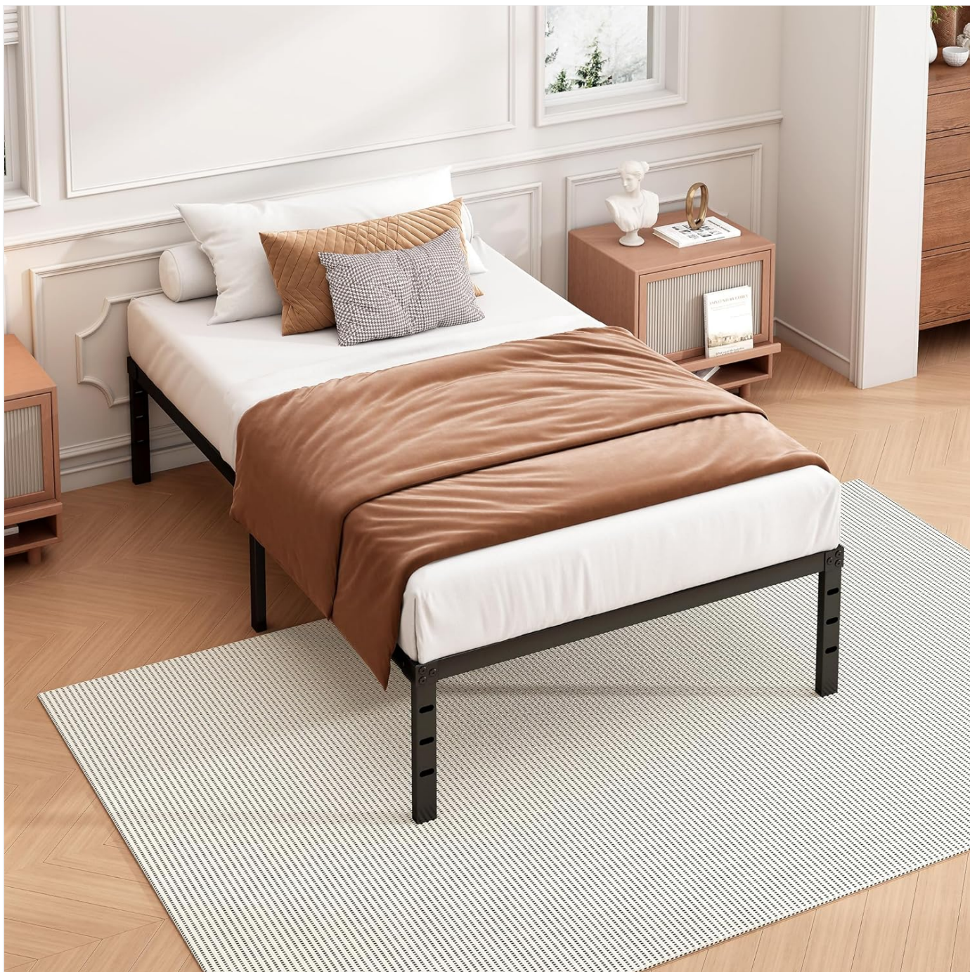
Image: The Hafenpo Twin Bed Frame fully assembled and placed in a bedroom, ready for a mattress.