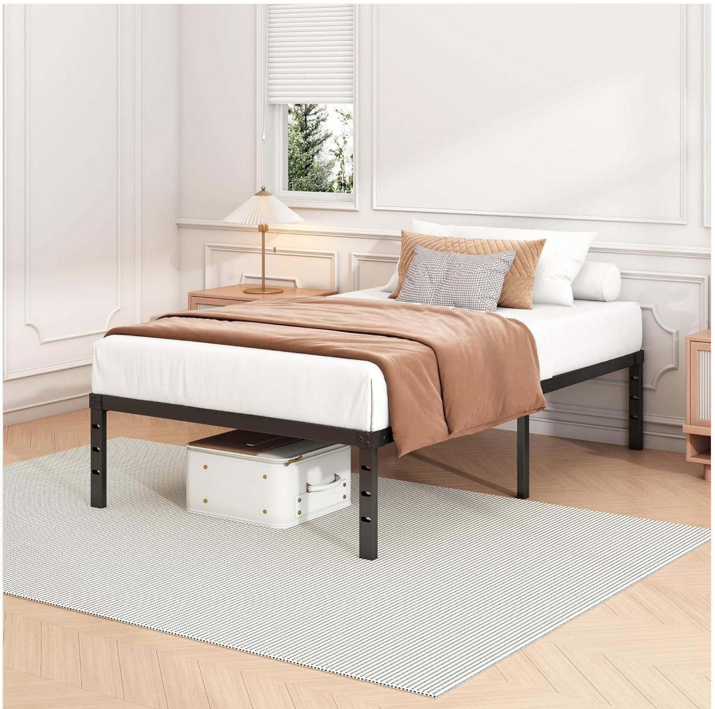
Image: The Hafenzo Twin Bed Frame with a storage box placed underneath, demonstrating the generous 18-inch under-bed clearance.