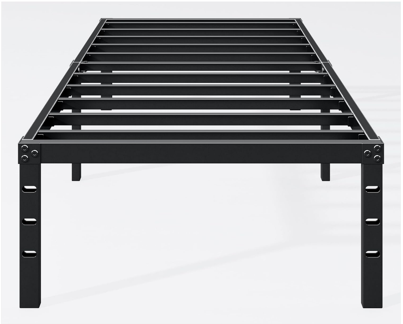
Image: Top-down view of the assembled bed frame, showing the evenly spaced metal slats that provide mattress support.