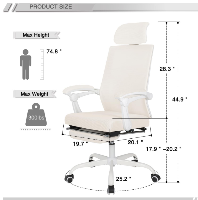
Figure 2: Chair dimensions and maximum height/weight capacity. Max height 74.8", Max weight 300lbs. Seat height adjustable from 17.9" to 20.2".