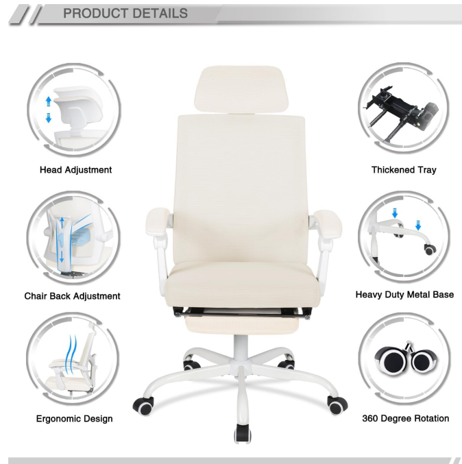
Figure 7: Detail of the chair's heavy-duty metal base, high-quality gas lift, and smooth 360-degree rotating casters.