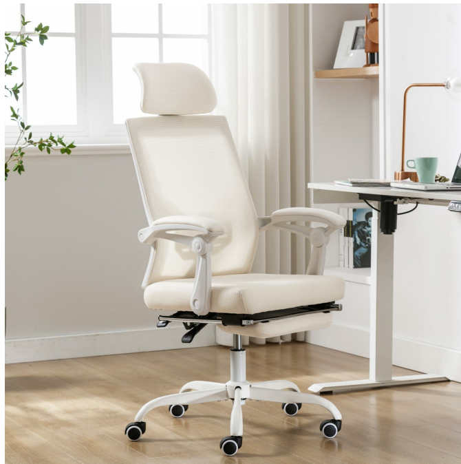
Figure 1: The Qulomvs Mesh Ergonomic Office Chair with Footrest, showcasing its design and features.

Thank you for choosing the Qulomvs Mesh Ergonomic Office Chair with Footrest. This manual provides comprehensive instructions for the assembly, operation, and maintenance of your new office chair. Please read this manual carefully before assembly and use to ensure proper function and safety. Keep this manual for future reference.