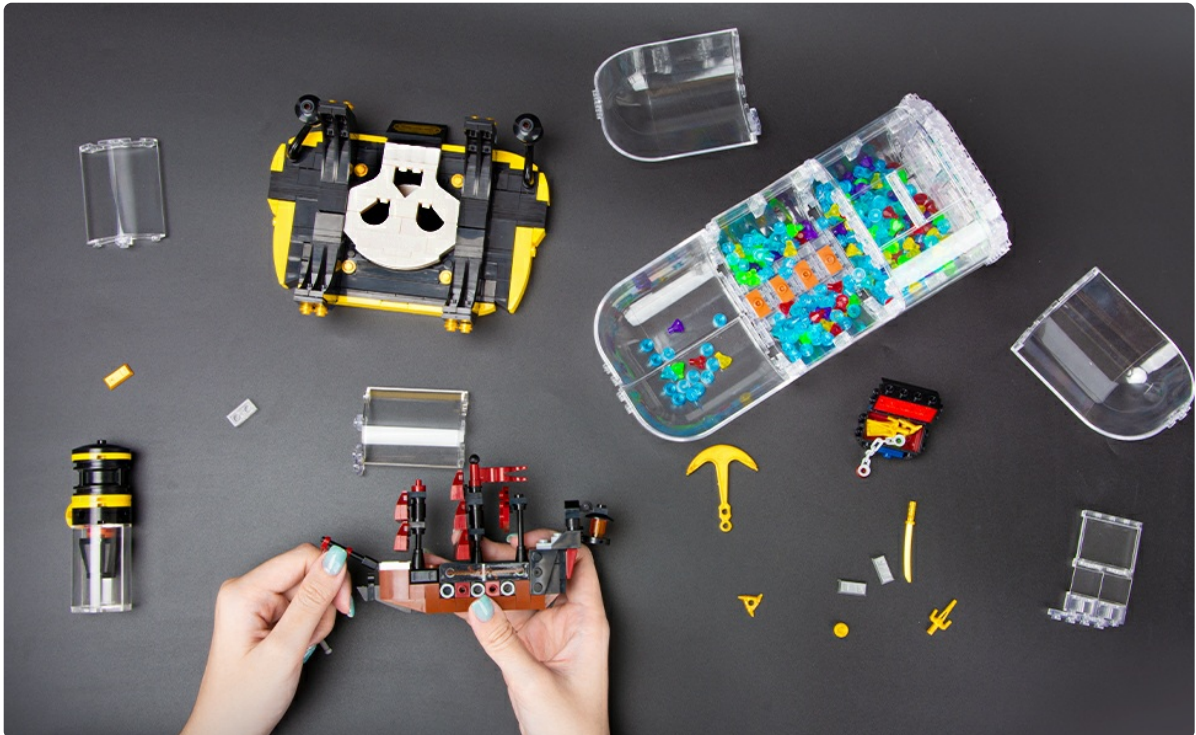
Figure 4: Illustrates the process of assembling the transparent bottle around the ship and adding the 'water' elements.