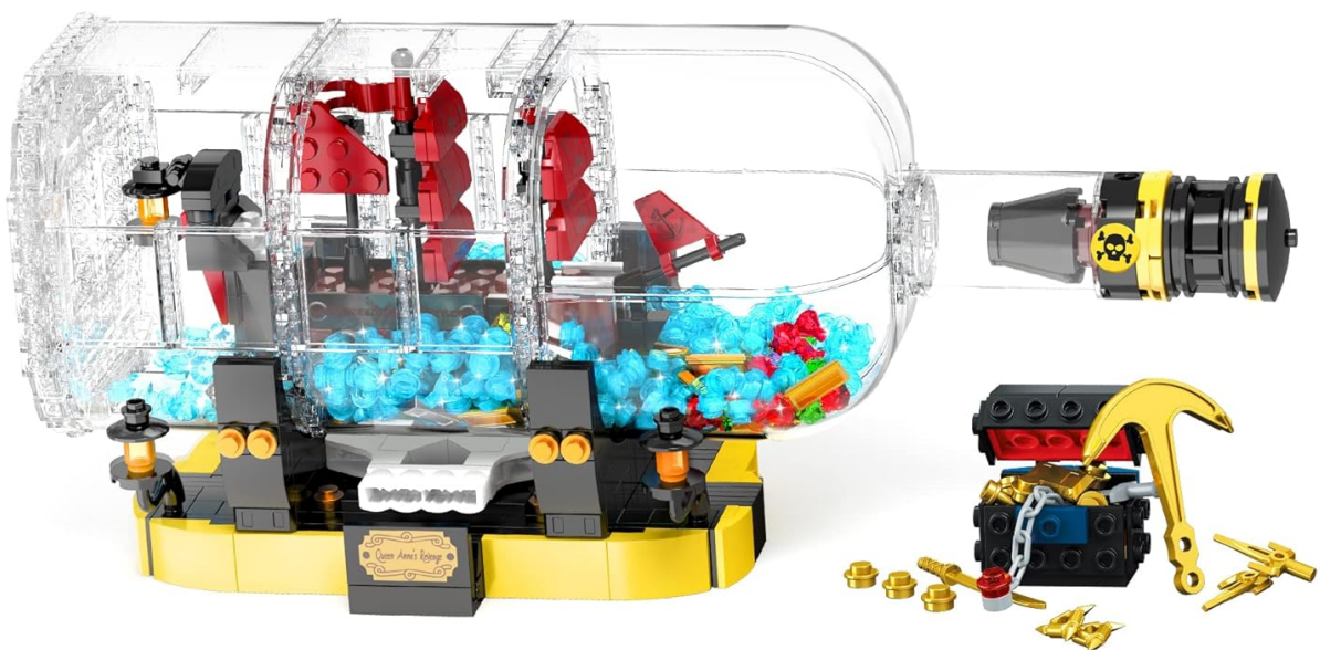
Figure 1: The EDUCIRO Impossible Pirate Bottle Building Blocks set, including the product box and the fully assembled model with its display stand.