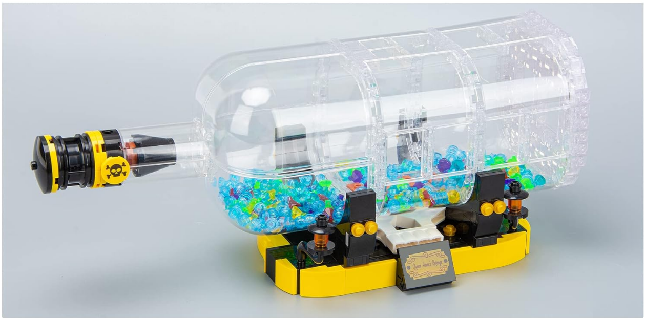
Figure 2: Overview of key components, including the pirate ship, treasure chest, and the base structure for the bottle.