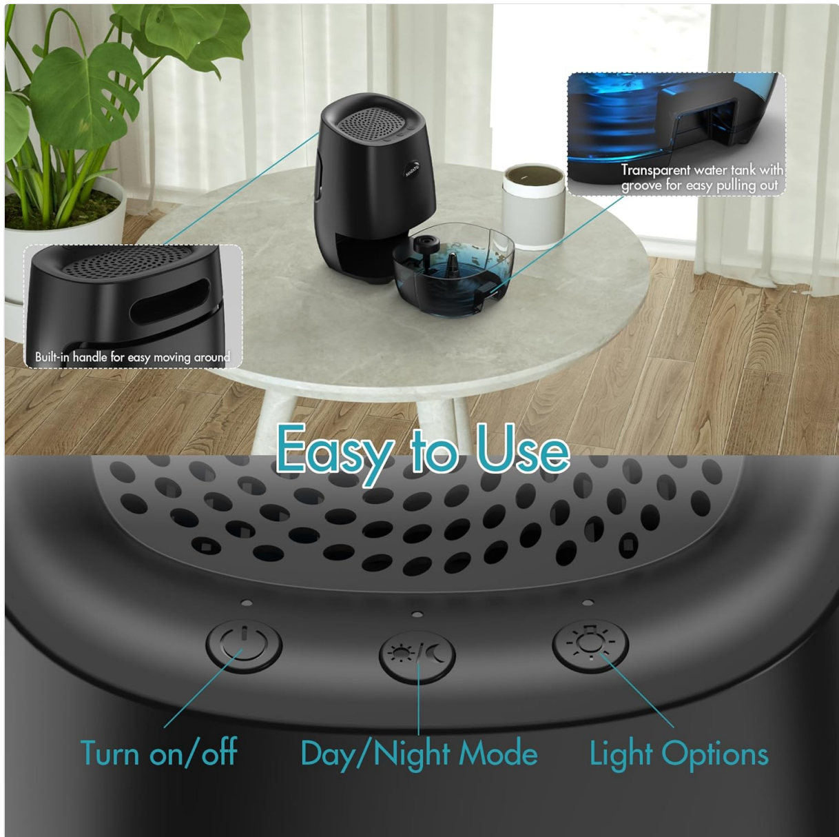
Figure 6: Easy removal of the water tank for emptying.