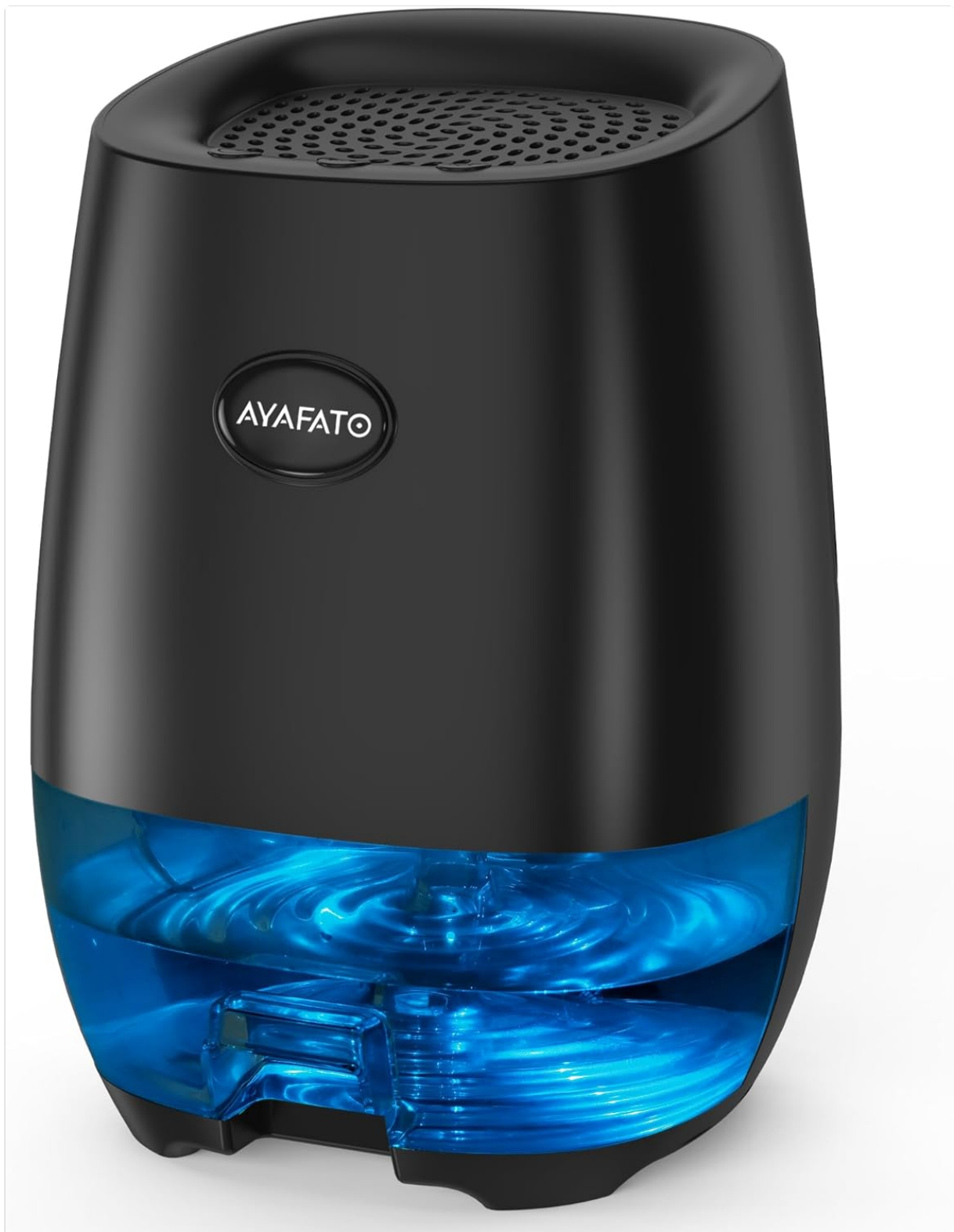
Figure 1: Front view of the AYAFATO 35OZ Mini Dehumidifier.