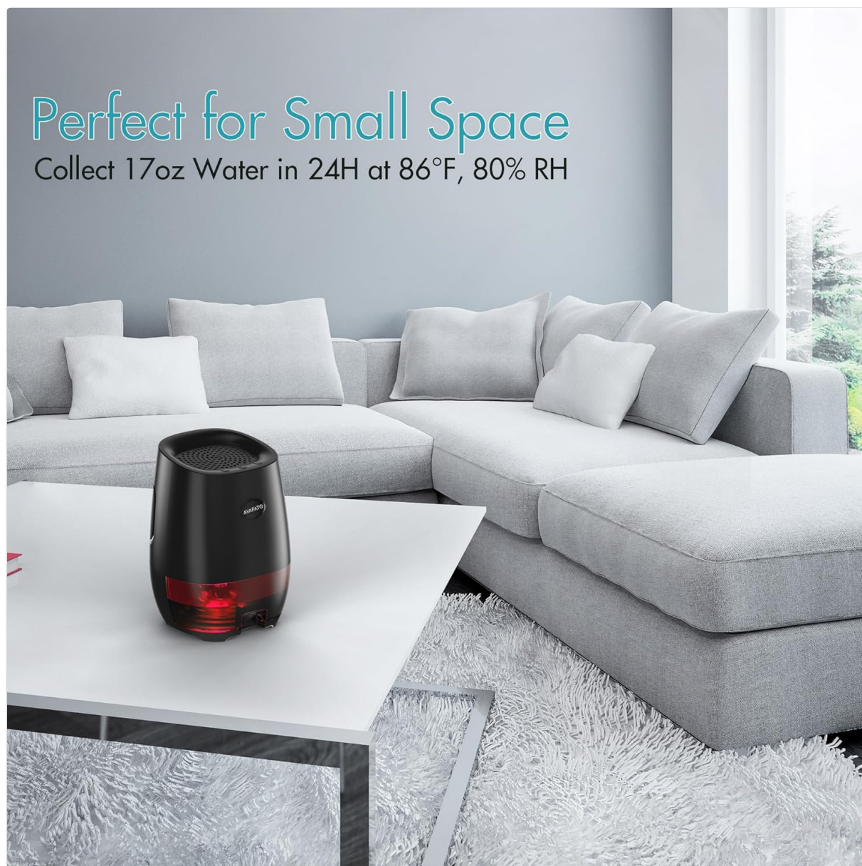
Figure 2: The dehumidifier positioned in a living room, highlighting its compact design.

the other end into a suitable electrical outlet.