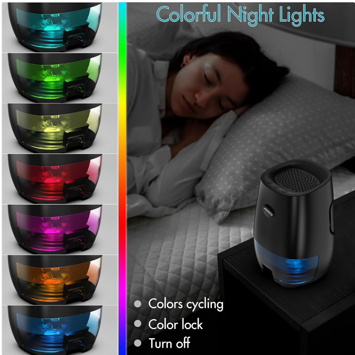
Figure 4: Demonstrating the 7-color night light feature.