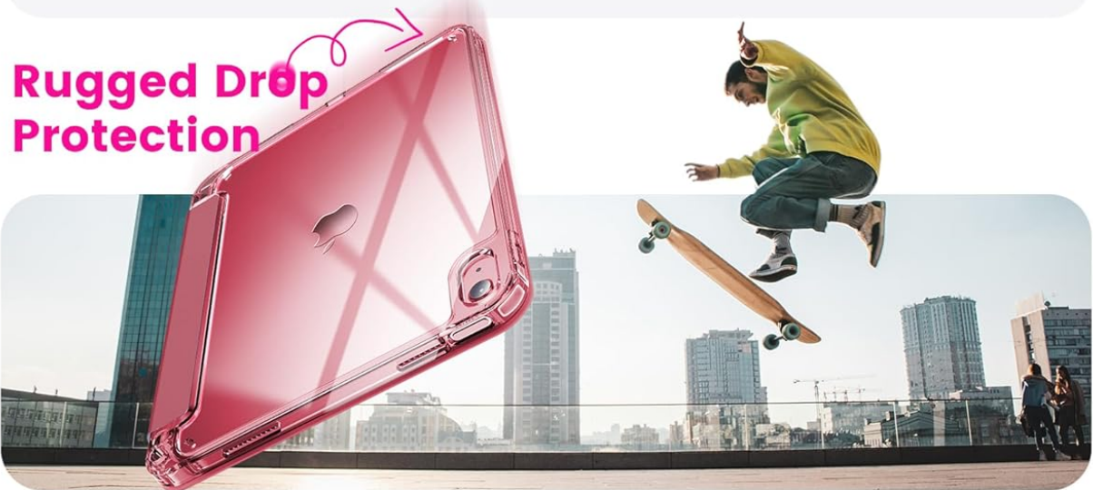
Figure 2: Illustration of the case's advanced transparent material and rugged drop protection.

Upgrade High clarity transparent material Industry Unique Anti-yellowing Tech 99% light transmittance , Restore the beauty of original device.