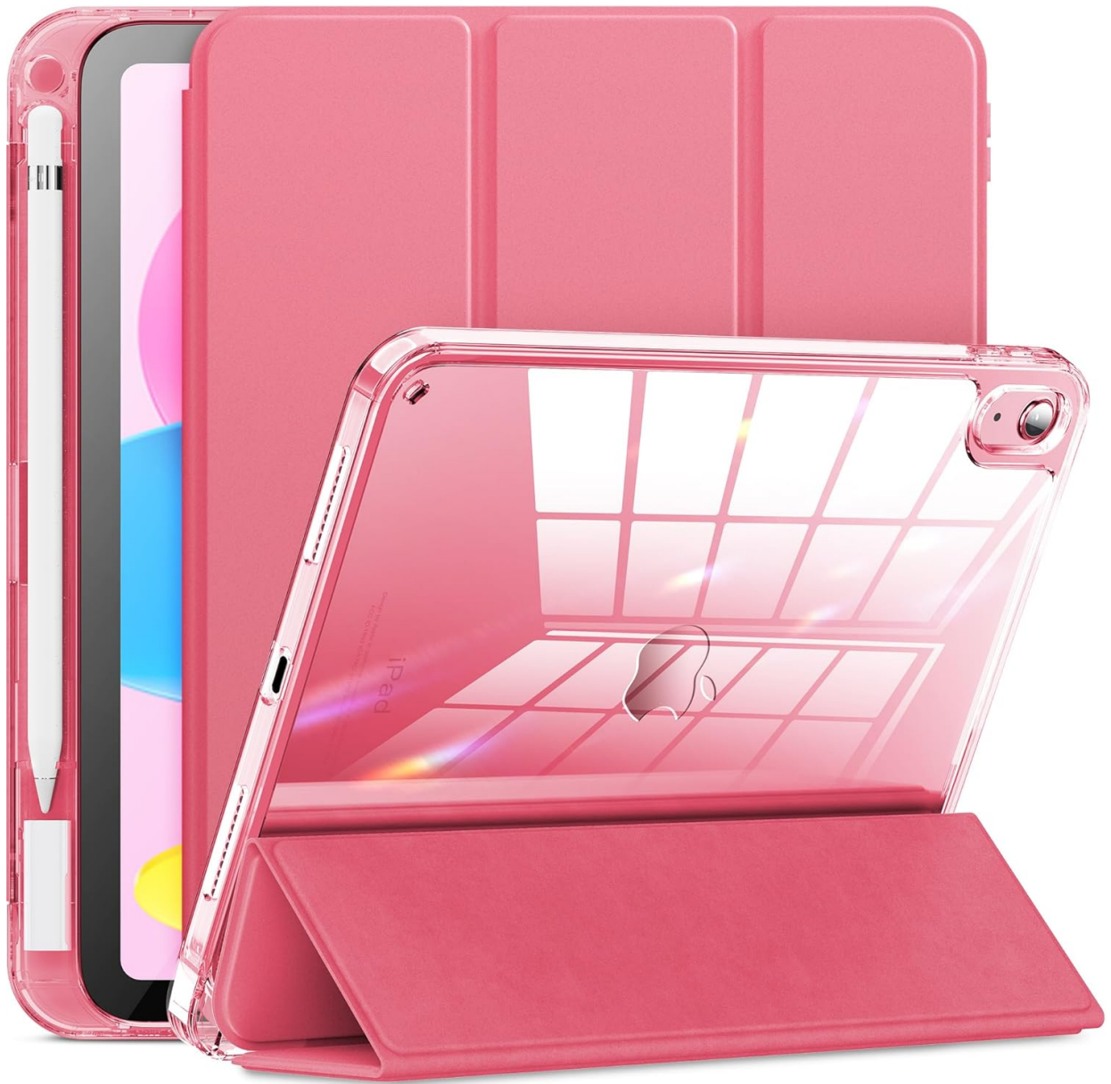
Figure 1: INFILAND iPad Case (Watermelon Red) with clear back and front cover.