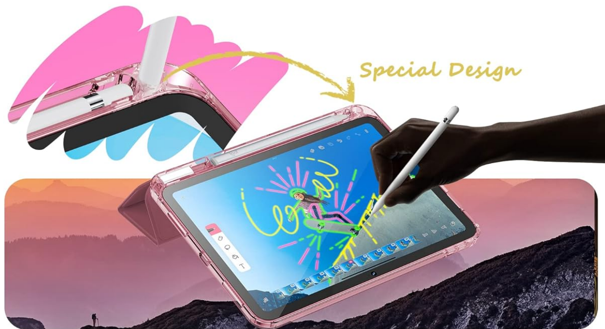
Figure 4: Detailed view of the Apple Pencil and USB-C adapter storage slots.

Your browser does not support the video tag.