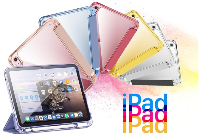
Figure 5: The case configured for a convenient viewing mode.

Confirm iPad model on the back of device: ONLY FOR iPad 10th Gen 10.9" (A2696 / A2757 / A2777)