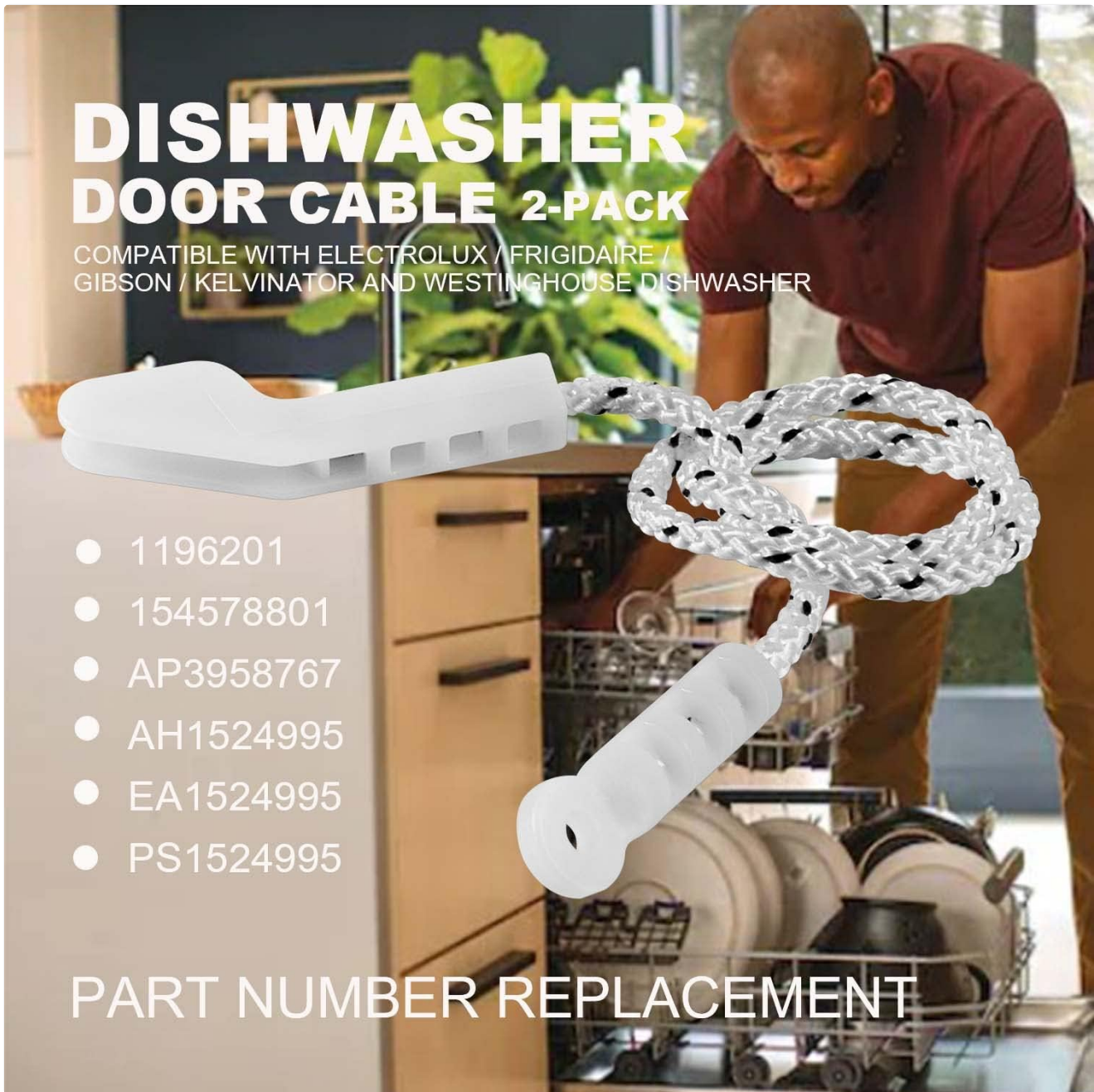
Image 5.1: Proper connection of the dishwasher door cable to the spring.

For visual assistance, many instructional videos are available online (e.g., on YouTube) that demonstrate the replacement process for various dishwasher models. Searching for your specific dishwasher model along with "door cable replacement" can provide helpful guidance.