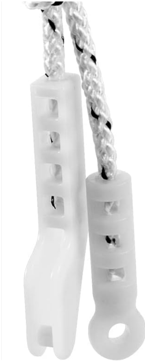
Image 2.1: Product dimensions of the AP3958767 Dishwasher Door Cable.