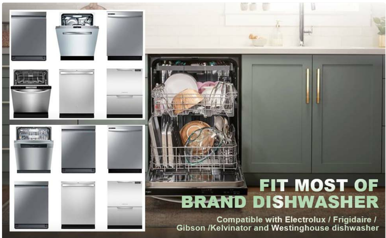
Image 3.1: The Ussuray door cable is designed to fit most major dishwasher brands.