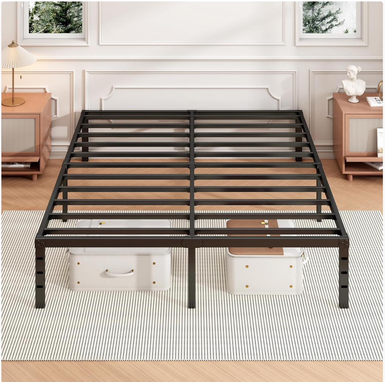
Figure 4: Under-bed storage space with example containers.