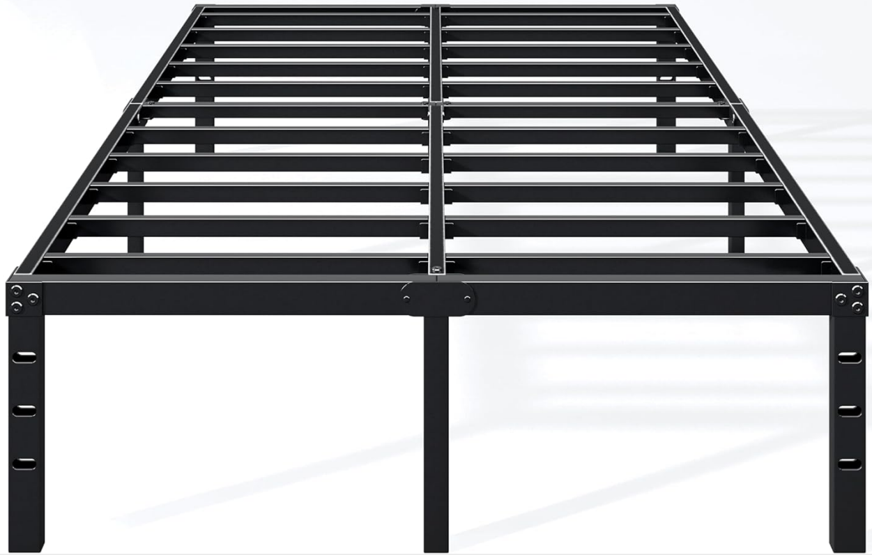
Figure 1: Fully assembled Hafenpo Queen Metal Platform Bed Frame.