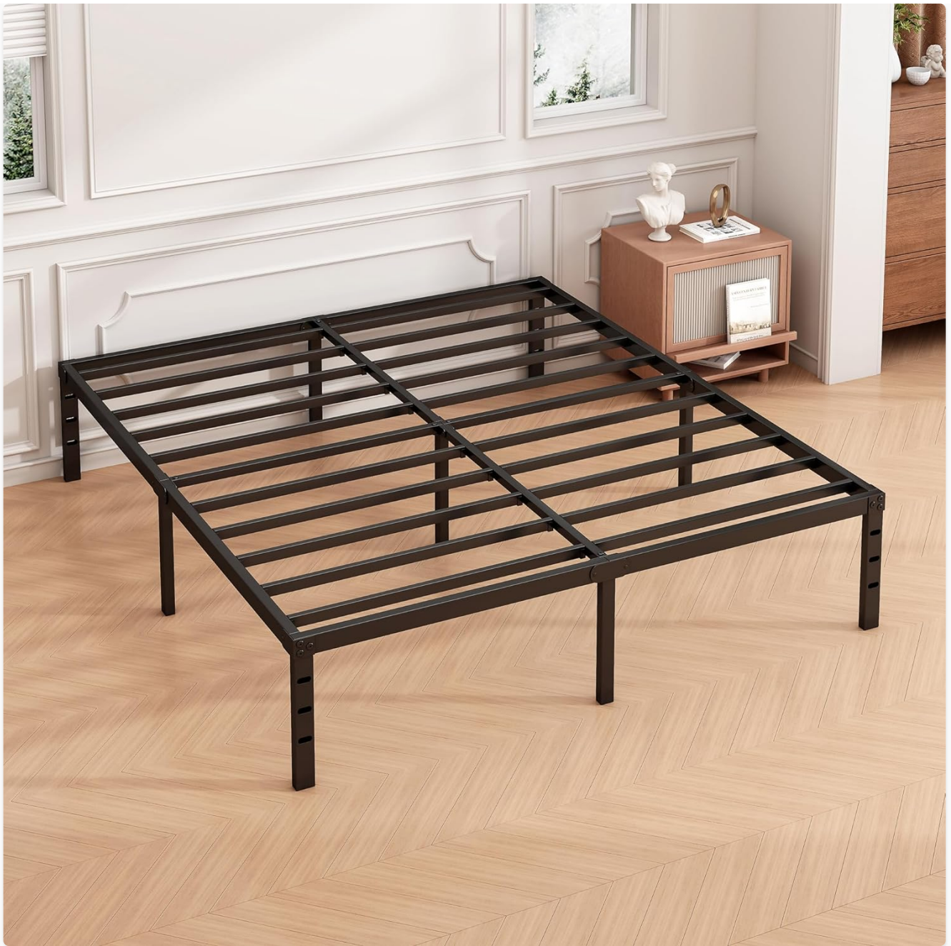
Figure 3: Partially assembled bed frame illustrating the metal slat design.