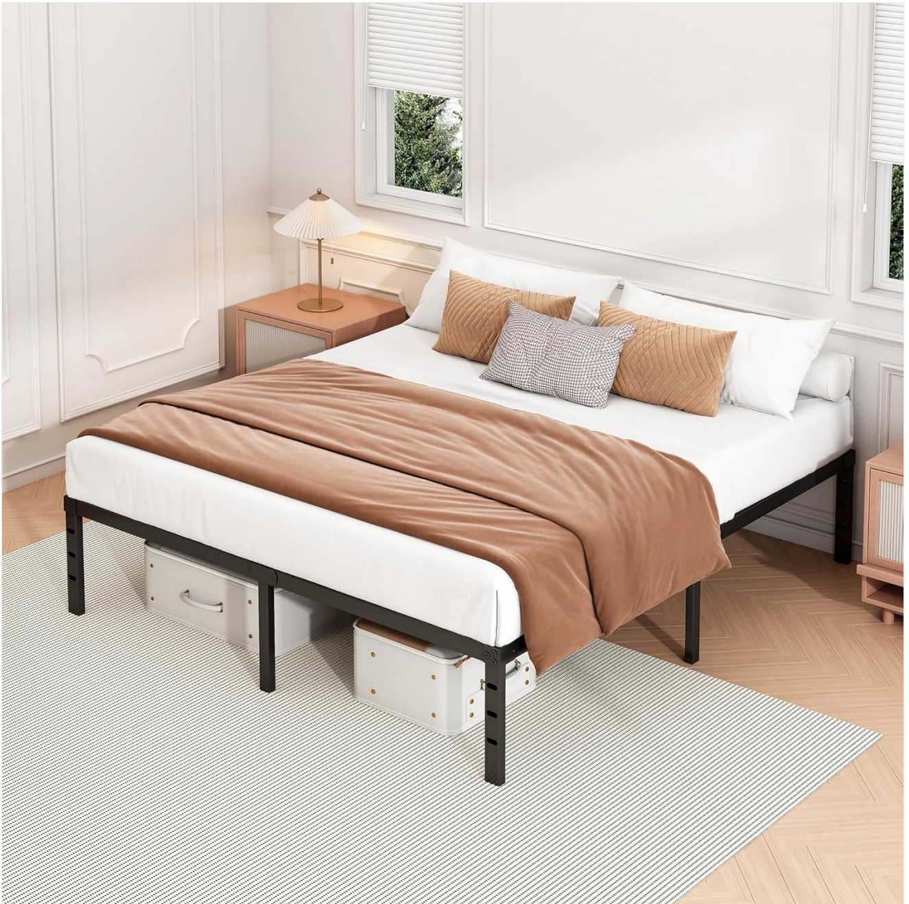
Image: Hafenpo King Bed Frame with mattress and under-bed storage boxes, illustrating under-bed storage capability.