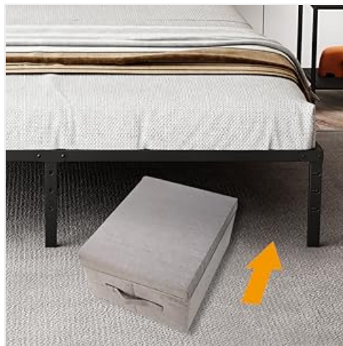
Image: Example of under-bed storage space with a storage box.