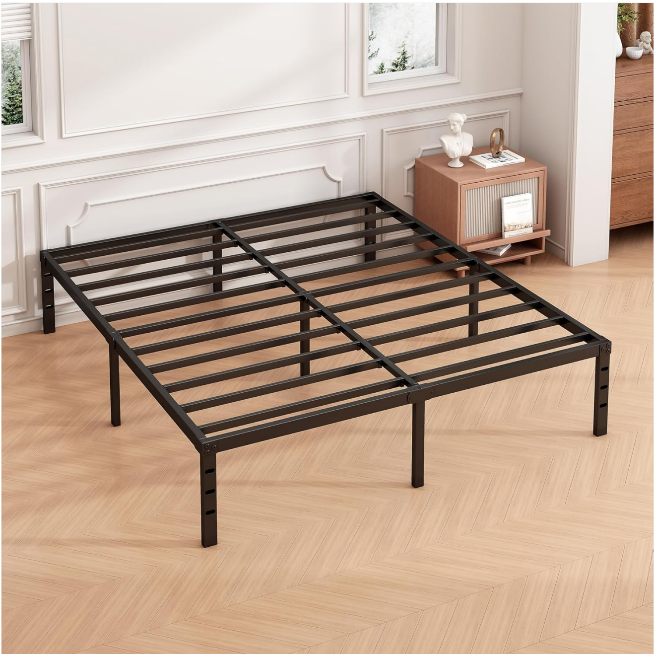
Image: Angled view of the bed frame structure, showing slat and leg connections.