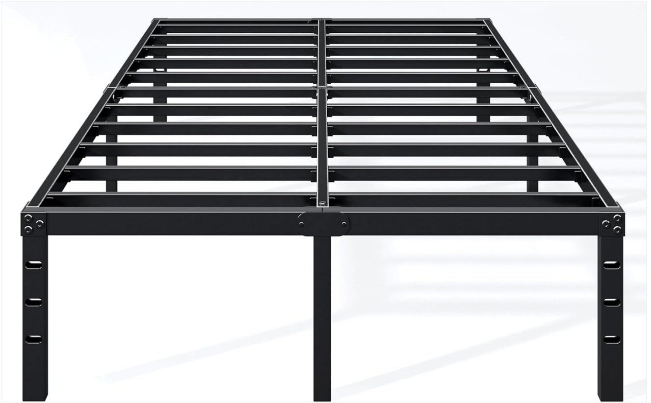
Image: Fully assembled Hafenpo 14 Inch King Metal Platform Bed Frame.