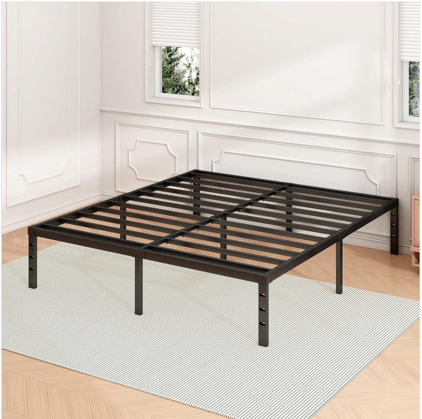
Image: The Hafenpo Full Bed Frame, fully assembled and ready for use with a mattress, showcasing its minimalist design in a bedroom environment.