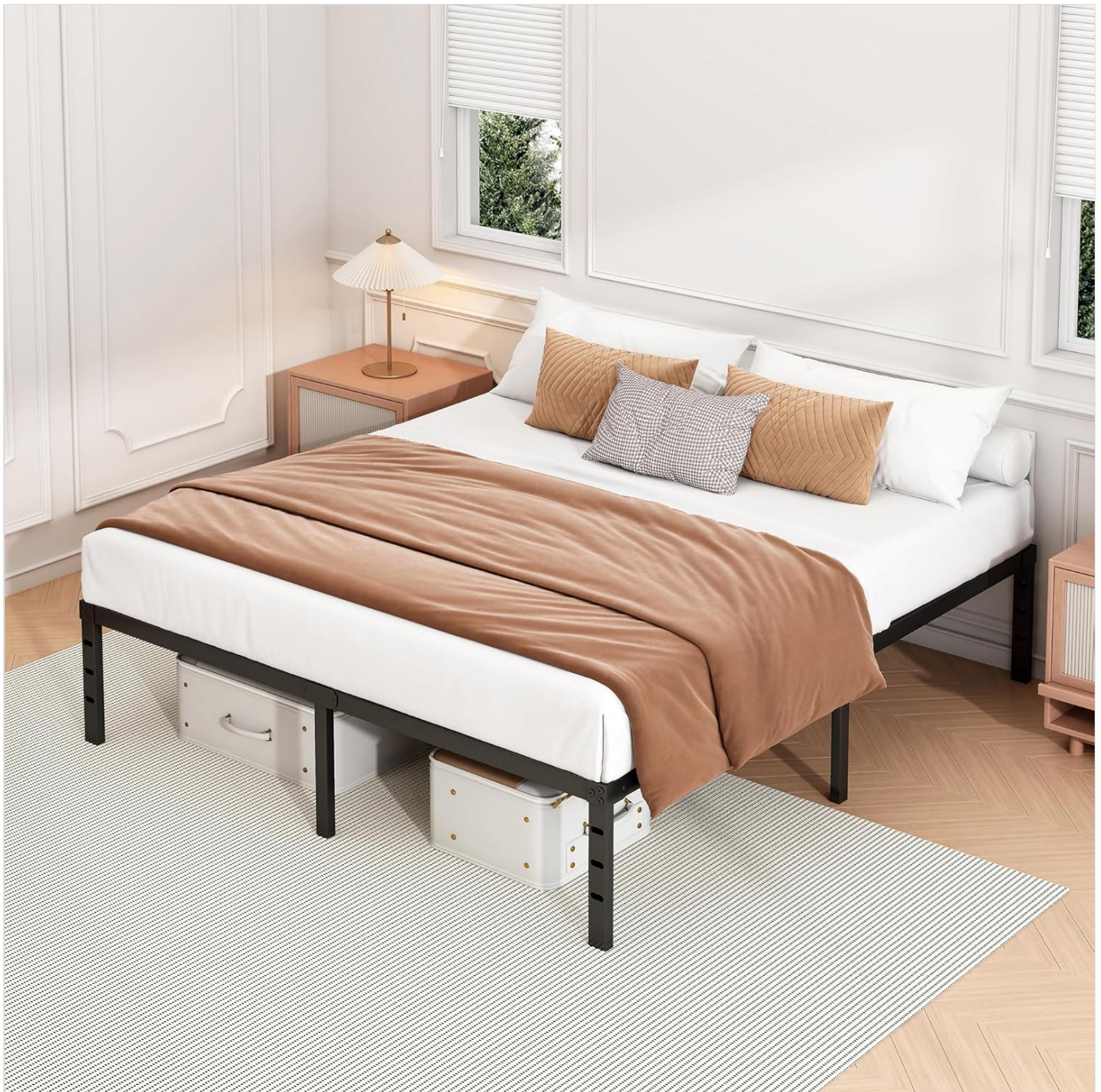
Image: The Hafenpo Full Bed Frame in a bedroom, demonstrating the generous under-bed storage capacity with storage bins placed beneath.