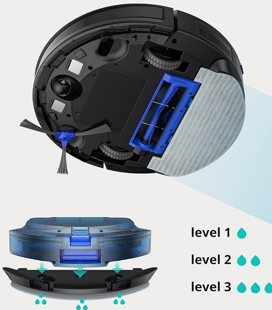
Image: The underside of the eufy G40Hybrid+ robot vacuum, highlighting its main brush, side brushes, and attached mop pad.