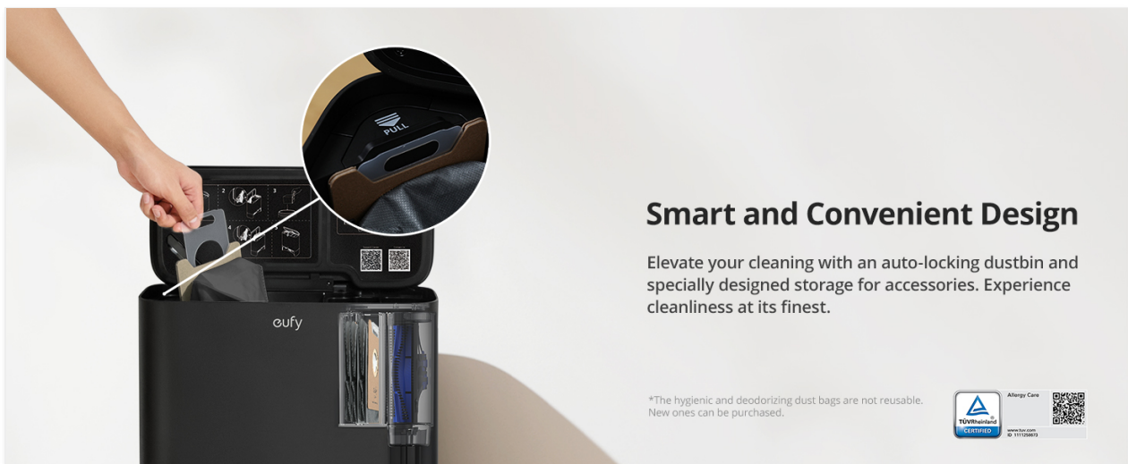
Image: A person's hand pulling out a full dust bag from the self-empty station, with a new bag ready for insertion.