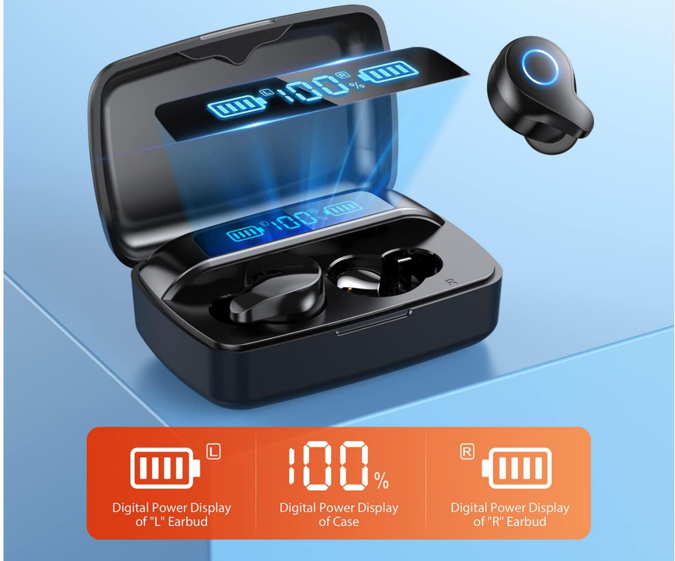
Figure 4.1: LED Digital Display showing individual earbud and case battery levels.