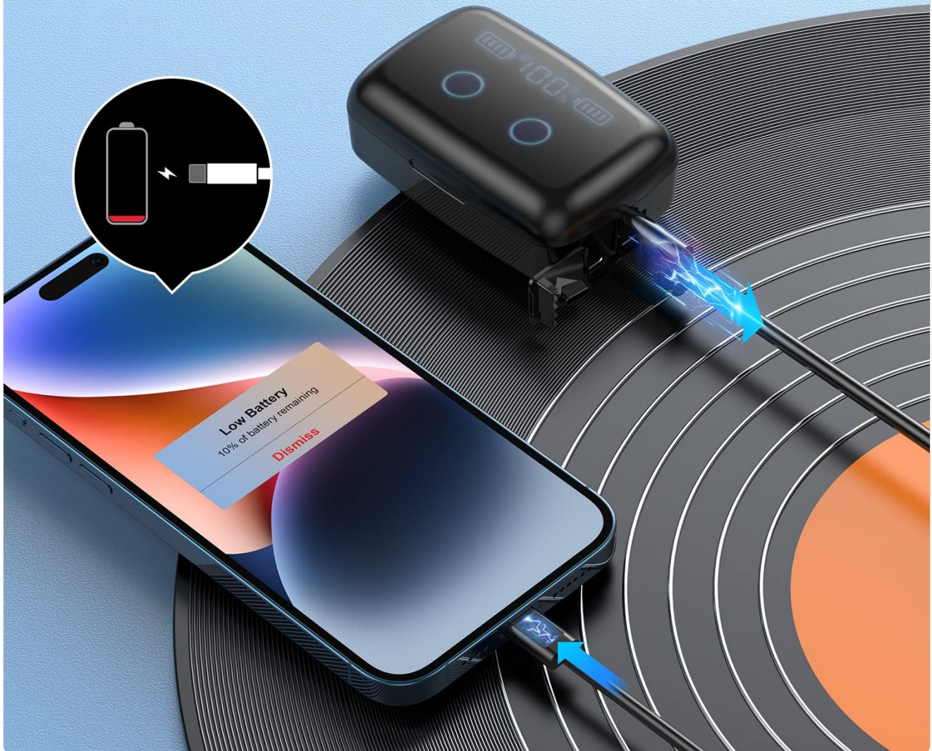
Figure 6.2: Emergency rechargeable battery function for cell phones.

⚠️ Away from the anxiety of sudden phone shutdown