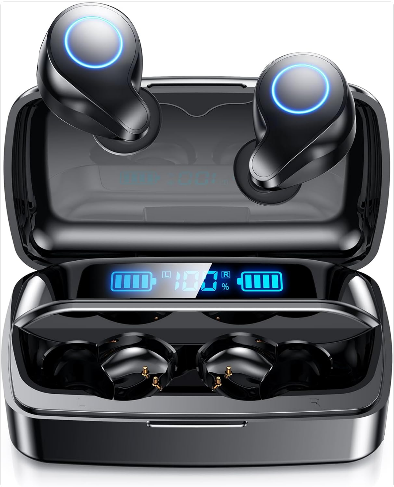
Figure 3.1: NIPELL A66 Wireless Earbuds and Charging Case.