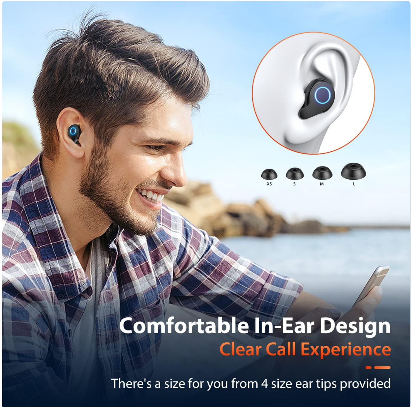
Figure 8.1: Comfortable in-ear design with various ear tip sizes for optimal fit.

The earbuds are designed for a comfortable in-ear fit, dispersing pressure in the ear canal while remaining stable. Four sizes of ear tips (XS, S, M, L) are provided to ensure the best fit for your ears.