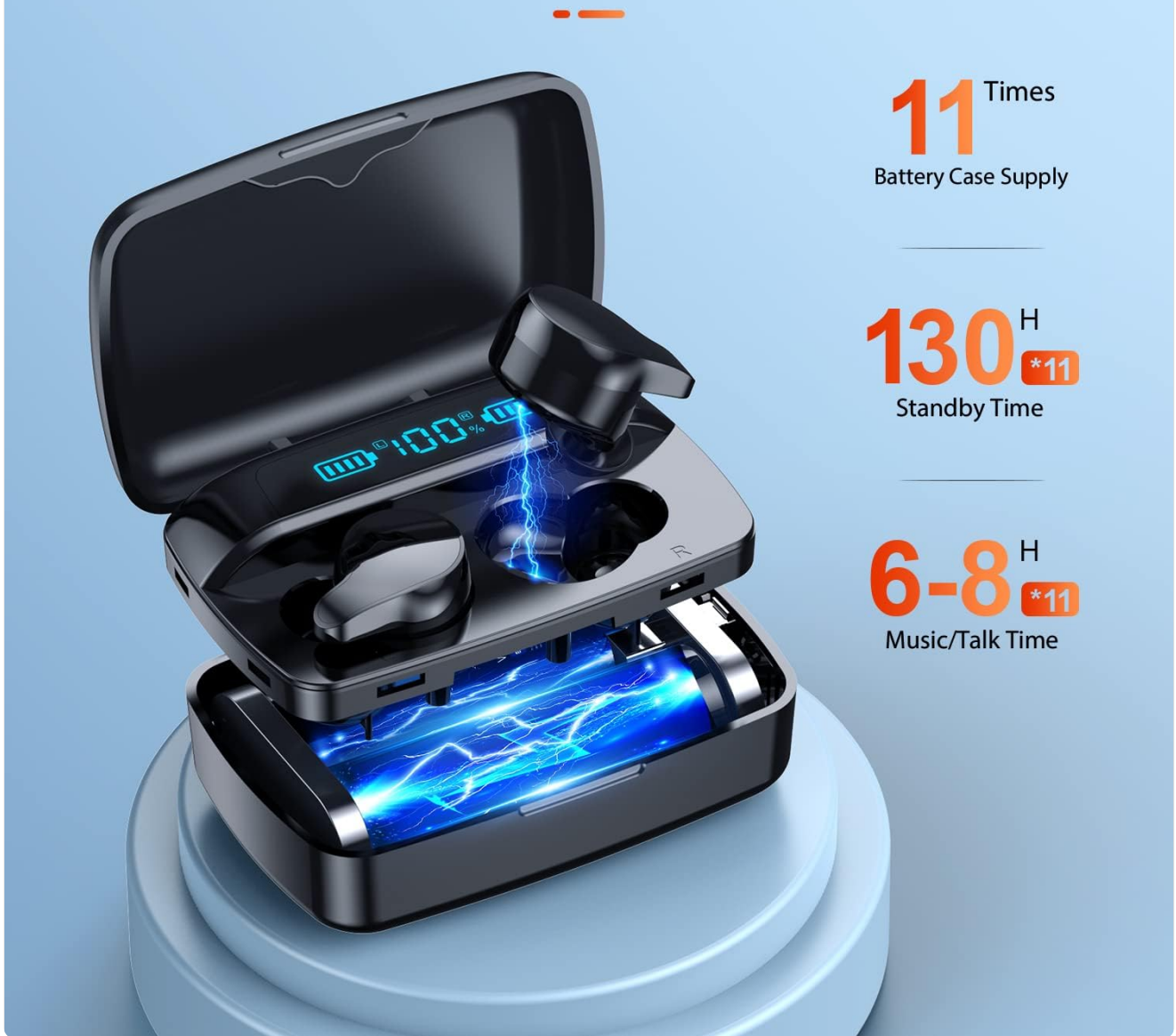
Figure 6.1: 1800mAh strong battery case providing extended playtime.