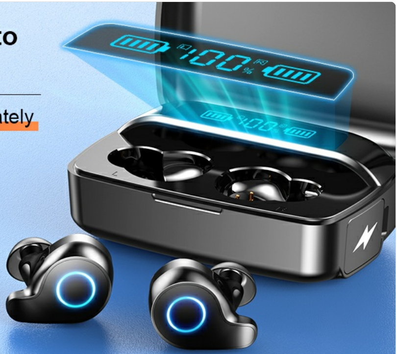
Figure 4.2: Auto-reconnect feature upon opening the charging case lid.