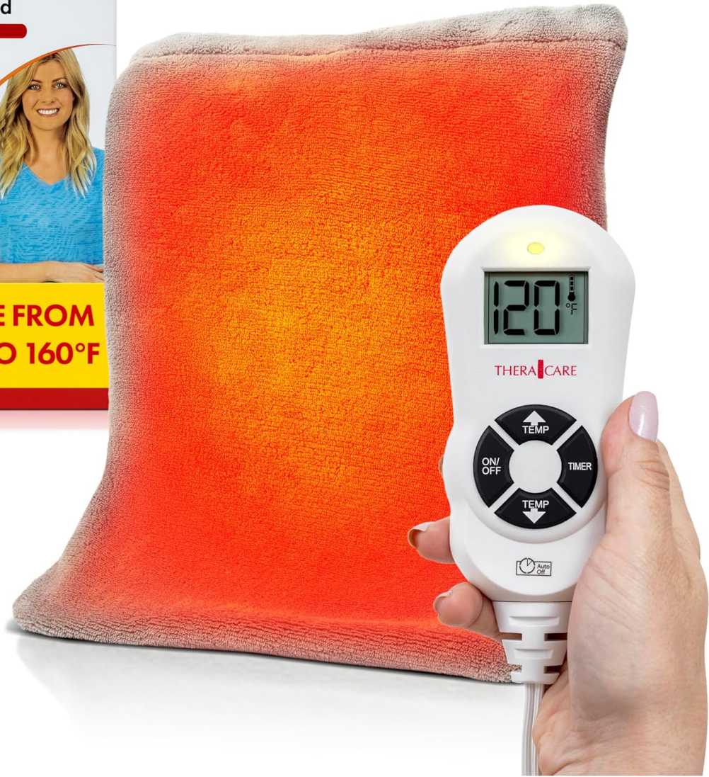
Image: TheraCare Digital Heating Pad with its digital controller displaying a temperature of 120°F.