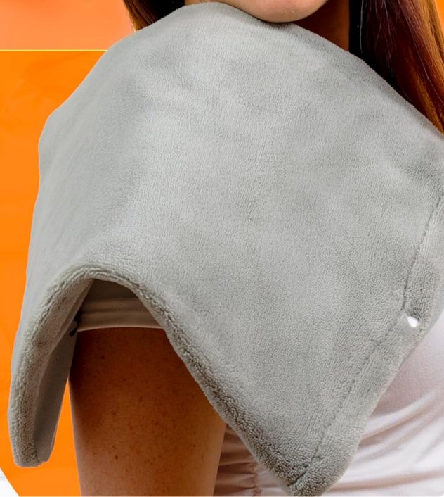
Image: A woman applying the TheraCare heating pad to her shoulder, highlighting its key features.