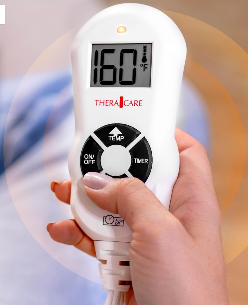
Image: Close-up of the digital controller, illustrating temperature and timer adjustment buttons.