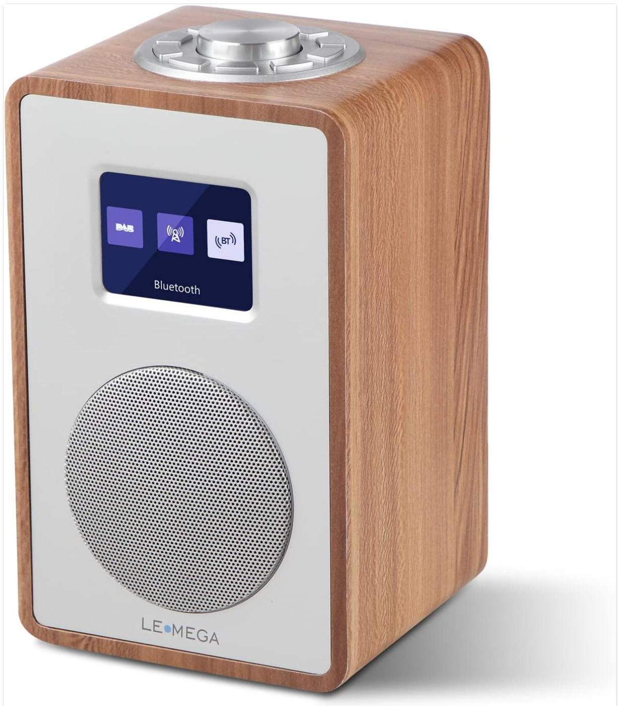
Figure 1: LEMEGA CR4 Digital Radio, front view, showcasing the display, speaker, and walnut wood casing.