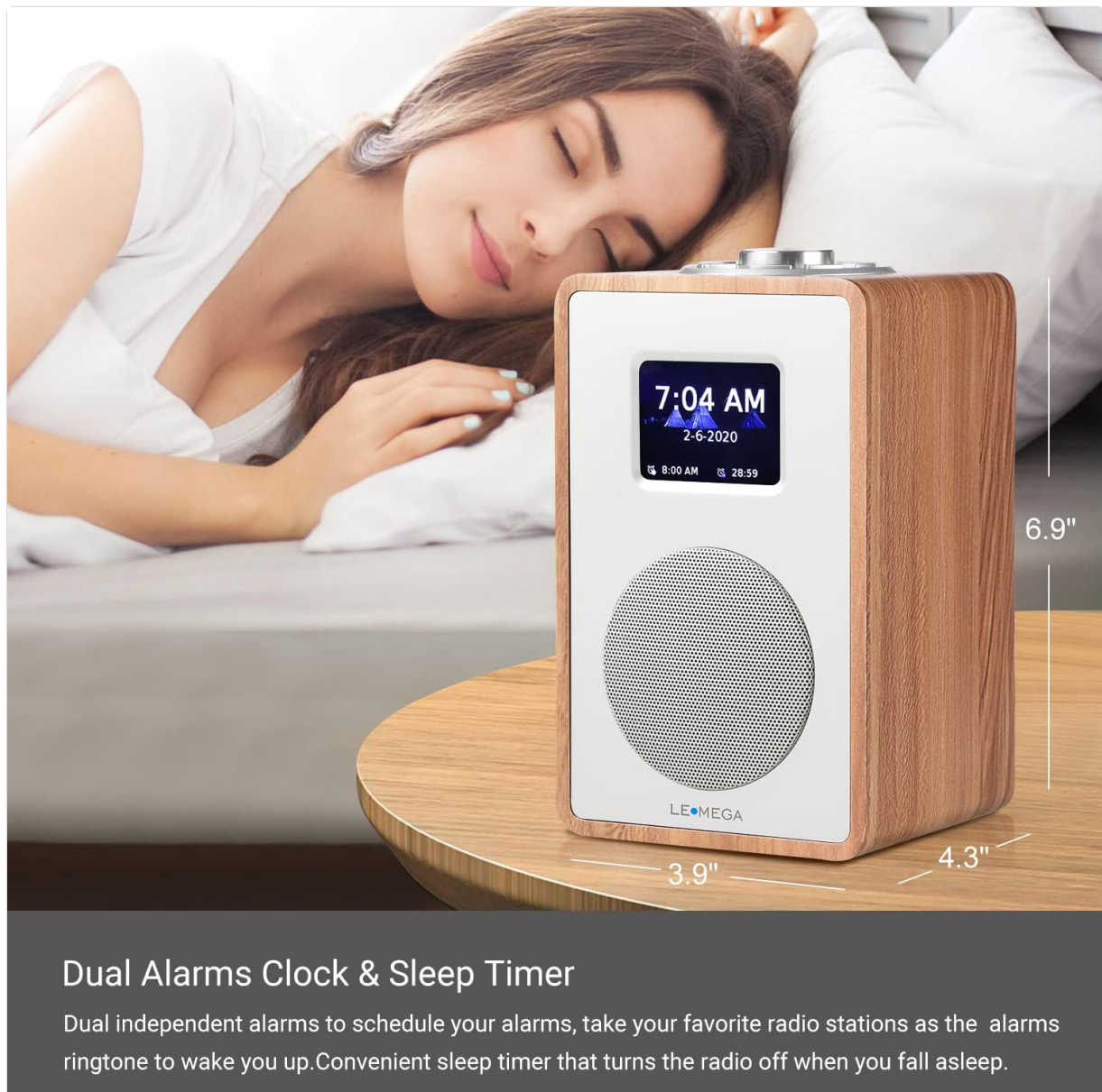
Figure 5: The LEMEGA CR4 displaying the alarm time, illustrating its function as a bedside clock radio.