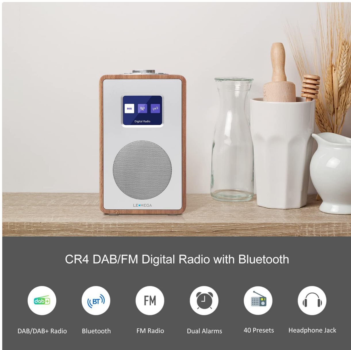
Figure 2: Key features of the LEMEGA CR4, including DAB/DAB+ radio, Bluetooth, FM radio, dual alarms, 40 presets, and a headphone jack.