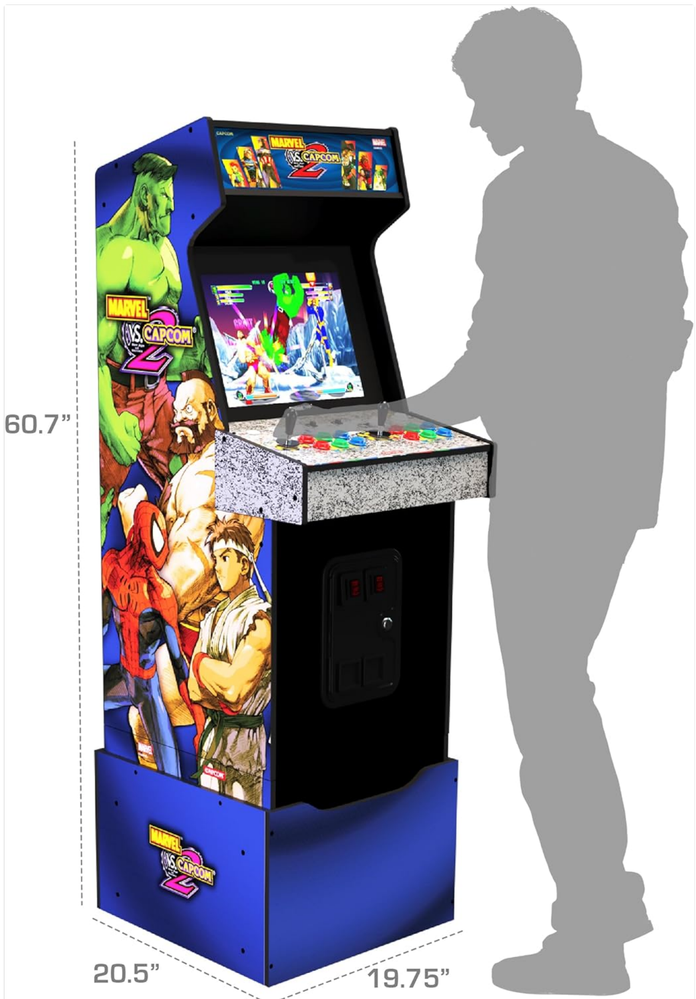
Figure 2: Visual representation of the Arcade1UP Marvel VS Capcom II Arcade Machine dimensions, including a person