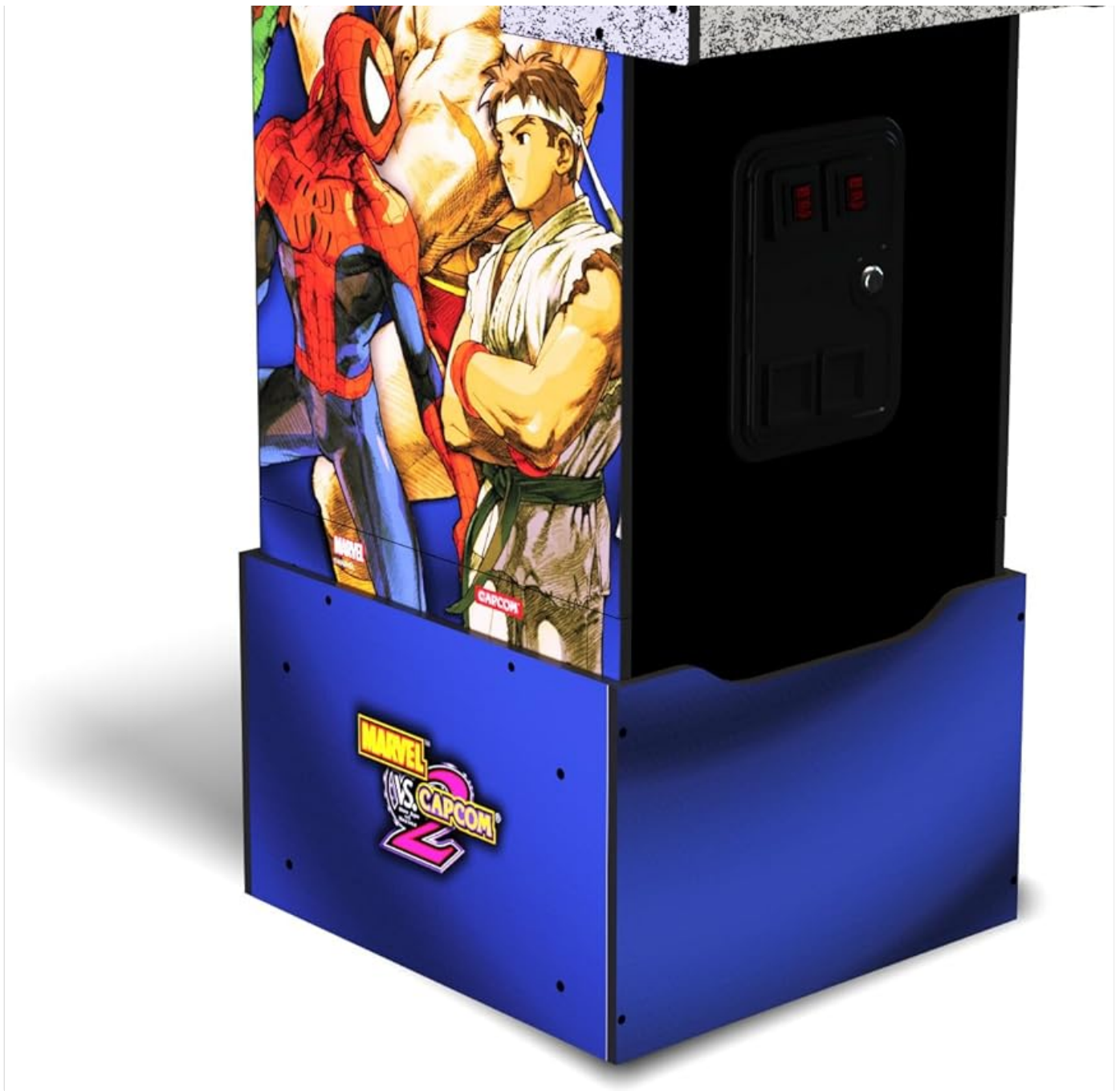
Figure 1: The Arcade1UP Marvel VS Capcom II Arcade Machine, a full-size home arcade cabinet.