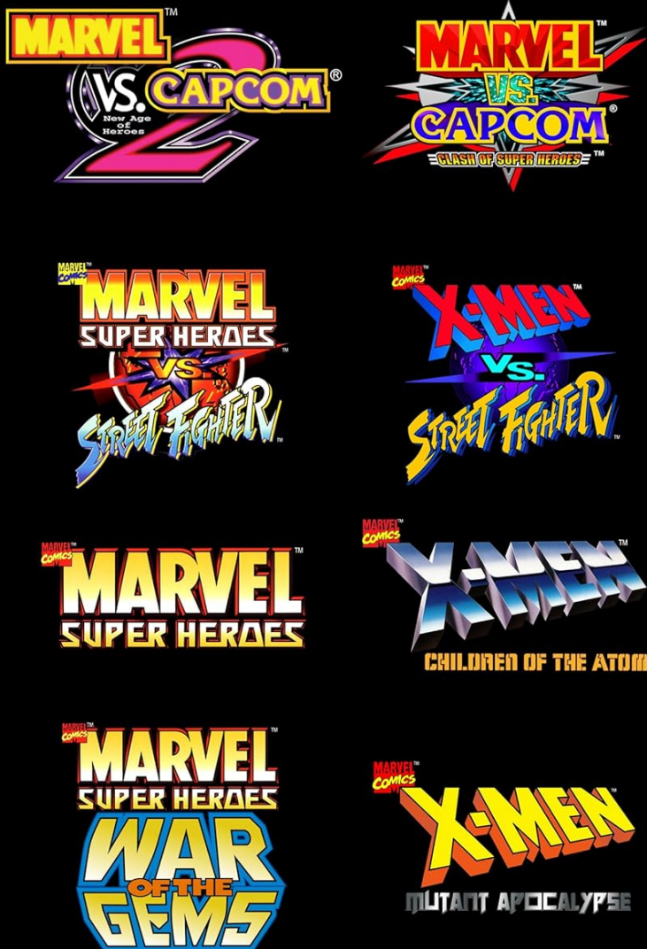
Figure 4: A graphic displaying the logos of the 8 classic games included with the arcade machine.