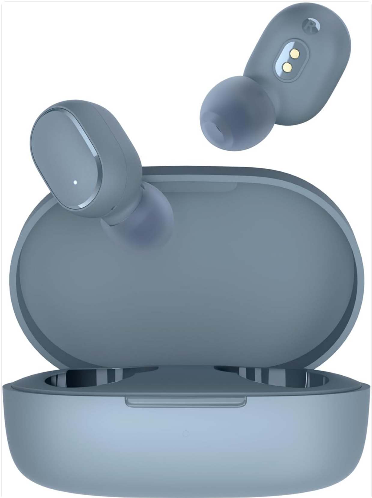
Figure 1: Xiaomi Redmi Buds Essential Wireless Earbuds and charging case. The earbuds are shown nestled within their blue charging case, which is open to reveal the earbuds.