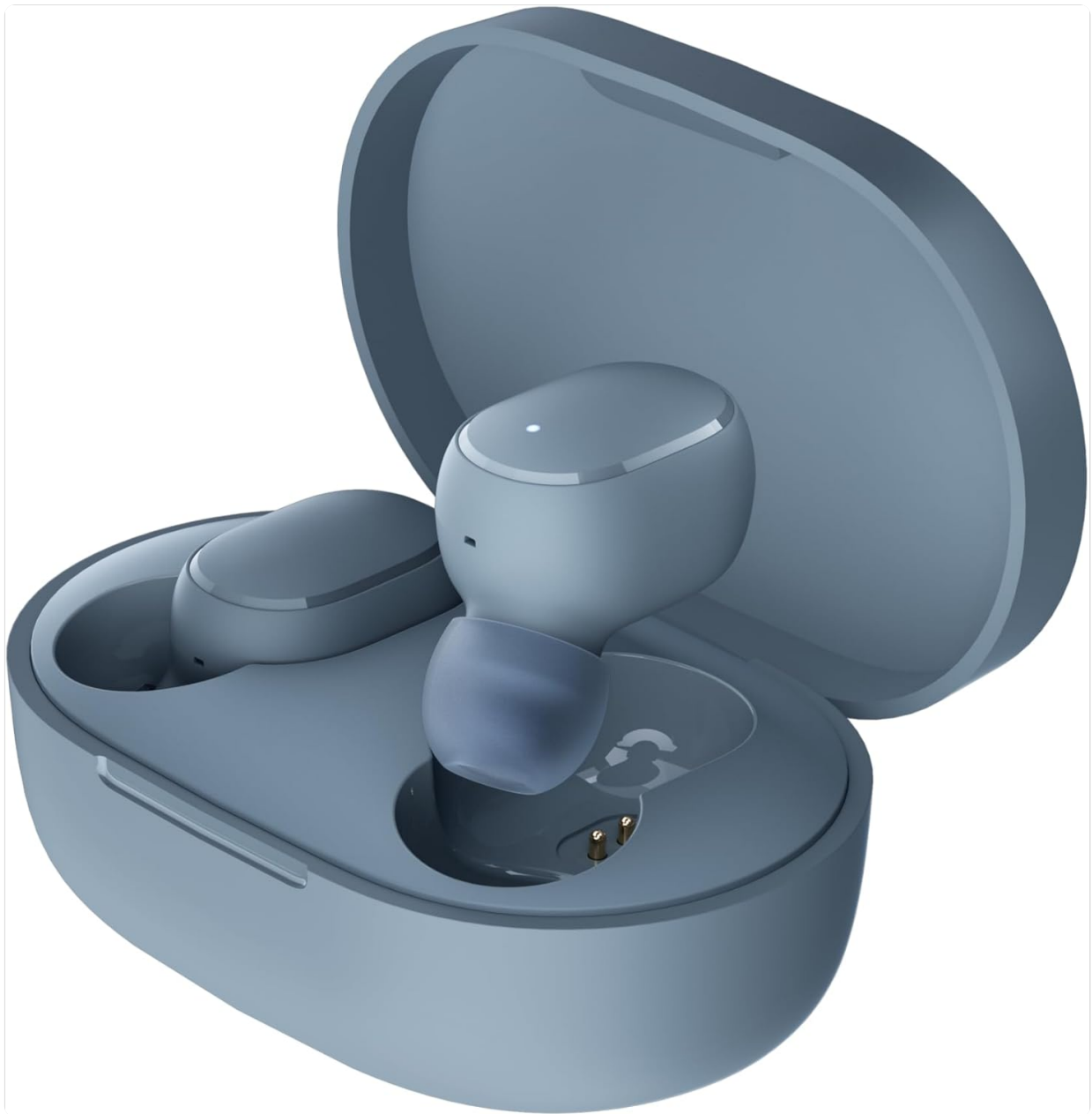
Figure 2: Front view of the Xiaomi Redmi Buds Essential. This image displays the front of the blue earbuds, highlighting their sleek design and the touch-sensitive area.