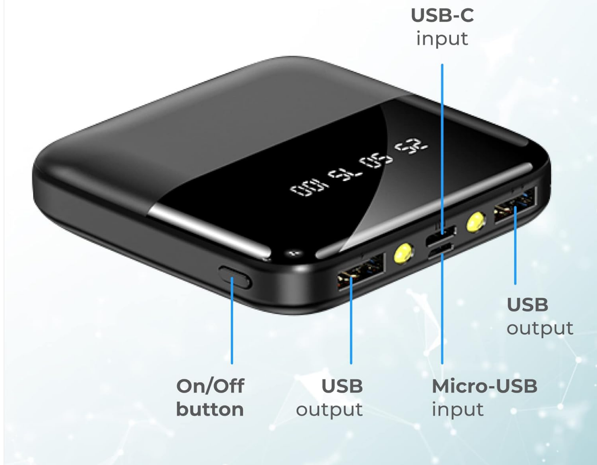
Image: Diagram showing the comprehensive interface of the Nuvance Mini Powerbank with labeled ports: On/Off button, USB output, Micro-USB input, USB-C input, USB output.