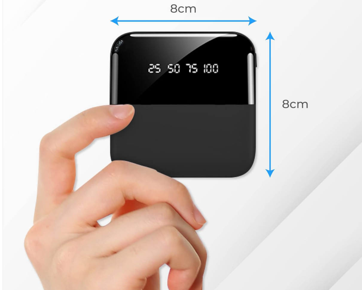
Image: Nuvance Mini Powerbank held in a hand, illustrating its compact size of 8cm by 8cm.

Thanks to its compact and lightweight size