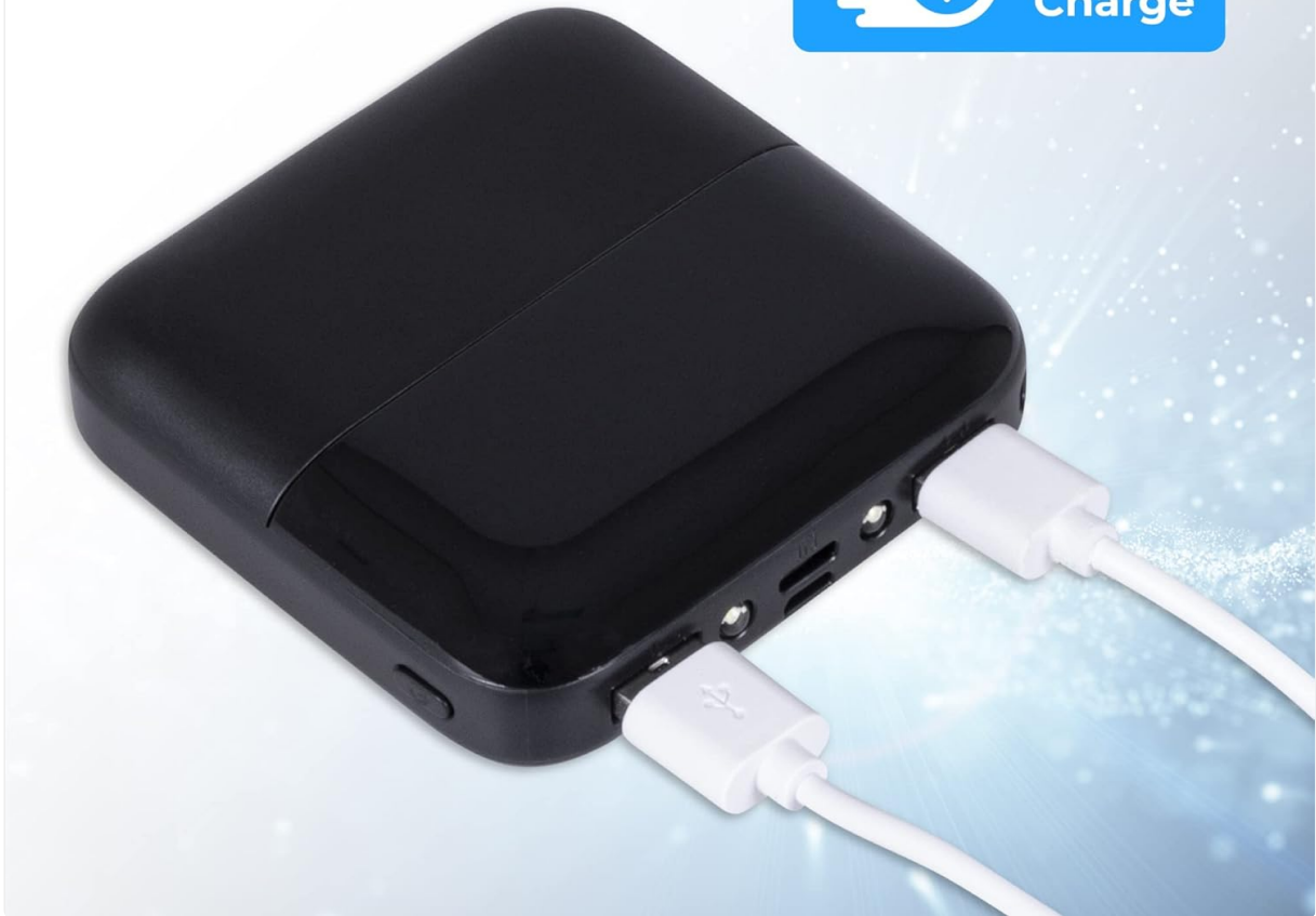
Image: Nuvance Mini Powerbank connected to two devices with charging cables, illustrating simultaneous charging capability.