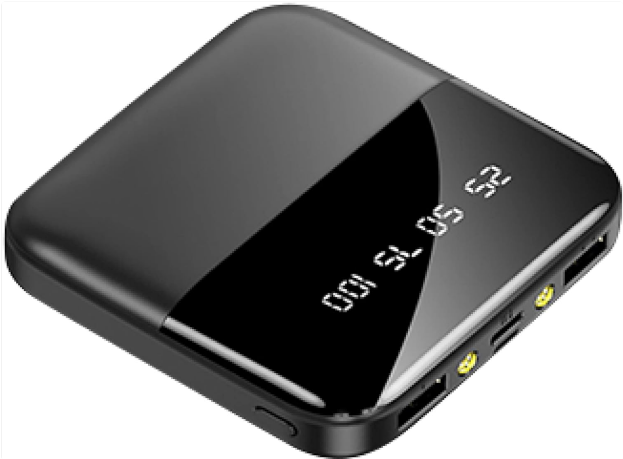
Image: Nuvance Mini Powerbank 10000mAh, black, showing its compact design and digital display.