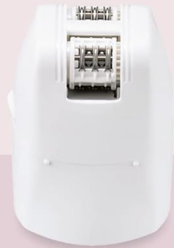
Tête zones sensibles premium