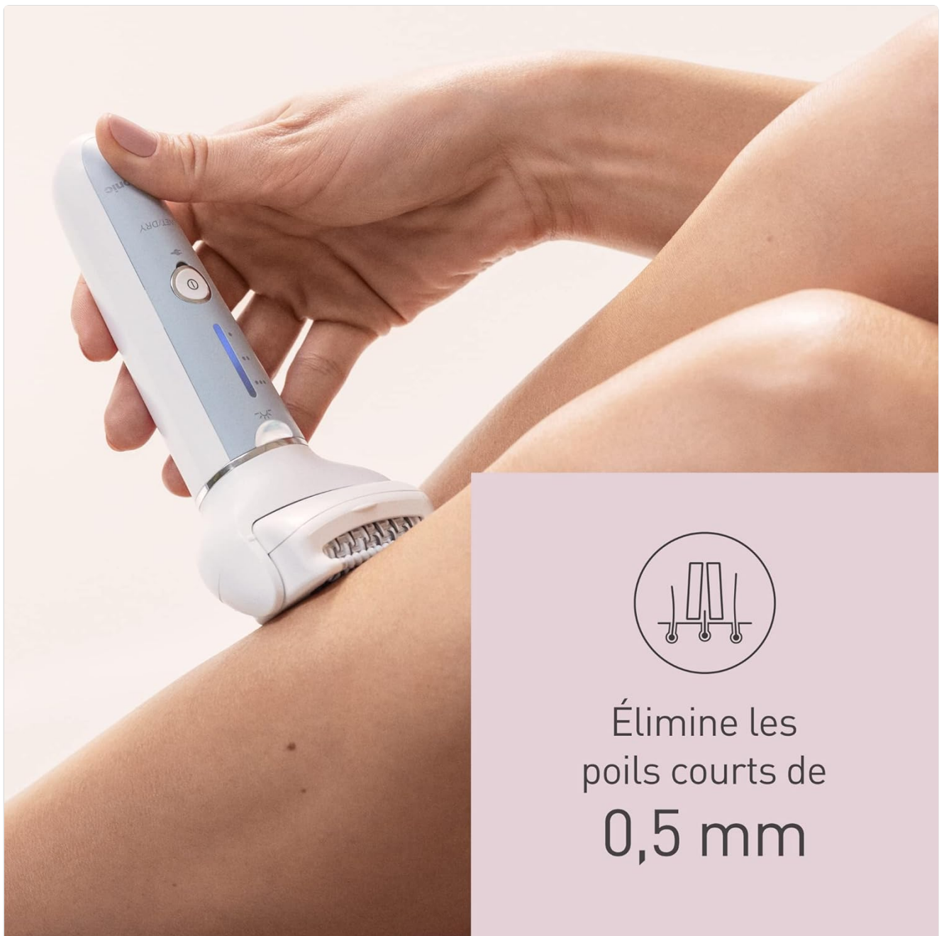
Image: The epilator being used on a leg, illustrating its capability to effectively remove hairs as short as 0.5 mm.