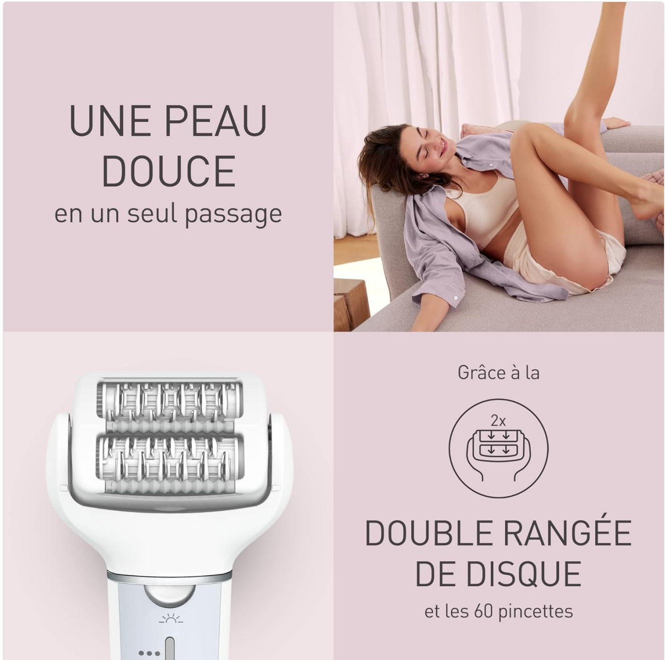
Image: The epilator head featuring the double disc system with 60 tweezers, designed to provide smooth skin in a single pass, shown alongside a woman with visibly smooth legs.