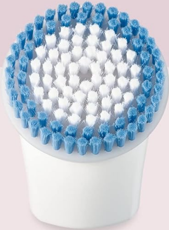
Tête brosse exfoliante