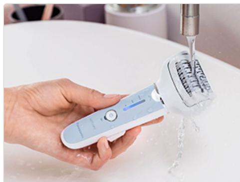
Image: A hand holding the epilator head under running water, demonstrating the ease of cleaning the waterproof device.