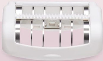
Accessoire protecteur de peau