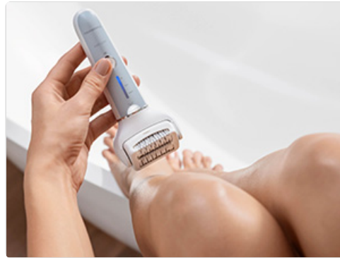
Image: The epilator equipped with the foot care head, being used to smooth the skin on a foot.