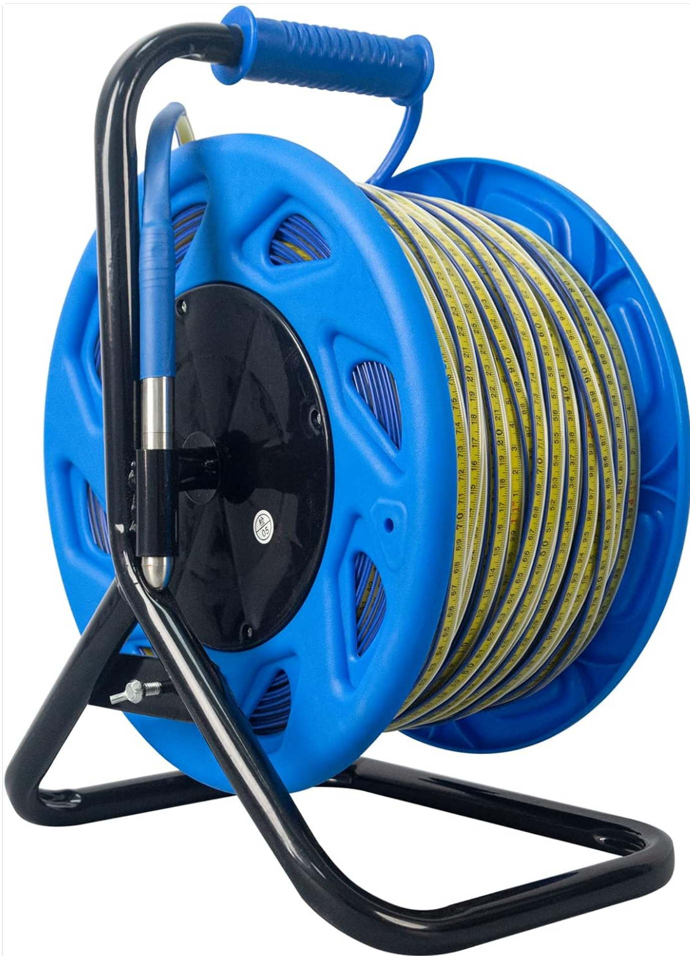
Figure 1: The Water Level Meter, featuring a blue reel and a sturdy black stand.