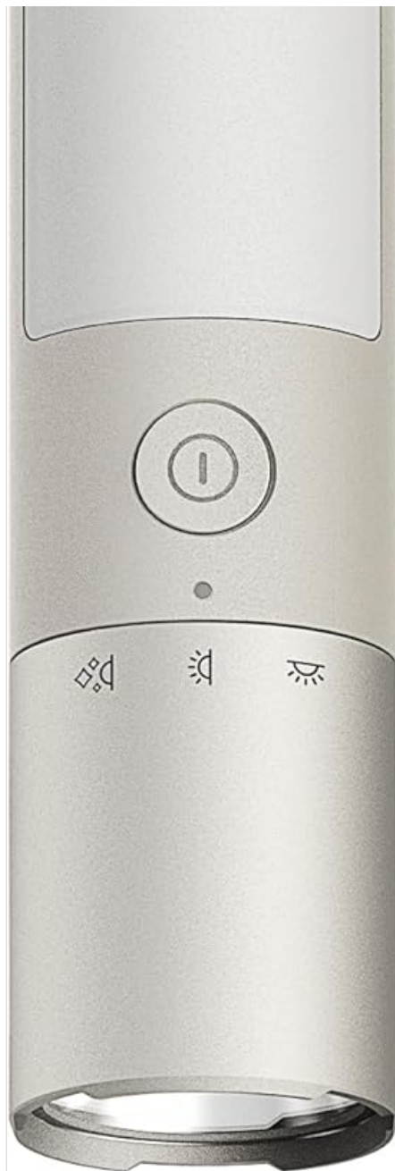
Image: Front view of the HOTO Flashlight Duo, showcasing its sleek design and dual light sources.