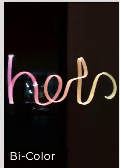
Image: Various uses of the flashlight's two light sources, including night walk, general lighting, warm light, flashing, and bi-color ambient light.