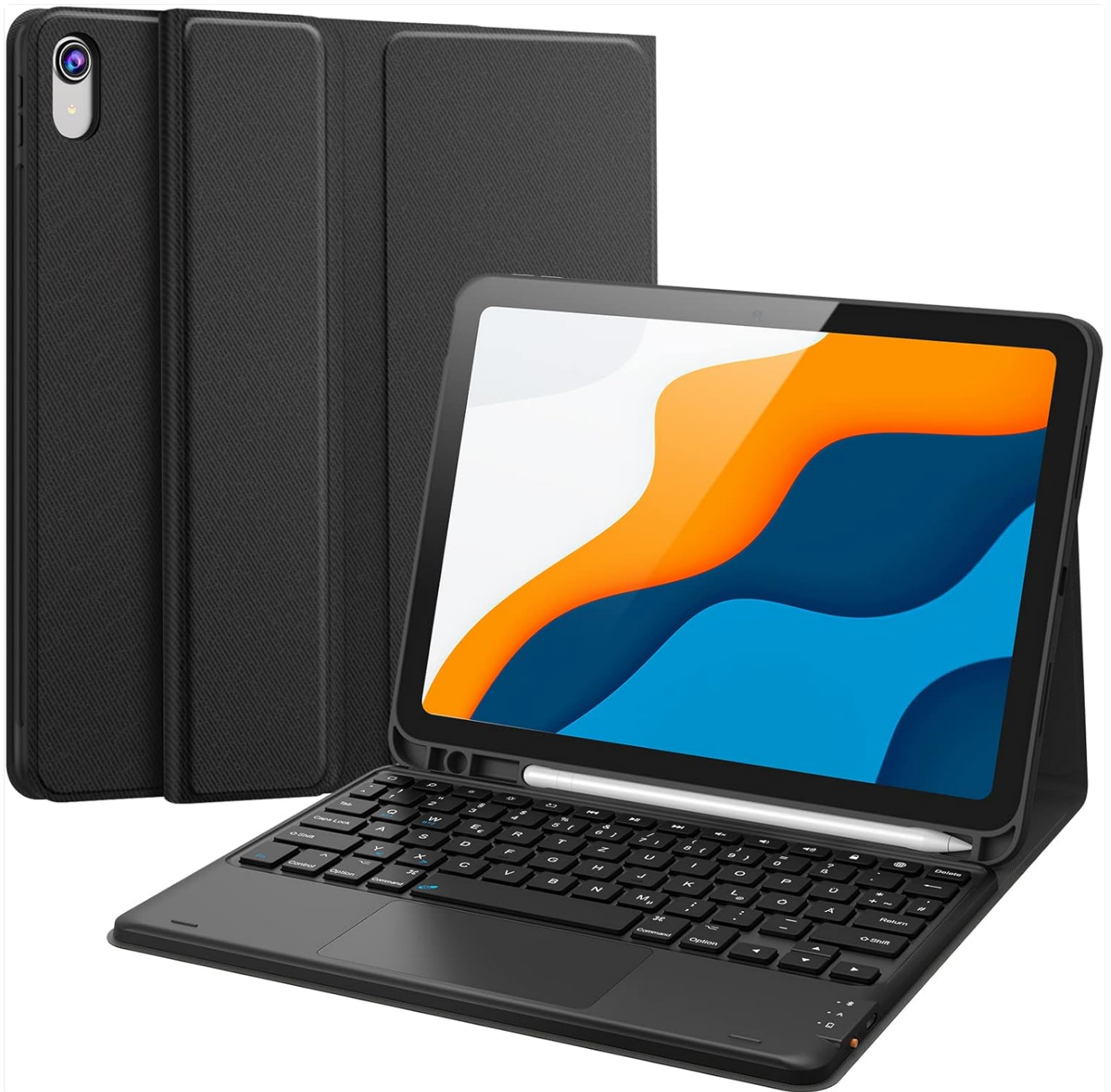
Figure 2: The Earto keyboard case with an iPad installed, ready for use.