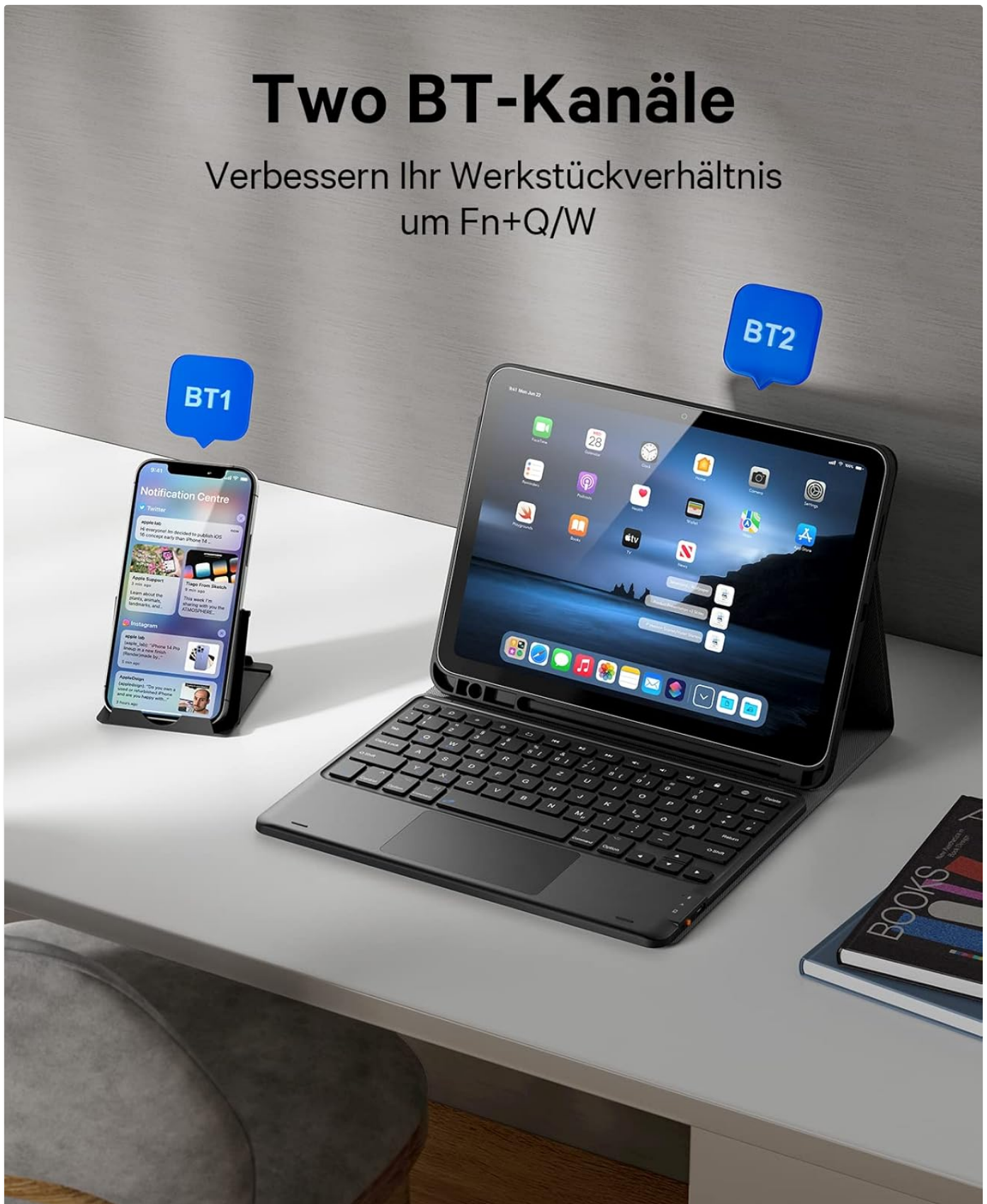
Figure 3: Connecting the keyboard to multiple devices using BT1 and BT2 channels.