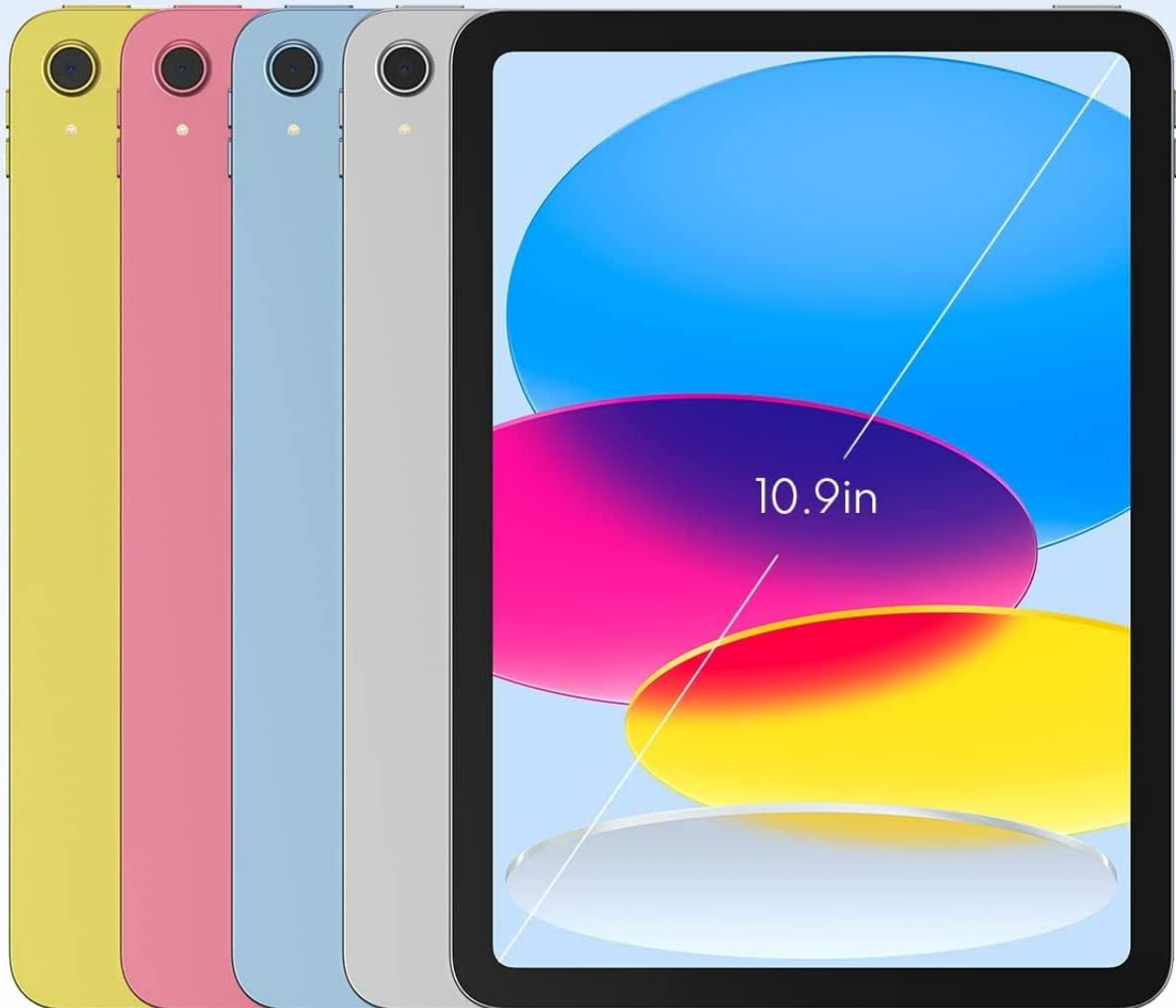
Figure 1: Visual guide for iPad 10th Generation compatibility, highlighting model numbers A2696, A2757, A2777.