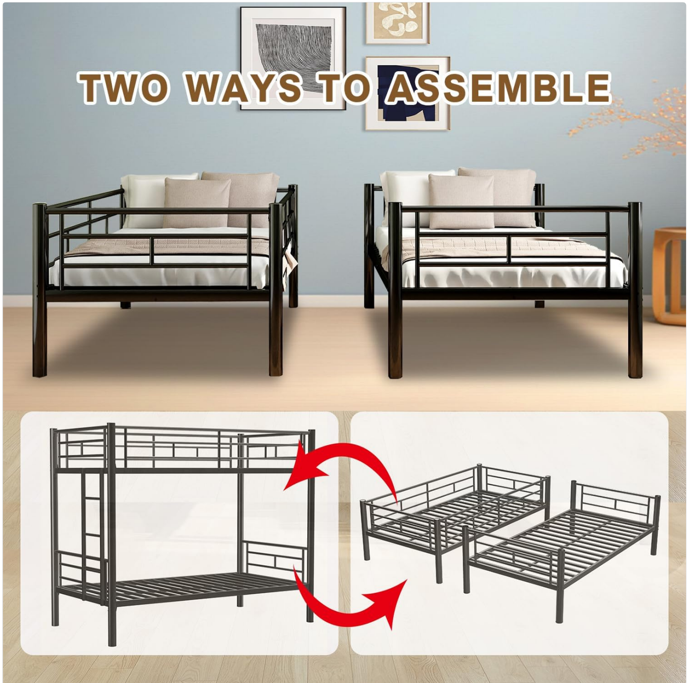
Figure 2: The HomJoones bunk bed offers flexible assembly, allowing it to be configured as a bunk bed or two individual twin beds.