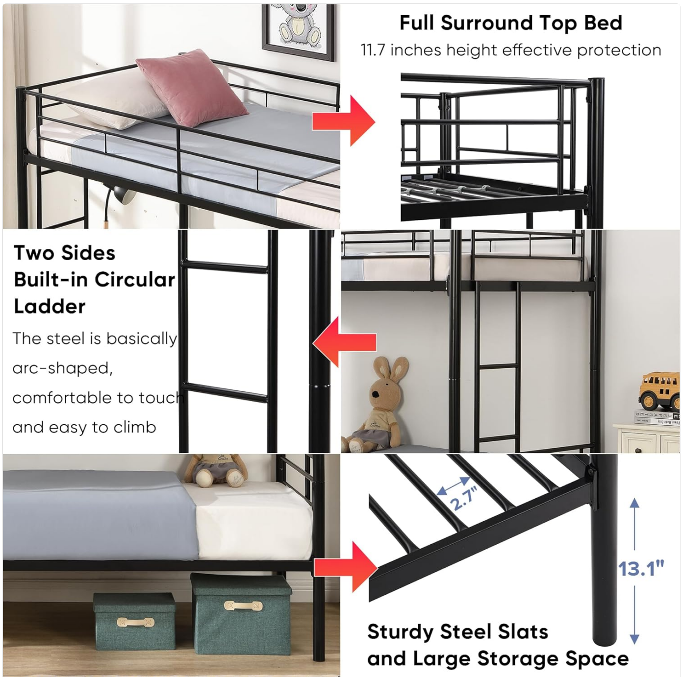
Figure 3: Close-up view of key design elements, including the safety guardrails, integrated ladders, and robust slat system.