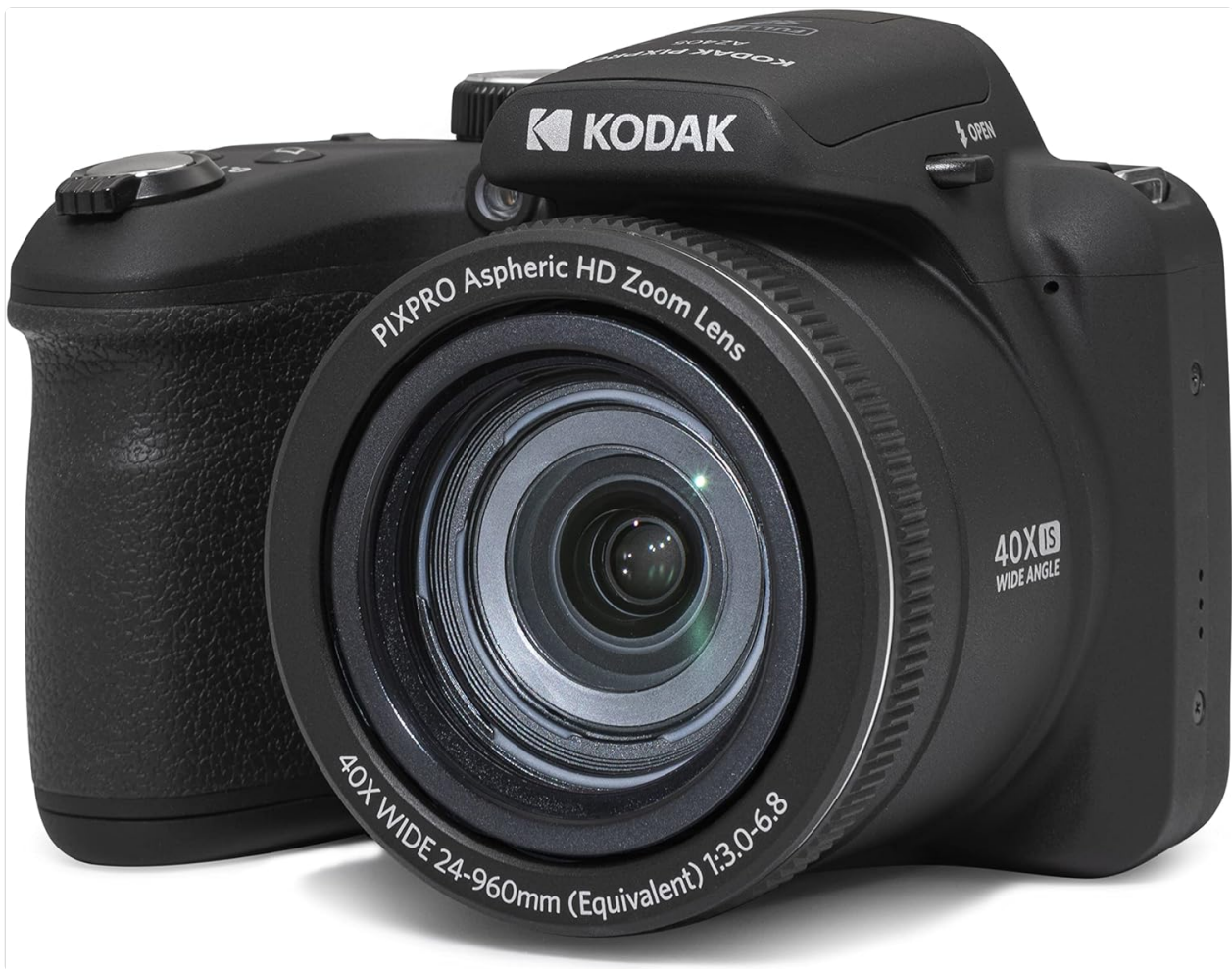
Front view of the KODAK PIXPRO AZ405 Digital Camera, showcasing its lens and ergonomic design.