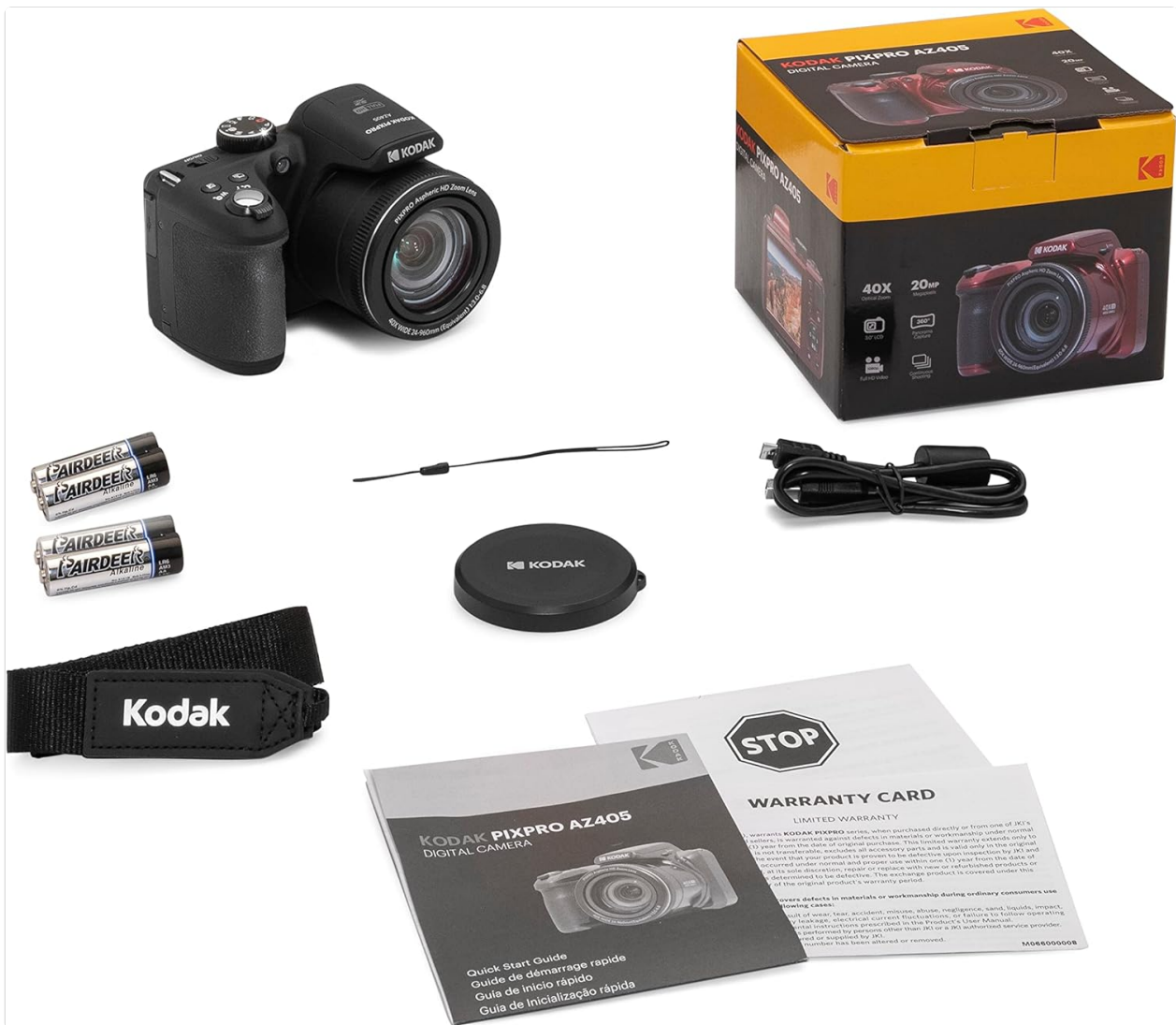
All items included in the KODAK PIXPRO AZ405 retail box, neatly laid out.