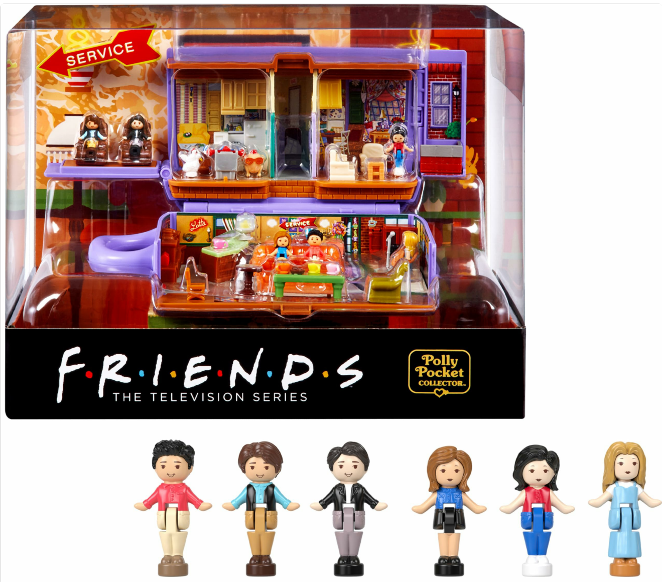
Image 1.1: The Polly Pocket Friends Compact Playset in its open state, revealing the detailed interior scenes.