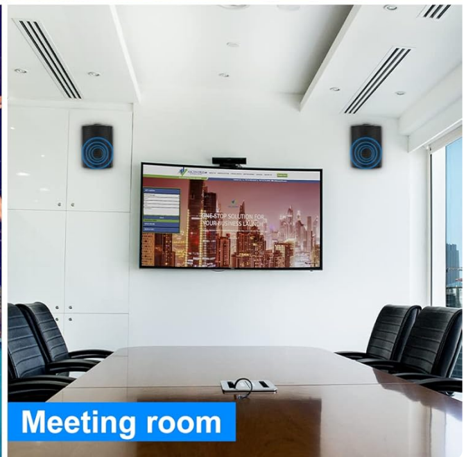
Image: Herdio speakers seamlessly integrated into diverse environments, including a patio, outdoor gathering, swimming pool area, and a meeting room, showcasing their versatile application.