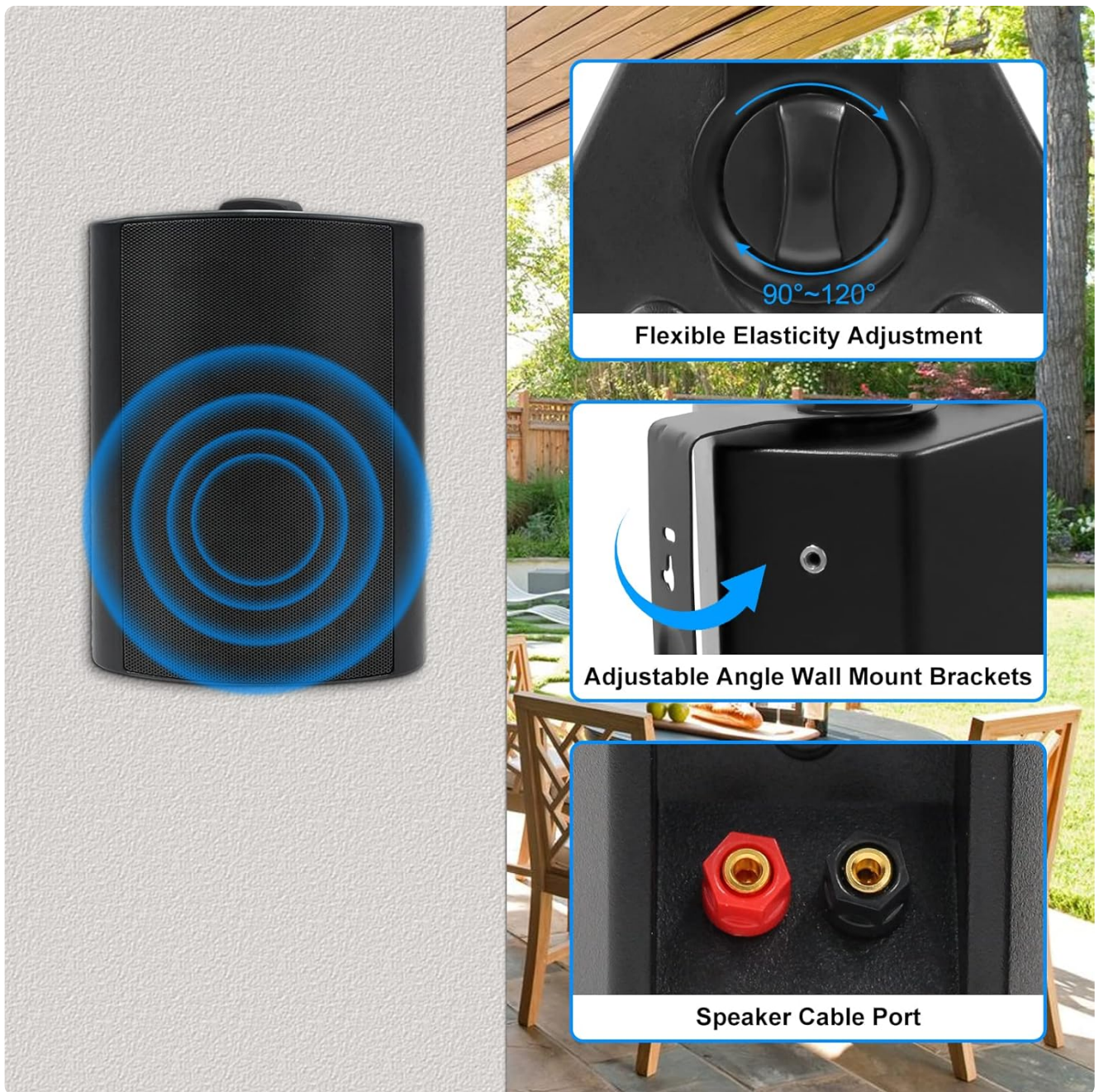
Image: Close-up view of the Herdio speaker's rear, showing the flexible elasticity adjustment for the bracket (90-120 degrees) and the adjustable angle wall mount brackets, along with the speaker cable port.