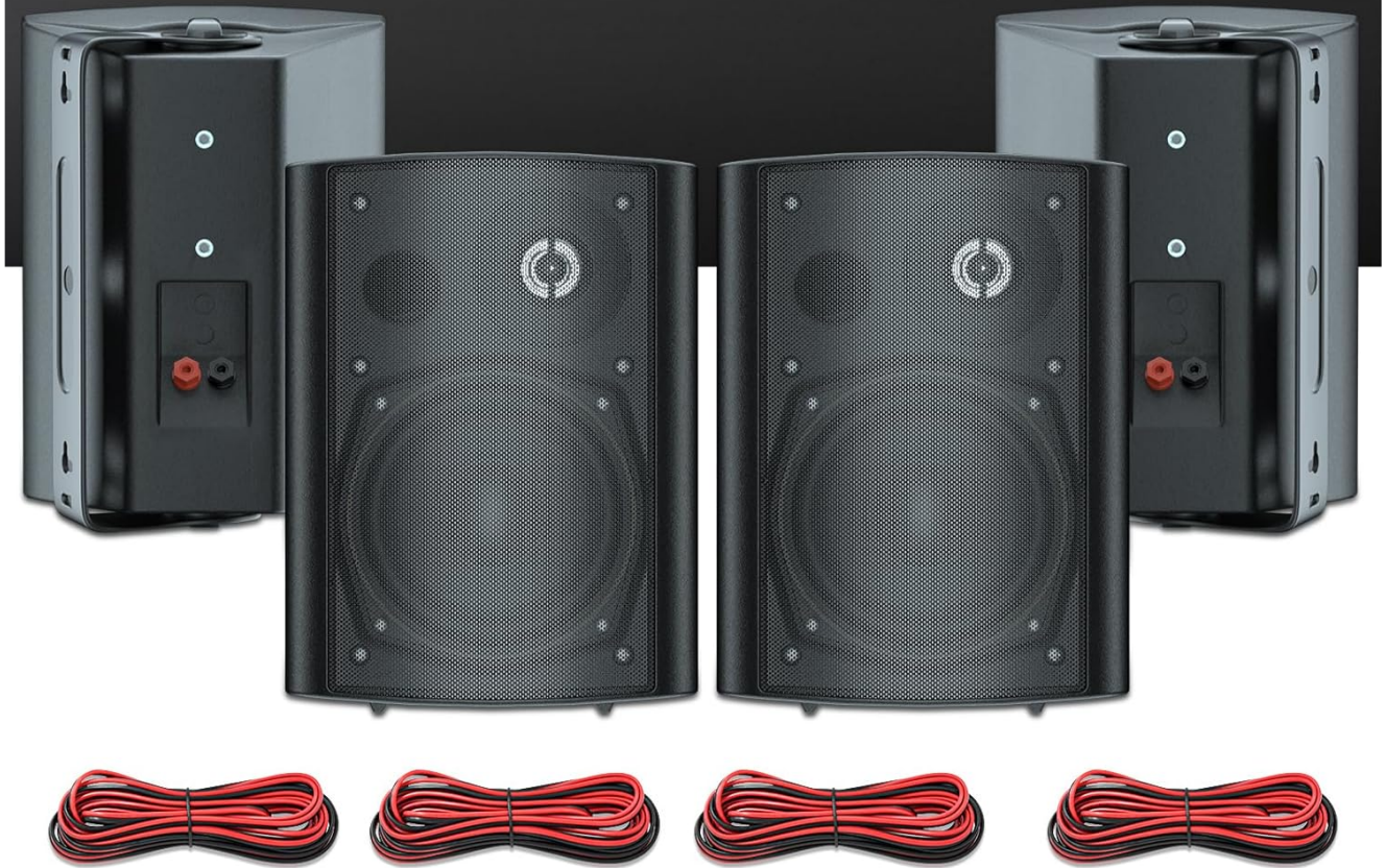
Image: The complete package contents laid out, showing four black Herdio speakers, four mounting brackets, and four coiled speaker cables.

Video: An overview of the Herdio 5.25-inch 600-Watt Passive Indoor Outdoor Speakers, demonstrating their features and components.