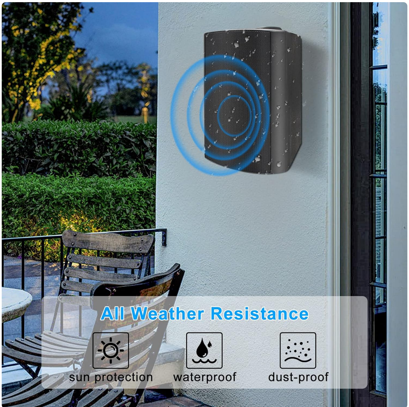
Image: The Herdio speaker highlighting its all-weather resistance, including sun protection, waterproof design, and dust-proof construction, suitable for outdoor use.