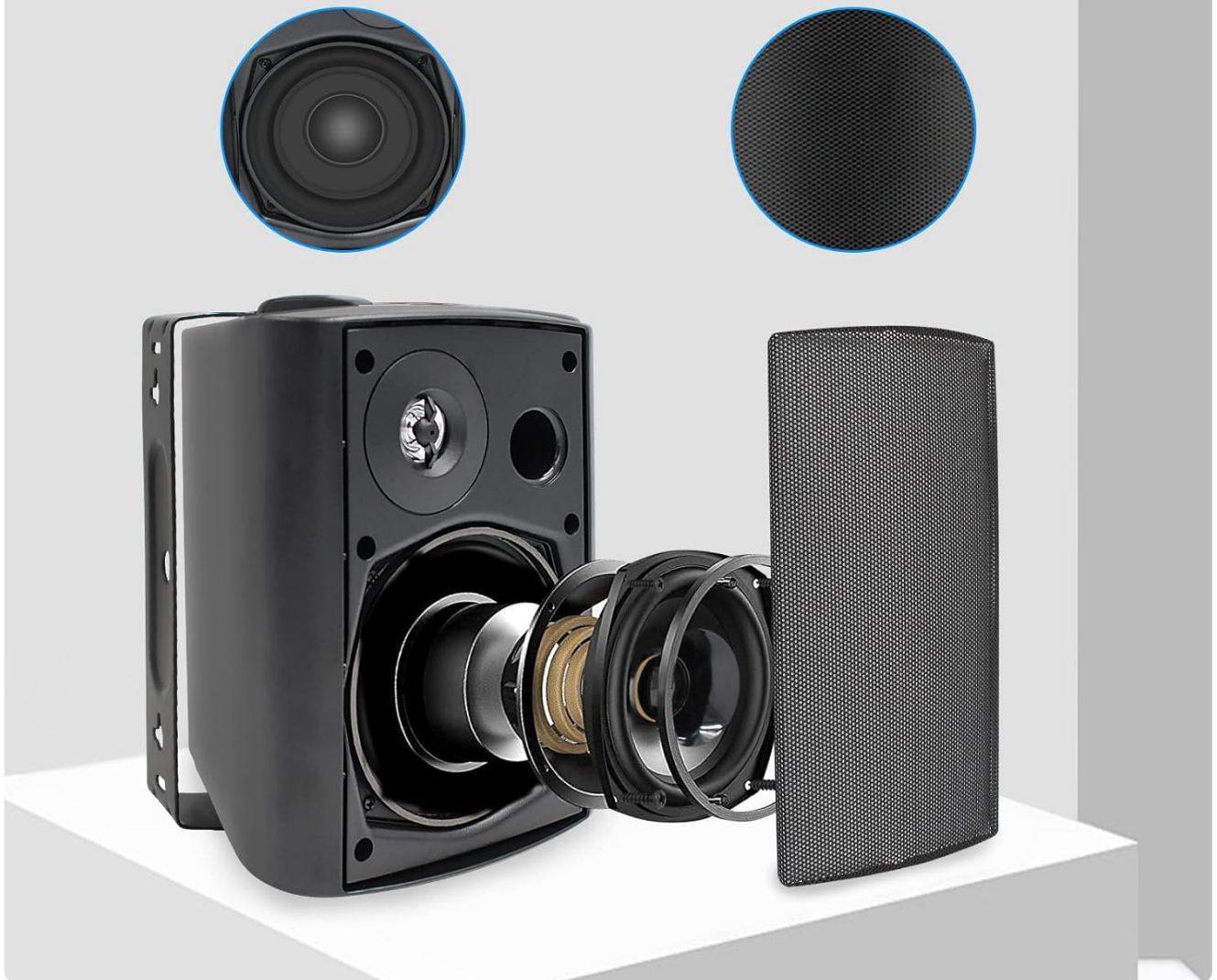
Image: An exploded view of the Herdio speaker, highlighting its internal components including the woofer, tweeter, and internal wiring, demonstrating its robust construction.

Made of ABS Material, Rugged and Durable Fantastic Sound and Pretty loud