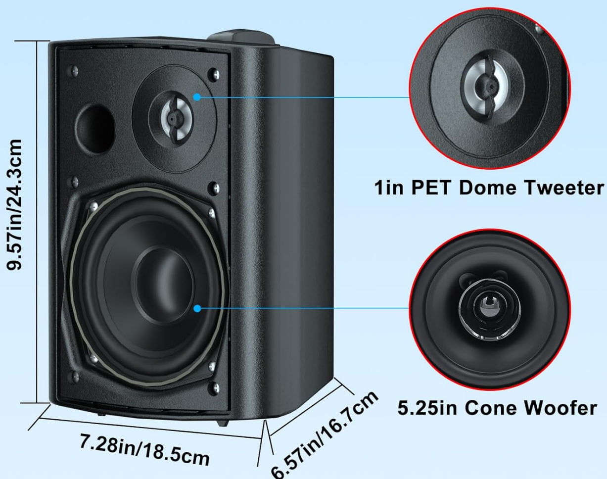
Image: Detailed illustration of the Herdio speaker's dimensions, highlighting the 1-inch PET Dome Tweeter and 5.25-inch Cone Woofer.