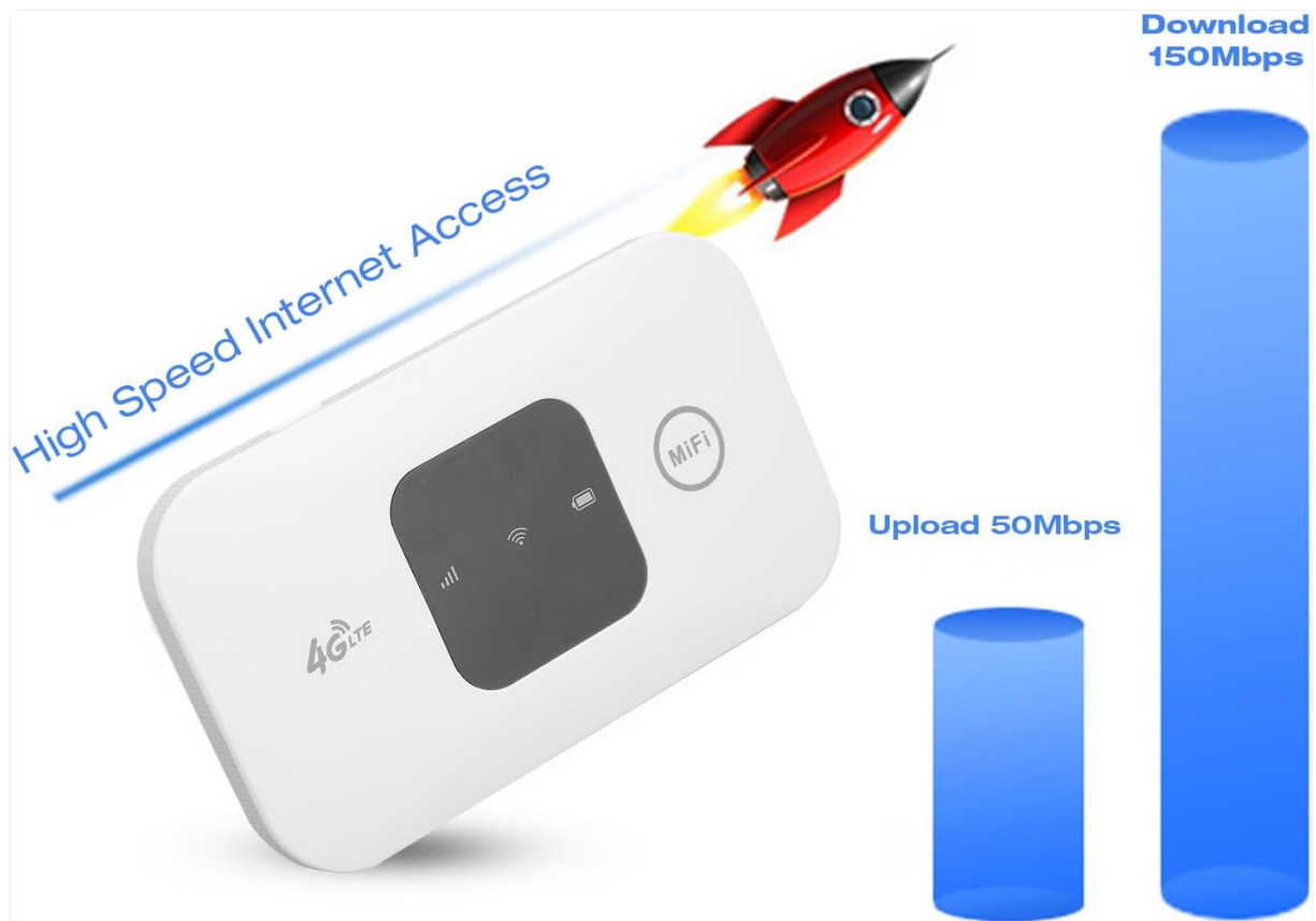
Image: Front view of the ASHATA MF800-2 4G LTE Mobile WiFi Router.