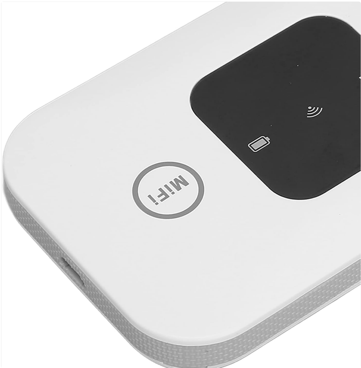
Image: Close-up of the 'MiFi' button on the router.