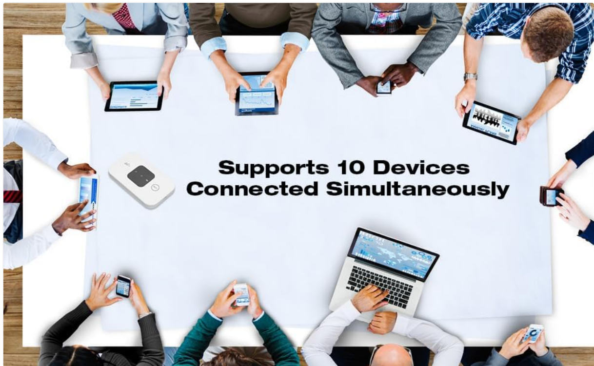
Image: Multiple devices connected to the ASHATA MF800-2 router, showing its multi-user support.

Image: The router demonstrating its portability by fitting into a pocket.