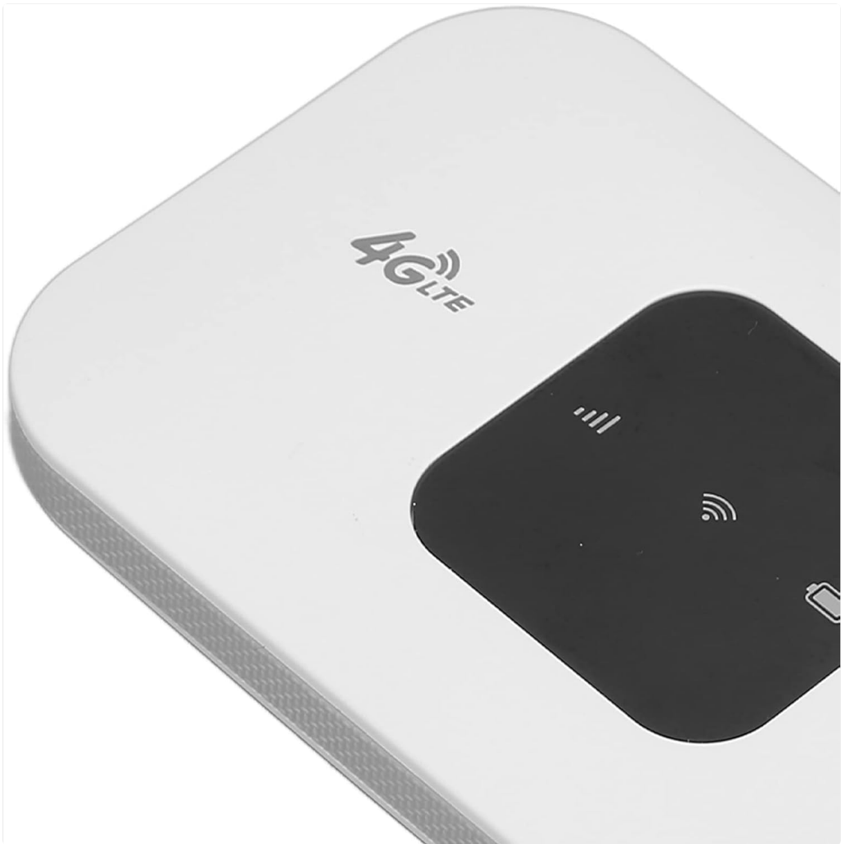
Image: Close-up of the router's front panel with 4G LTE logo and indicators.