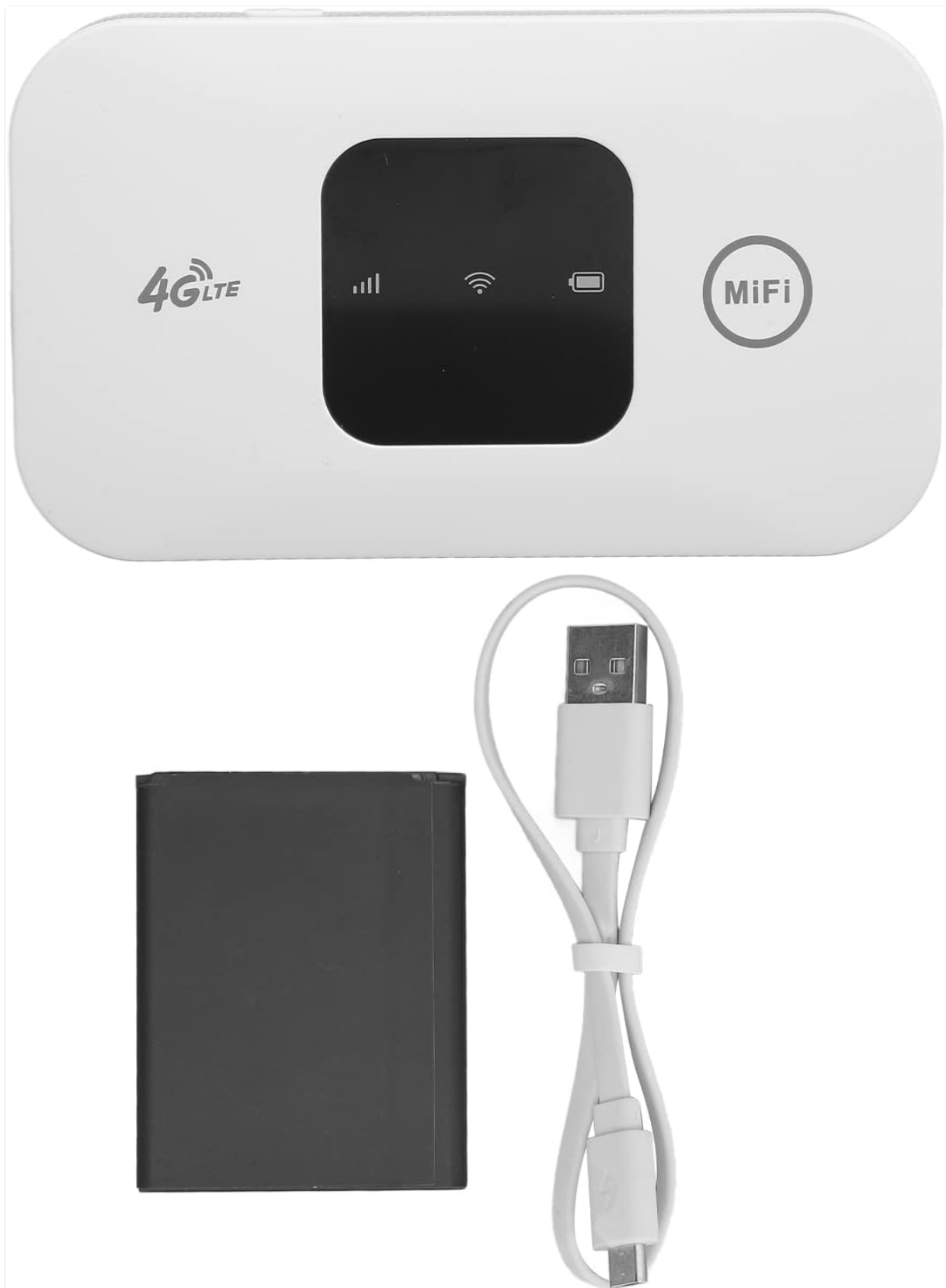
Image: Package contents including the router, battery, and charging cable.