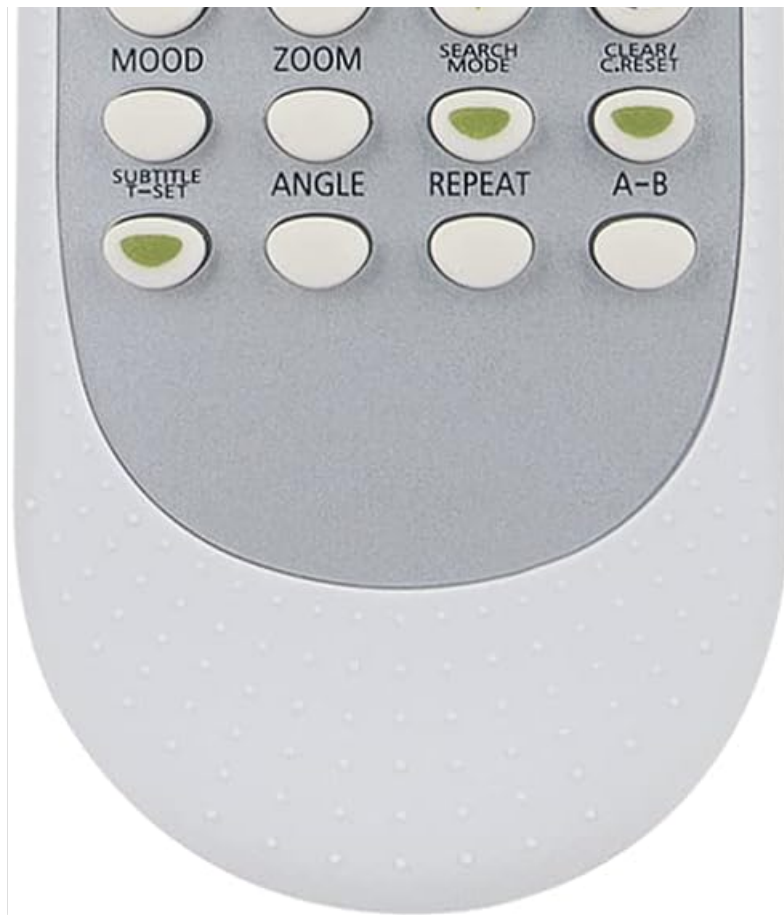
Figure 2: Remote Control Button Layout