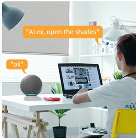
Image: Example of voice control integration with a smart speaker.