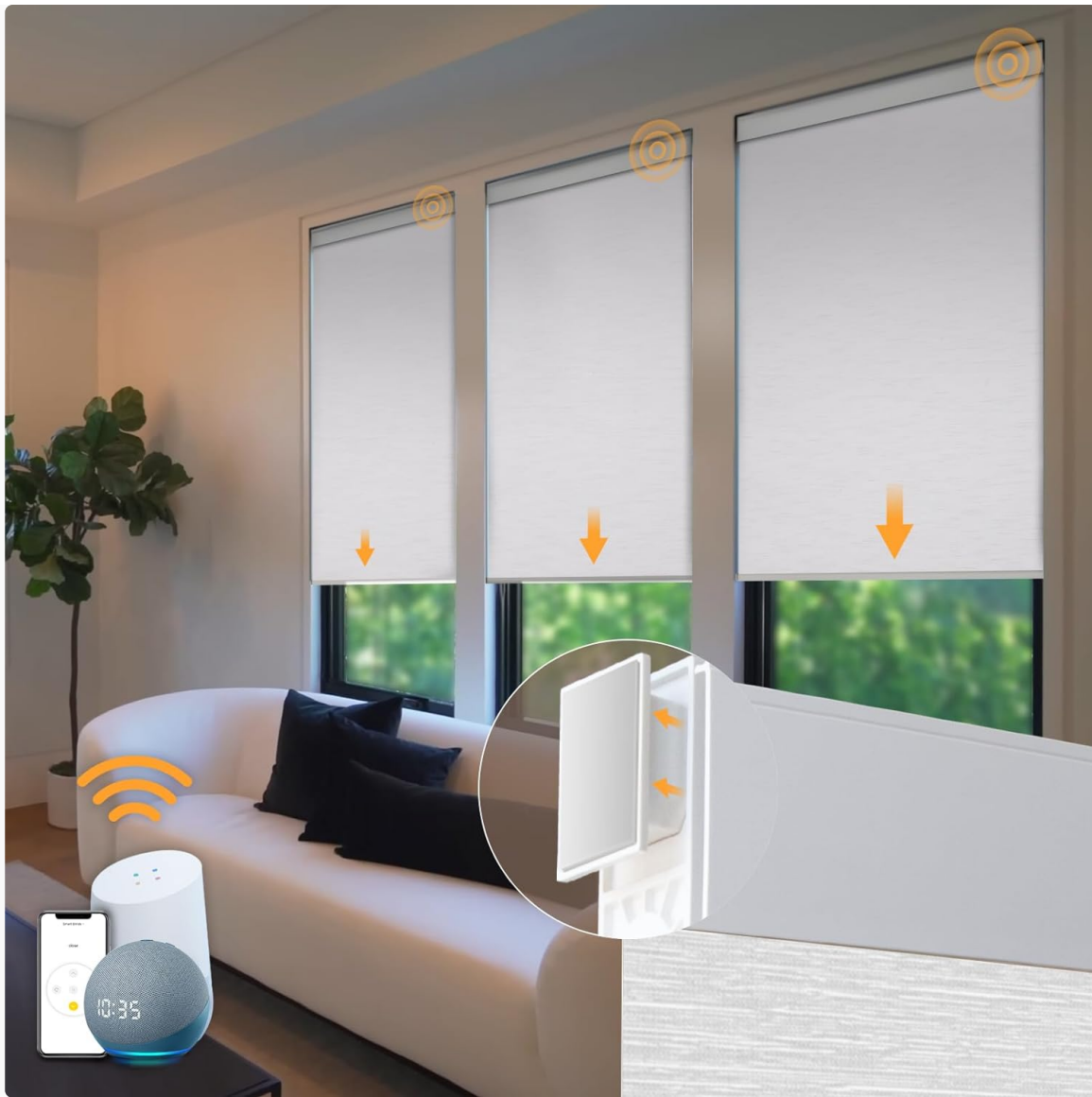
Image: Hapadif Motorized Blinds installed in a living room, demonstrating smart home compatibility.