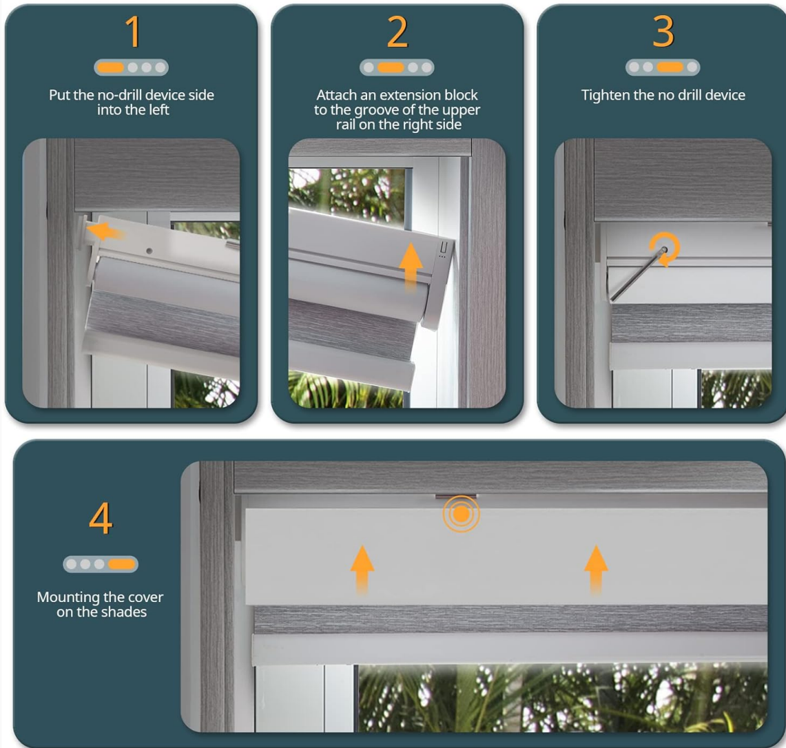
Image: Step-by-step guide for no-drill installation of the motorized blinds.