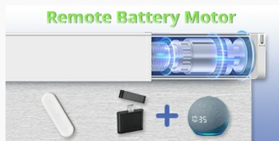
Image: Illustration of the remote battery motor and battery replacement.

The motorized blinds are powered by batteries located in a compartment at the top of the unit. When the batteries are low, simply remove and replace them. The motor is designed for low energy consumption, with batteries typically lasting for approximately 600 operations (about half a year with average use).