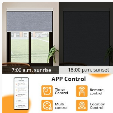
Image: App control interface demonstrating timer, remote, multi, and location control features.

Image: Overview of the AX290 Remote Motor system, including optional smart bridge for app and voice control.