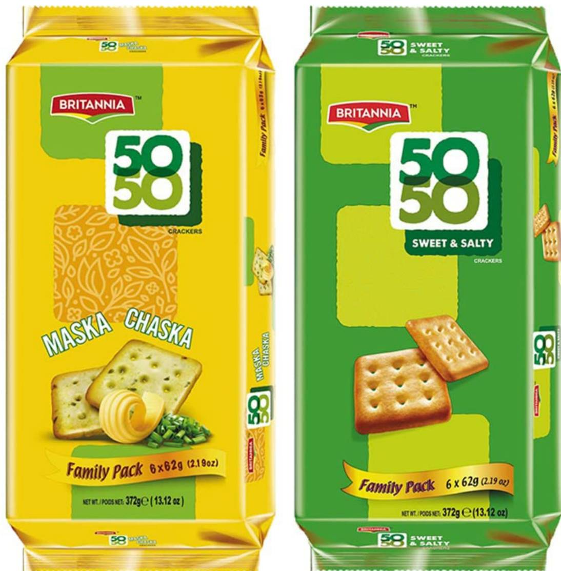
Image: Two packs of Britannia 50 50 crackers, one yellow for Maska Chaska and one green for Sweet & Salty, showcasing the product packaging.