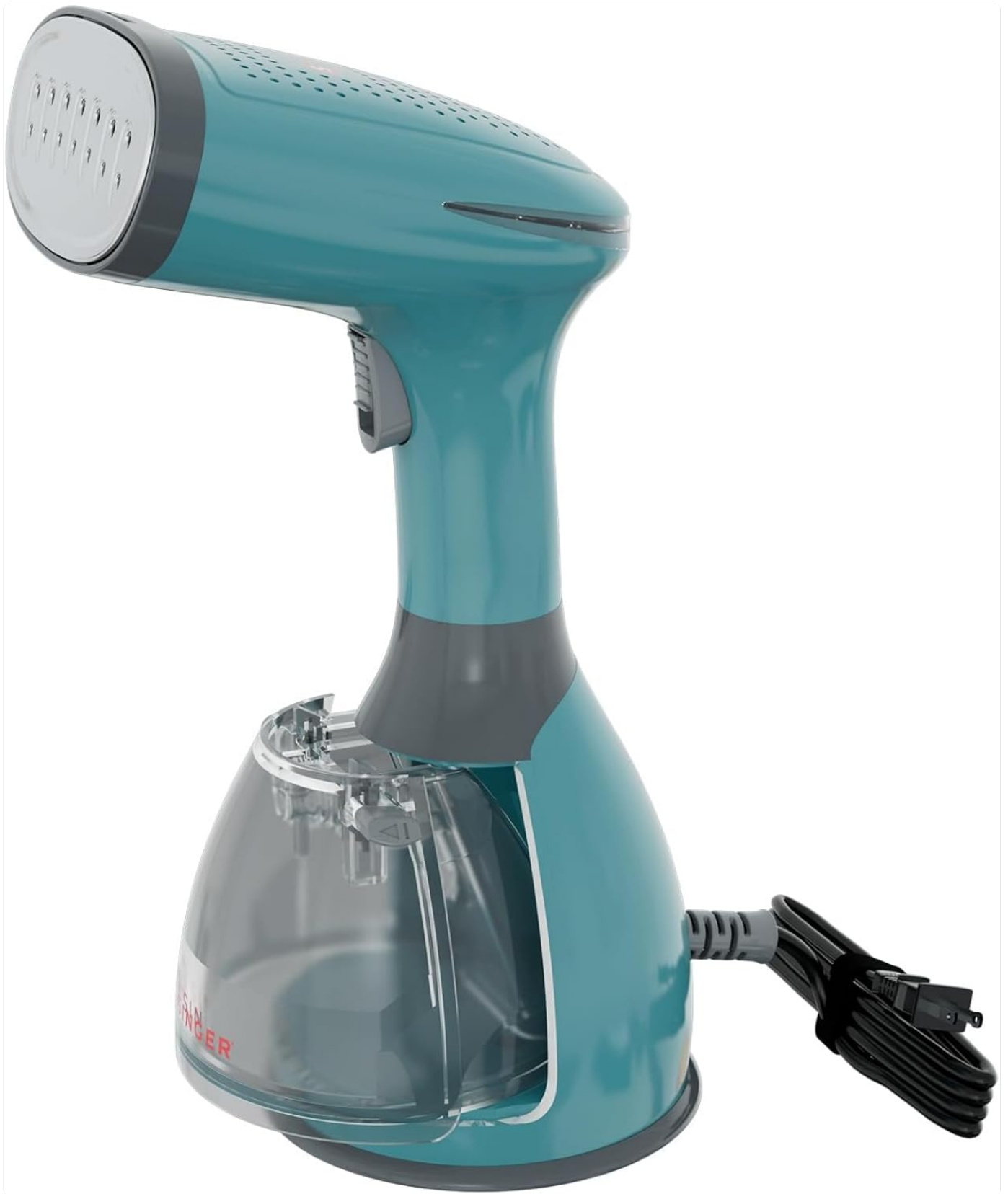
Main Unit: The core handheld steamer with a comfortable grip and steam nozzle.