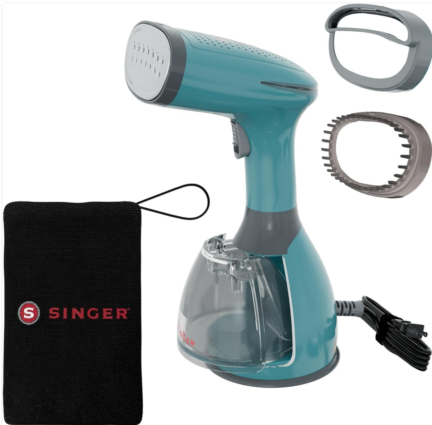
Steamer and Included Accessories: The steamer comes with various attachments for different fabric types and a convenient carrying bag.