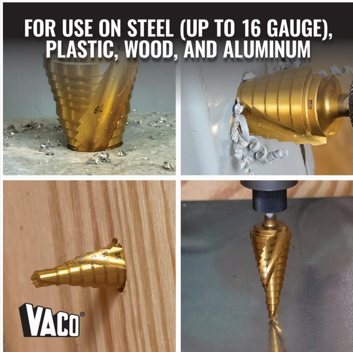
Figure 5: Examples of the Klein Tools step drill bit being used on different materials including steel, plastic, wood, and aluminum, demonstrating its versatility.