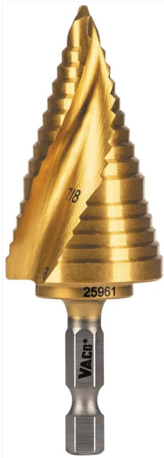
Figure 1: Front view of the Klein Tools 25961 Step Drill Bit, showing its spiral flutes and laser-etched model number.