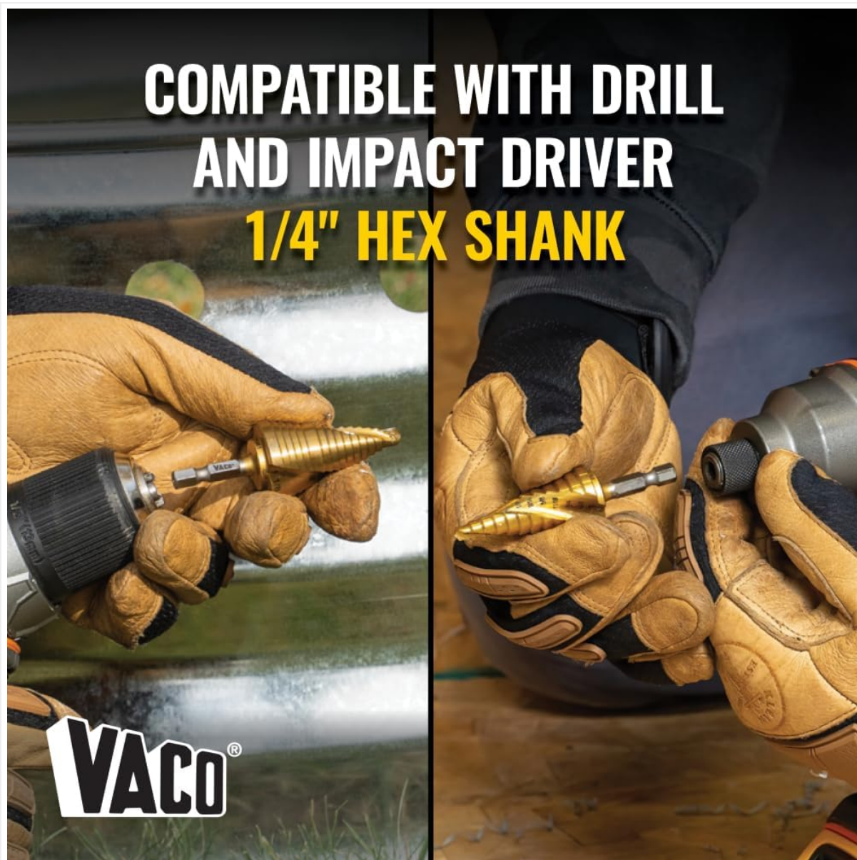
Figure 3: The Klein Tools step drill bit shown inserted into both a standard drill chuck and an impact driver, demonstrating its 1/4" hex shank compatibility.