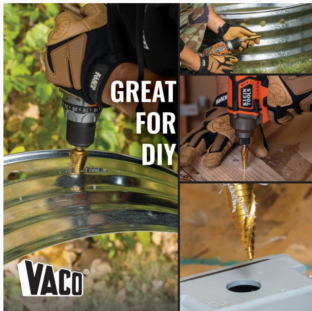
Figure 4: A user demonstrating the use of the Klein Tools step drill bit to create a hole in a metal surface, highlighting its suitability for DIY projects.