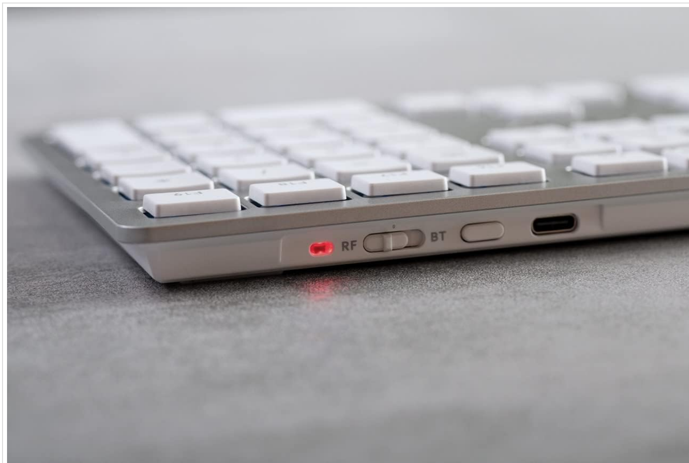
Image 4.1: Side view of the keyboard, highlighting the RF/BT connectivity switch and the USB-C charging port.