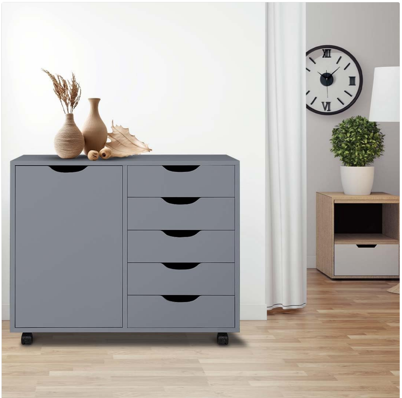
Image: The Naomi Home Amy 5-Drawer Cabinet with Shelf, showcasing its modern gray finish and compact design in a home environment.