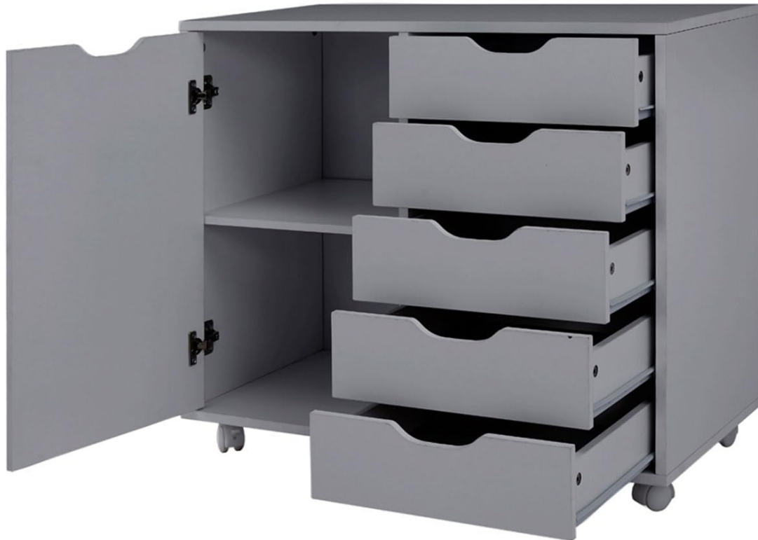
Image: The cabinet with its door open, revealing the internal shelf, and drawers partially pulled out, demonstrating storage capacity.