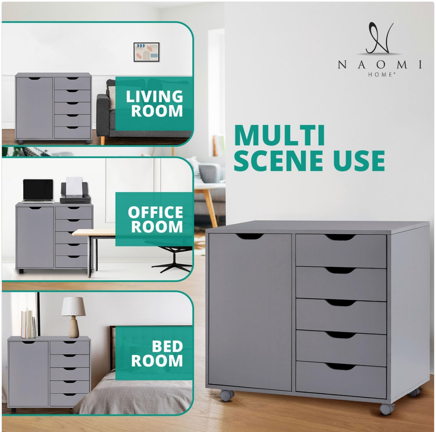
Image: Examples of the cabinet's versatility, showing its use in a living room, office room, and bedroom.