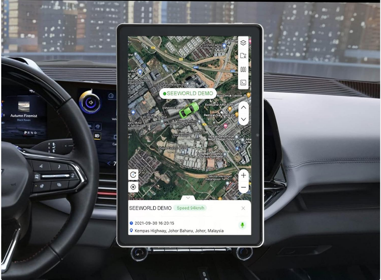
Figure 7: GPS navigation capabilities for indoor and outdoor use.

GPS positioning and navigation, to protect you and create indoor navigation function the national super high 300 airports High-speed rail stations, shopping malls and other public places.