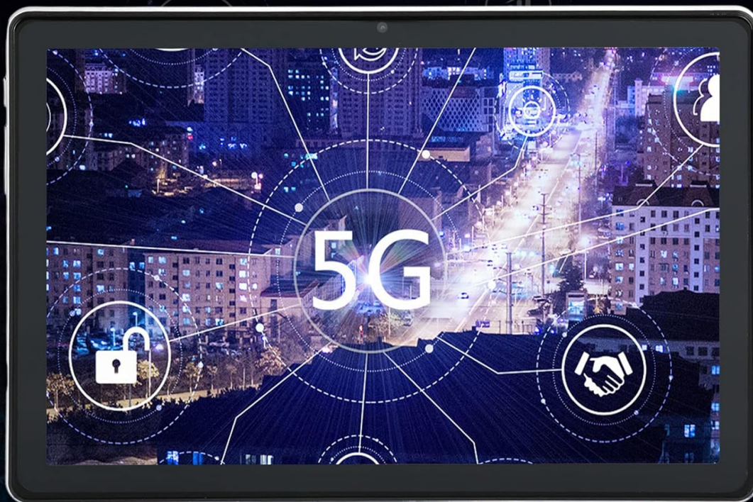
Figure 5: The tablet supports 5G network connectivity and Bluetooth 5.0 for file transfer.

Connect the mobile phone Bluetooth, you can transfer pictures and files with the mobile phone, convenient and fast