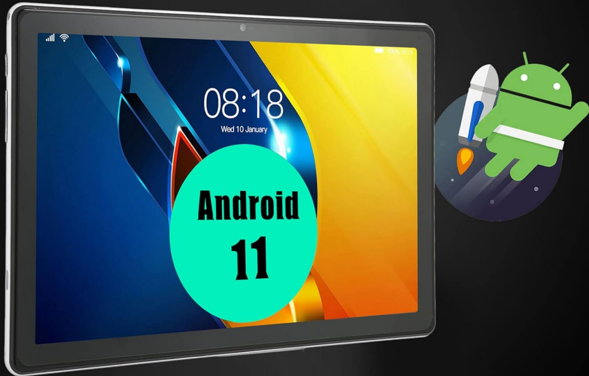
Figure 4: The tablet runs on the Android 11 operating system.

Android 11 harnesses the power of AI give you more from your phone. The Edition contains the best of Android, built with new and reimagined apps, provides a smarter, more efficient and convenient user experience.