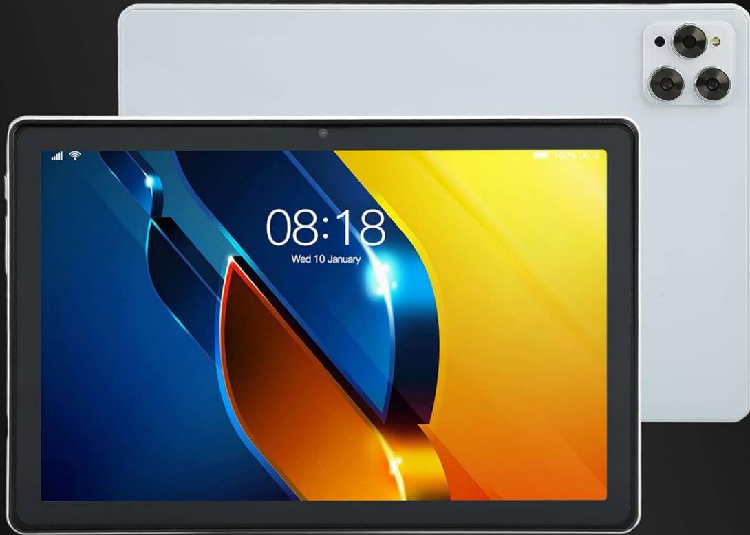
Figure 3: Front (8MP) and Rear (20MP) cameras for capturing moments.

Kids Tablet 8.0 megapixels front, 20.0 megapixels rear with flash, ultra high definition photography