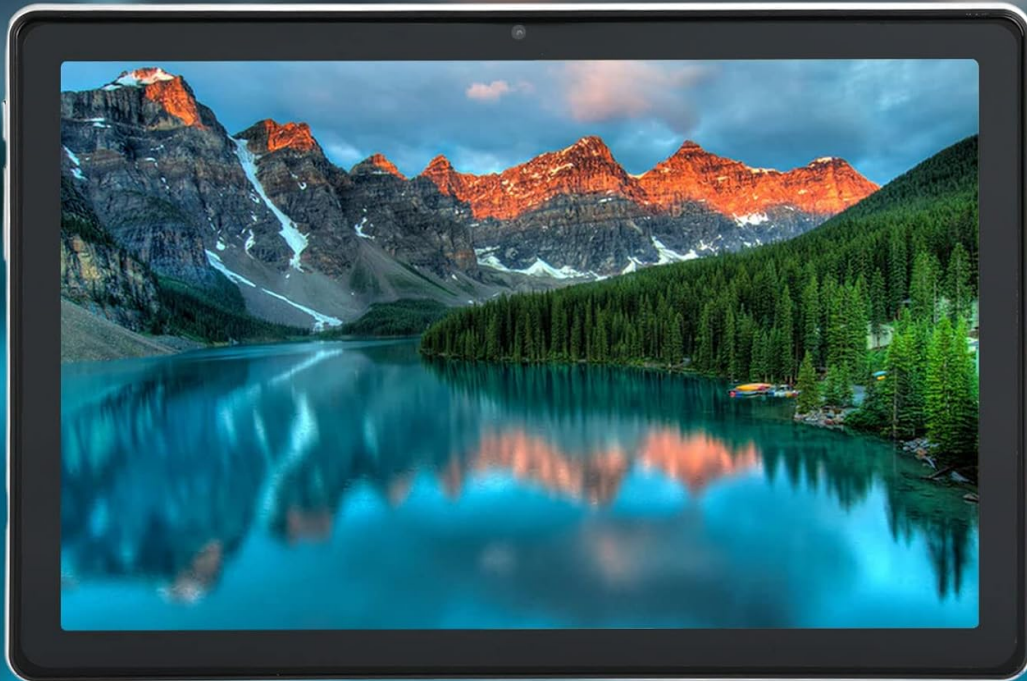
Figure 1: The 10-inch IPS HD display with eye protection features.

1920 x 1200 HD IPS display Eye protection full screen Double anti blue light design to preserve eyes