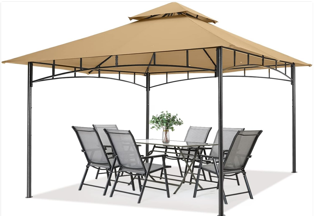
Figure 1: Assembled MASTERCANOPY Outdoor Garden Gazebo (11x11, Beige)

Thank you for choosing the MASTERCANOPY Outdoor Garden Gazebo. This manual provides essential information for the safe assembly, operation, maintenance, and troubleshooting of your new gazebo. Please read it thoroughly before beginning assembly and retain it for future reference.