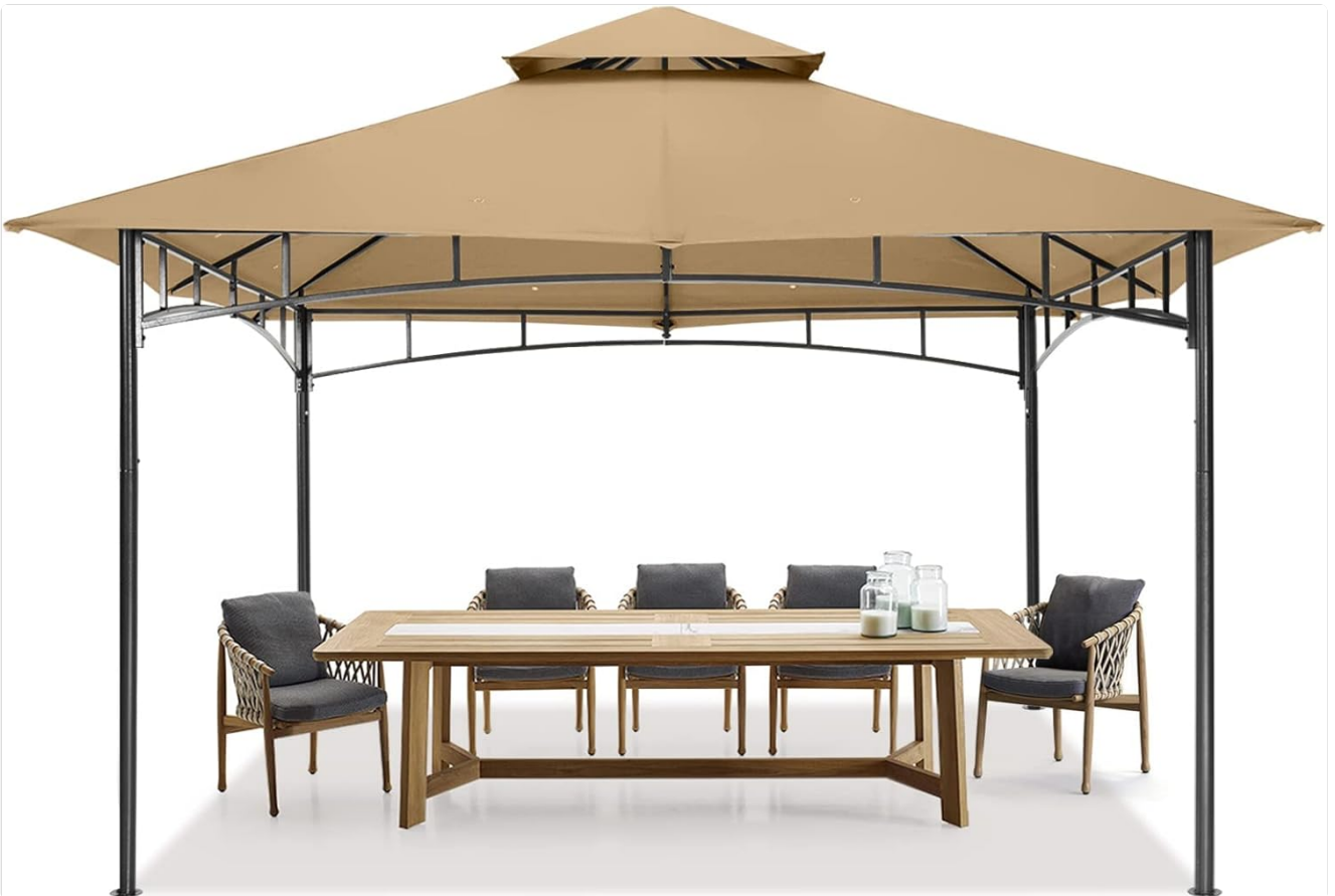
Figure 5: The gazebo offers ample shade, perfect for outdoor dining or relaxation.