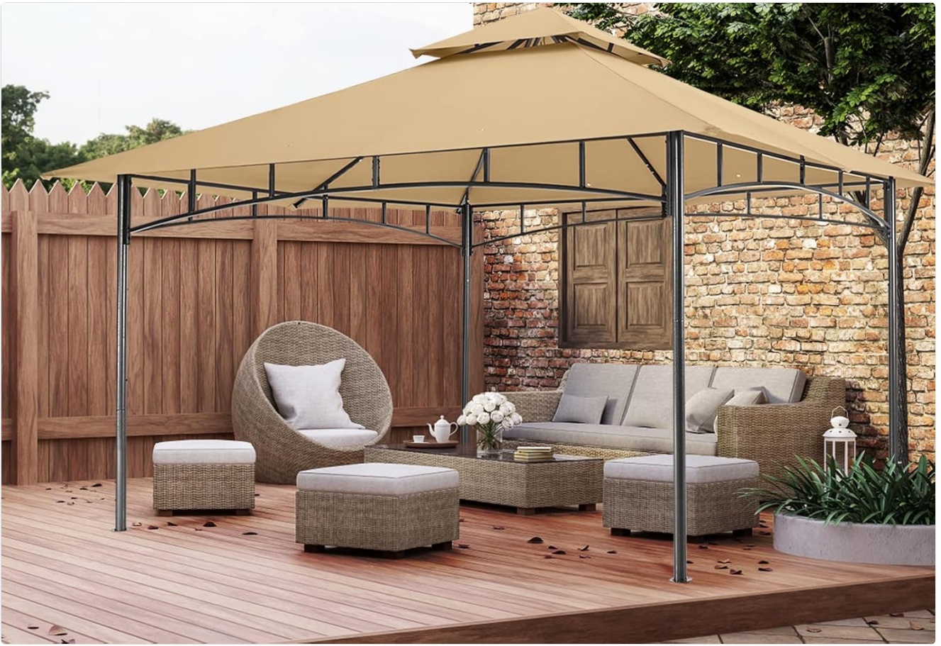
Figure 4: The sturdy top hook provides a convenient point for hanging lights or decorations.