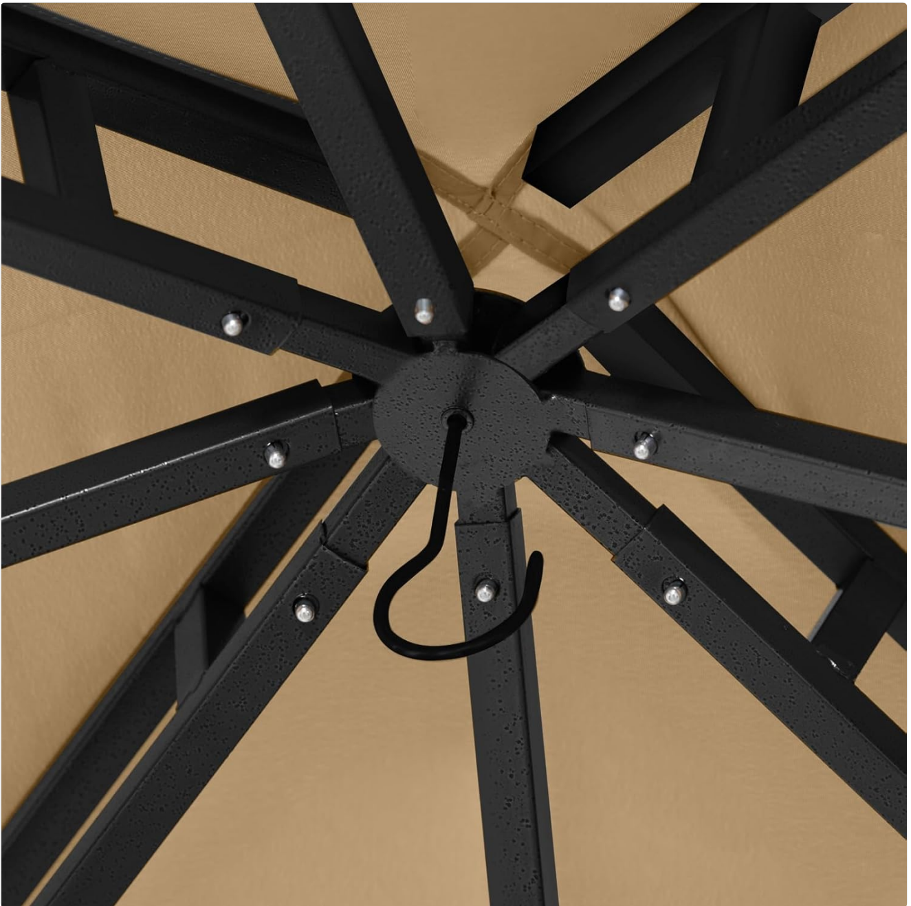
Figure 3: Close-up view of the sturdy steel frame connections, highlighting the robust construction.