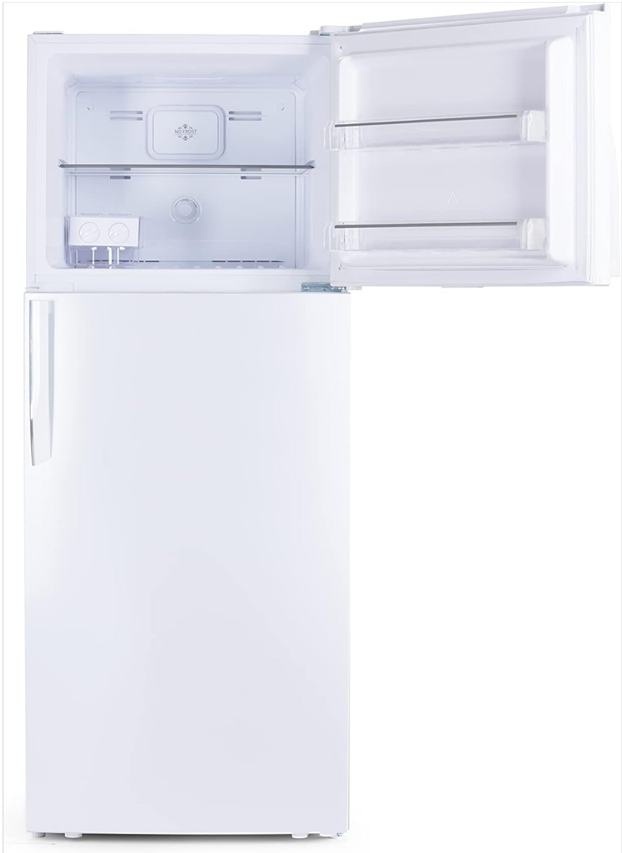
Figure 3.5: Interior view of the top-mounted freezer compartment, including a shelf and door bins.