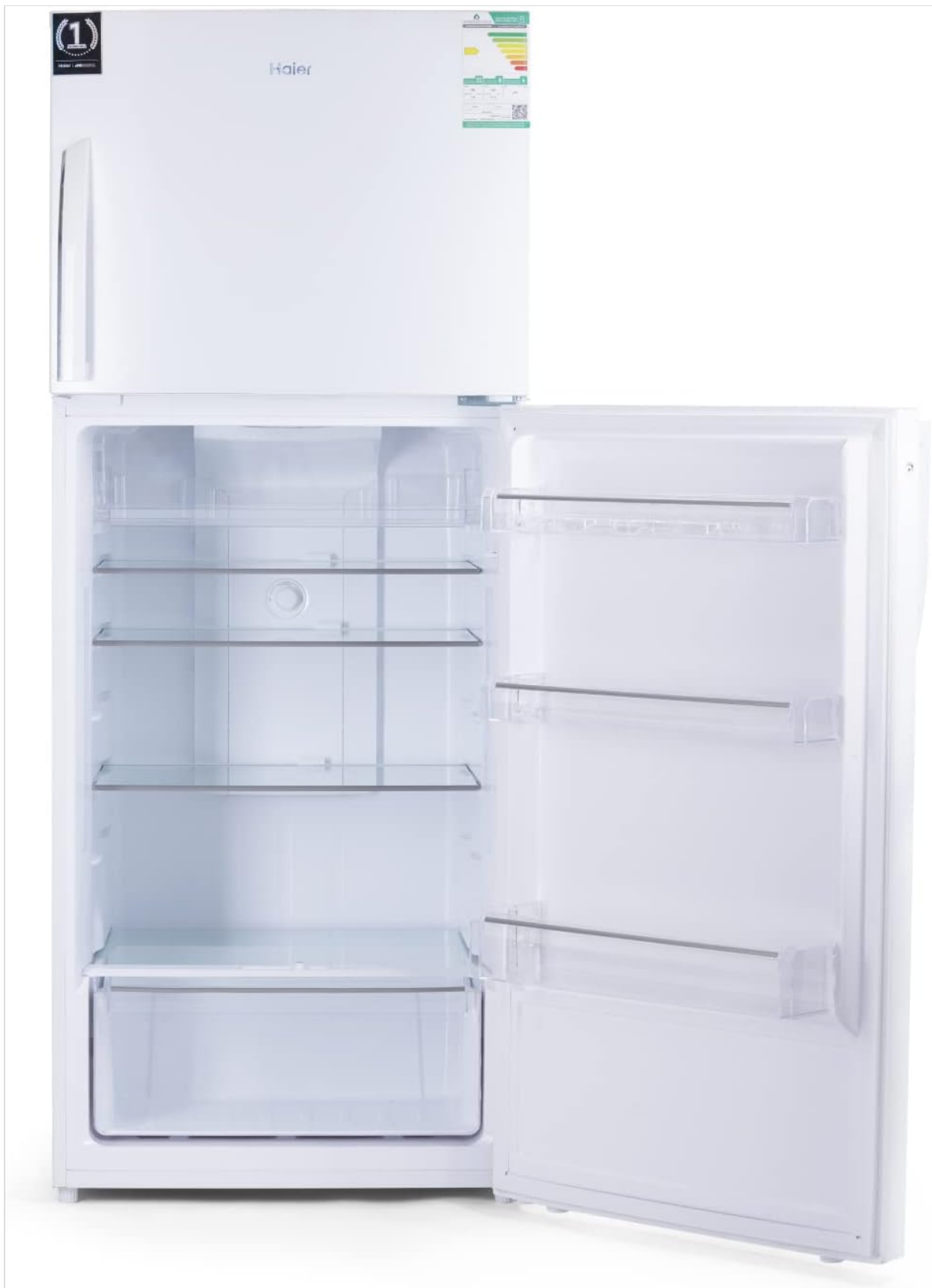
Figure 3.3: Interior view of the refrigerator compartment, showing adjustable glass shelves and door bins.