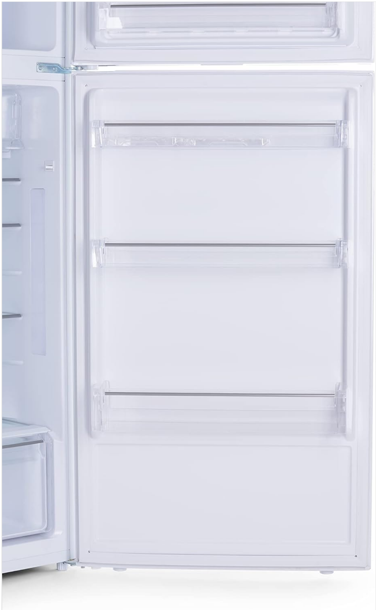
Figure 3.4: Close-up view of the door shelves in the refrigerator compartment, providing storage for bottles and smaller items.