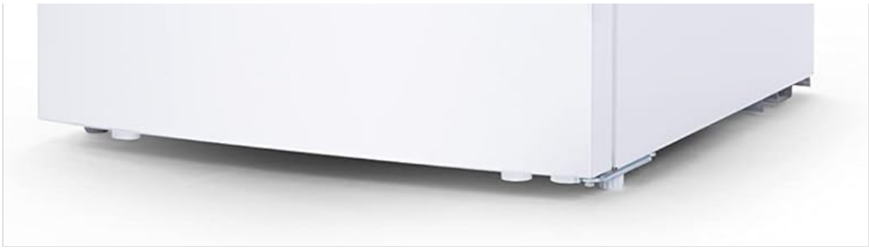
Figure 3.2: Side view of the Haier HRF-380NS-2 refrigerator, illustrating its compact design.