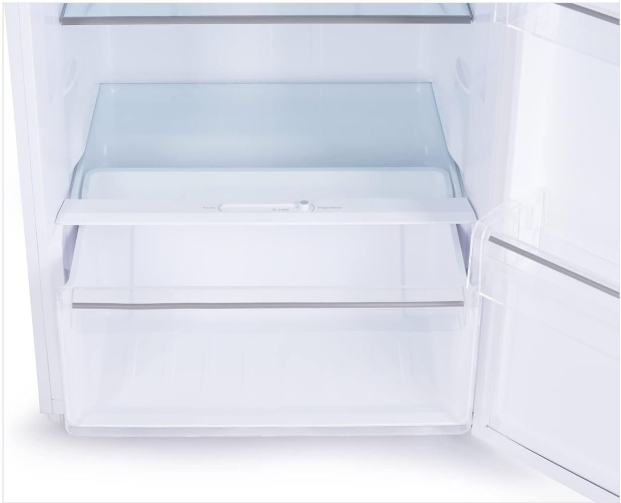
Figure 3.6: Close-up view of the two crisper drawers located at the bottom of the refrigerator compartment, designed for fresh produce.